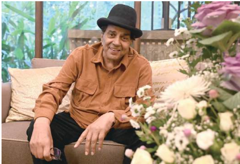
Bollywood actor Dharmendra poses for a photo on the occasion of his 88 th birthday at his residence in Mumbai on December 8, 2023. Dharmendra, who was equally at ease in romantic comedies as high-octane action blockbusters, died aged 89 yesterday.