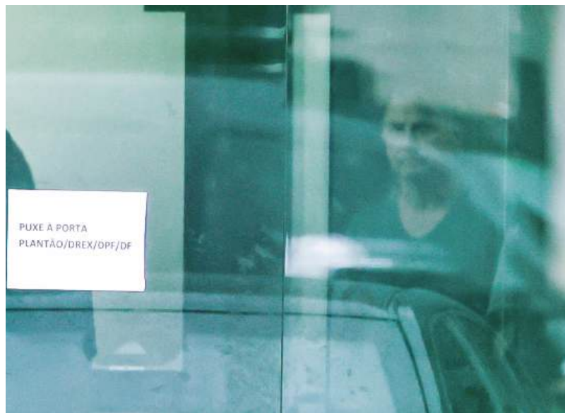
Brazil's former president (2019–2023) Jair Bolsonaro is seen through the door of the Federal Police headquarters, where he is being held, at the end of his wife Michelle's visit in Brasília on Sunday.

Later, his lawyers asked the court to reconsider the measure and return Bolsonaro to “humanitarian