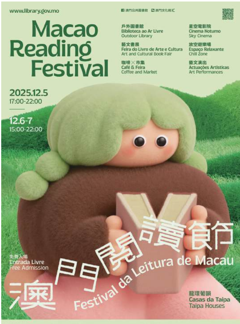
This poster provided by the Cultural Affairs Bureau (IC) yesterday promotes the Macao Reading Festival 2025, slated to start next Friday.

The National Games’ mascots “Xiyangyang” (“Joyful”) and “Lerongrong” (“Happy Harmony”) will appear onsite for photo opportunities, alongside photo installations and a lucky draw,