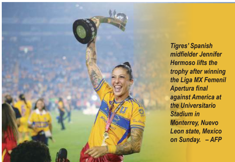
Tigres’ Spanish midfielder Jennifer Hermoso lifts the trophy after winning the Liga MX Femenil Apertura final against America at the Universitario Stadium in Monterrey, Nuevo Leon state, Mexico on Sunday.

The various games will be played at 4 a.m. today and tomorrow Macau time.