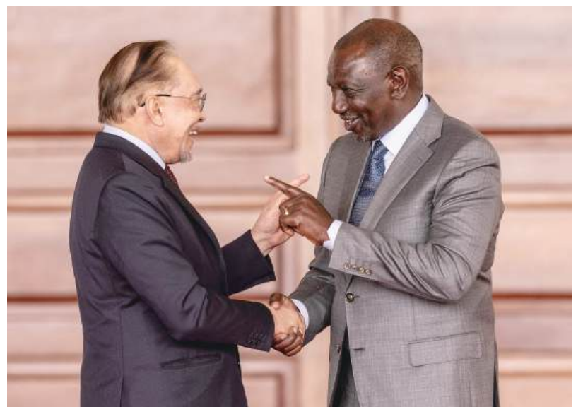
Malaysian Prime Minister Anwar Ibrahim (left), and Kenya's President William Ruto shares a light moment after a joint press conference during his state visit at Statehouse in Nairobi, Kenya yesterday.

The nuclear-armed North, however, responded by denouncing an agreement between Seoul and Washington to build nuclear-powered submarines, saying in a state media commentary that the deal would cause a “nuclear domino” effect due to the countries’ “confrontational intention”. – AFP