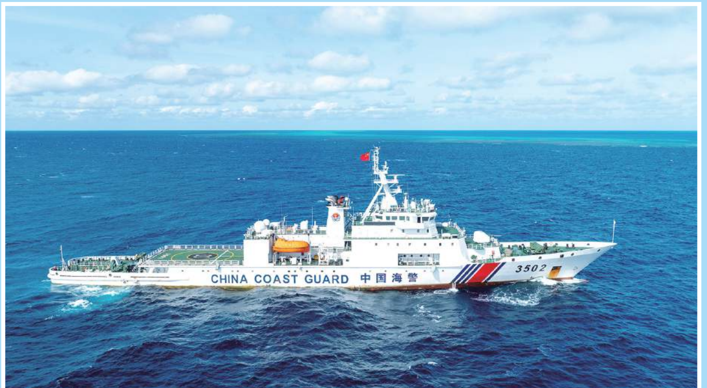
This aerial drone photo shows the China Coast Guard (CCG) patrolling in the territorial waters of China's Huangyan Dao and surrounding areas on November 14, 2025.