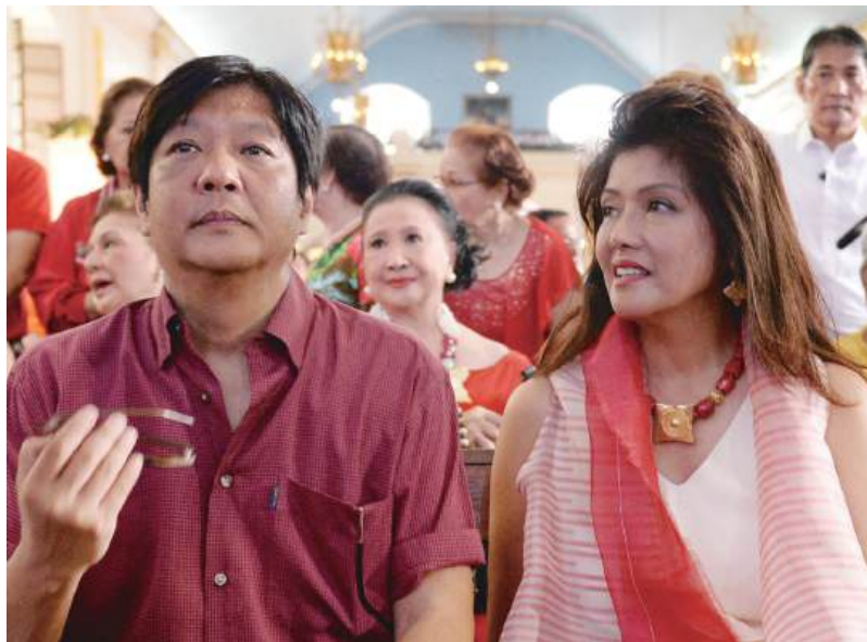
This file photo taken on July 2, 2014 shows Imee Marcos (right), then the governor of Ilocos Norte, and her brother Ferdinand Marcos Jr. as they attend mass to celebrate their mother Philippines' former first lady and congresswoman Imelda Marcos' 85 th birthday in Laoag city, Ilocos norte, north of Manila.

He went on to say that “for a while now, we’ve been very worried about my sister... The reason is because that lady you see talking on TV is not my sister,” adding that the wider Marcos family shared that view.