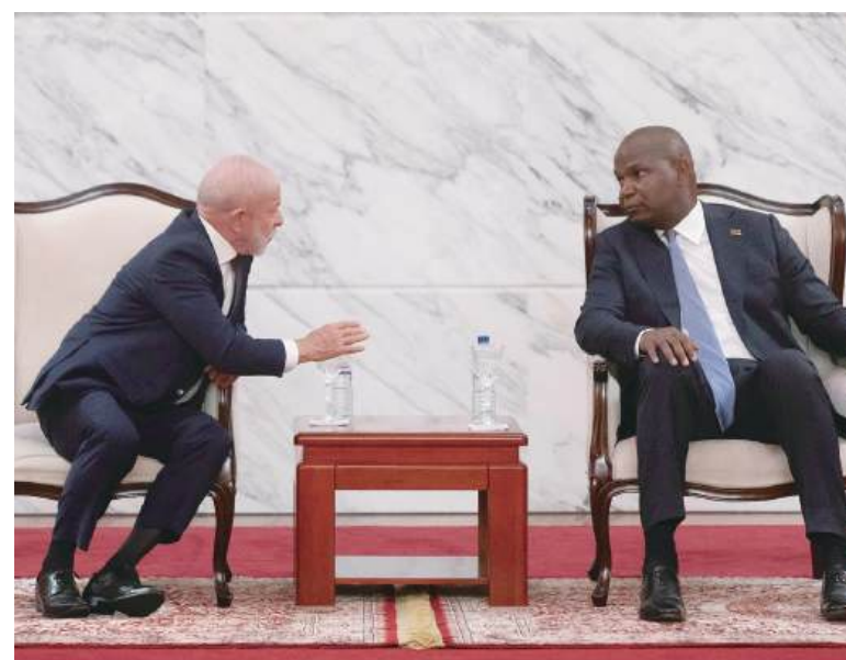
Brazilian President Luiz Inácio Lula da Silva (left) meets with Mozambican President Daniel Chapo at the Presidential Palace in Maputo yesterday. Lula da Silva arrived in Mozambique yesterday for a state visit.

Despite championing Catalan nationalism for decades, which saw Franco’s regime jail him for two years, he always argued the wealthy northeastern region should remain a part of Spain.