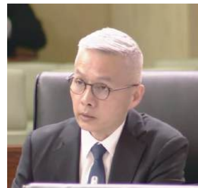
Secretary for Economy and Finance Anton Tai Kin Ip addresses yesterday's Q&A session about his portfolio's 2026 policy guidelines in the Legislative Assembly's (AL) hemicycle.

Tai also said that the Macau International Centre for Scientific and Technological Industry, covering 2,000 square metres, will be housed in an office space in a building in Nape, which was previously used for the Macao Young Entrepreneur Incubation Centre, which has been relocated to