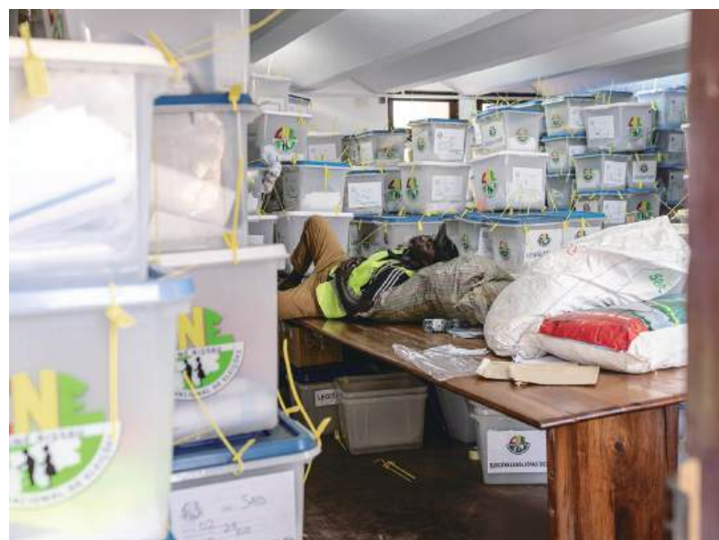
An official from the National Electoral Commission (CNE) rests in a room storing ballot boxes full of electoral materials at its headquarters in Bissau yesterday, the day after Guinea-Bissau's presidential and legislative elections. – AFP

Guinea-Bissau is among the world’s poorest countries and is also a hub for drug trafficking between Latin America and Europe, a trade facilitated by the country’s long history of political instability. – AFP