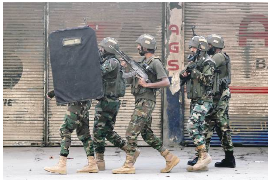
Army personnel move behind a shield at the suicide bombing site at the border force headquarters in Peshawar, Pakistan yesterday.

The province, whose capital is Peshawar, borders Afghanistan and has seen repeated bouts of militant violence