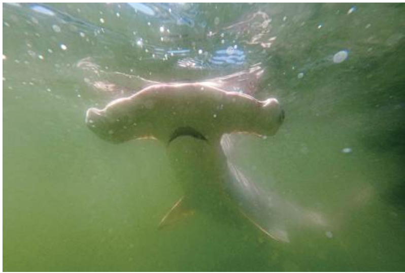
A hammerhead shark is seen during tagging and monitoring tasks in a mangrove at the Galapagos National Park, Santa Cruz island, Ecuador, on March 5, 2024. Protecting sharks, a controversial bid to allow limited rhino horn sales, and a push to restrict eel trade will be up for debate at global wildlife talks that opened yesterday. More than 180 nations will join conservation experts in Uzbekistan's Samarkand to discuss dozens of wildlife trade and protection proposals.

Anguilla anguilla, or the European eel, is considered critically endangered and was added to Appendix II in