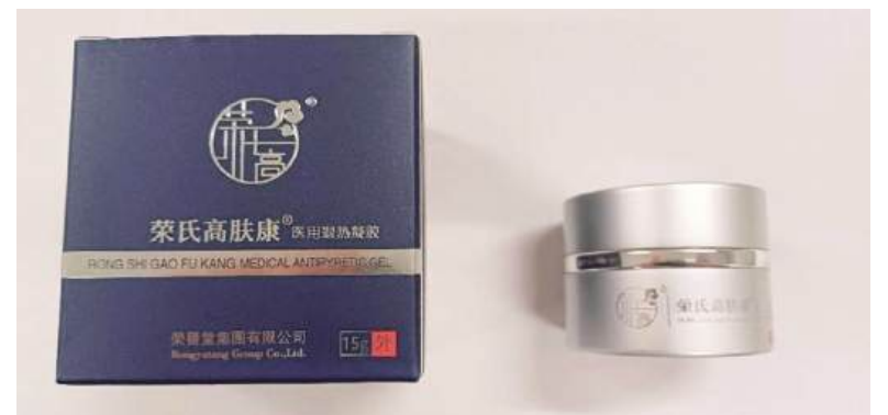
This handout photo provided by the Pharmaceutical Administration Bureau (ISAF) yesterday shows the Chinese antipyretic gel adulterated with Western drug ingredients.

The statement pointed out that clobetasol propionate is a corticosteroid medication used to treat inflammatory conditions and must be administered under medical prescription. Side effects of the drug may include moon face**,