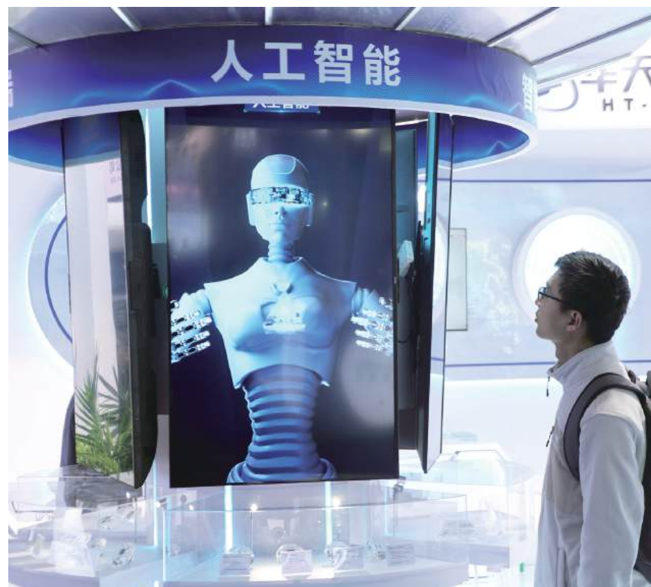
A fairgoer looks at a display at the 22 nd China International Semiconductor Expo in Beijing on Sunday. The three-day fair ends today.

Macau's most popular English-language newspaper – Your trustworthy source of news & views