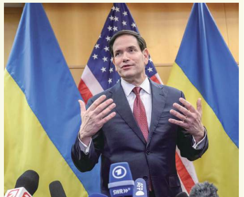
US Secretary of State Marco Rubio holds a press conference following closed-door talks on a US plan to end the war in Ukraine, at the US Mission in Geneva on Sunday.

The statement’s announcement of a new draft appeared to indicate that changes were indeed made.