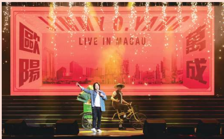
yesterday shows Chinese-American actor-comedian Jimmy O. Yang during one of his shows at Broadway Theatre in Cotai in July this year.