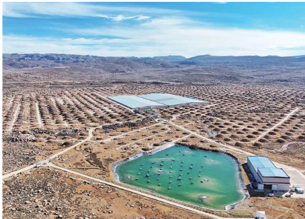
An aerial drone photo taken on Oct. 28, 2025 shows a view of the Large High Altitude Air Shower Observatory (LHAASO) in Daocheng County, Ganzi Tibetan Autonomous Prefecture, Sichuan Province. LHAASO, located at an altitude of 4,410 meters on Mount Haizi in Daocheng County, began regular operations in July 2021. It has since been recognized as a leading international facility with the world's highest sensitivity and accuracy for gamma-ray and cosmic-ray detection.

"When we first came here for site selection in the autumn of 2014, we encountered a