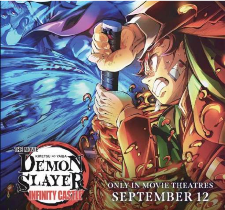
Theatrical release poster for “Demon Slayer: Kimetsu No Yaiba – Infinity Castle: Part 1”

Chinese animated fantasy “Ne Zha II” is the highest-grossing film of 2025, while Netflix’s most-watched movie ever is the animated “KPop Demon Hunters”. – AFP