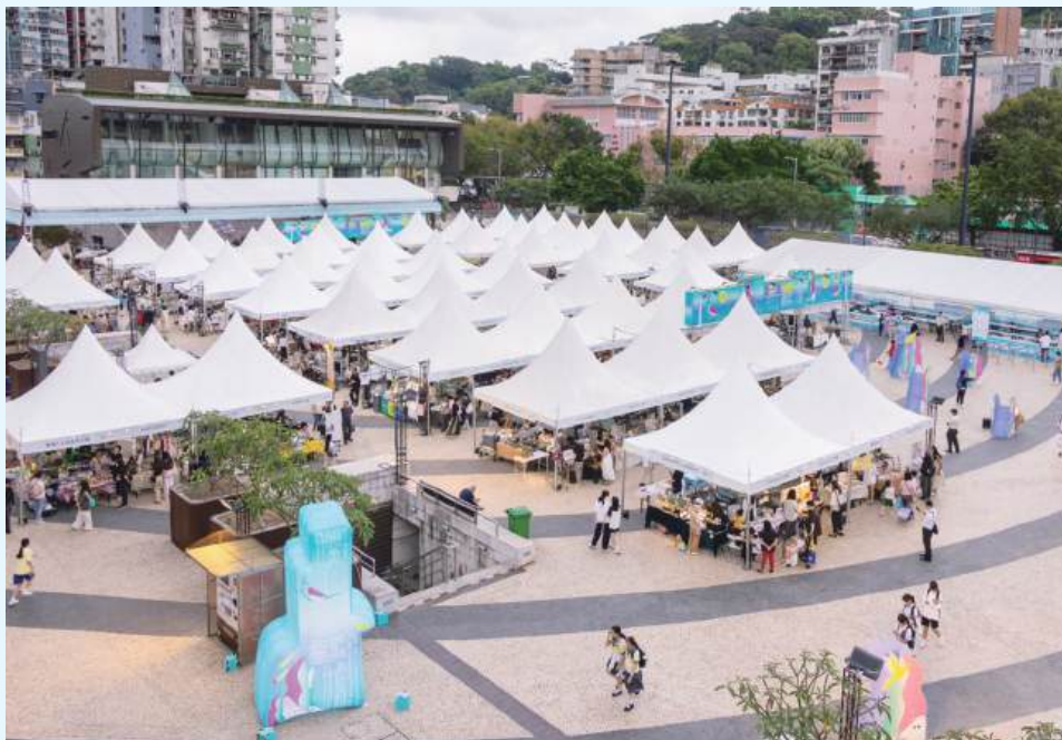
This photo provided by the Cultural Affairs Bureau (IC) on Monday shows an undated file photo of the Tap Siac Craft Market.

One can find more details by visiting www.craftmarket.gov.mo , the "Macao Craft Market" Facebook page or the IC website on www.icm.gov.mo . ■