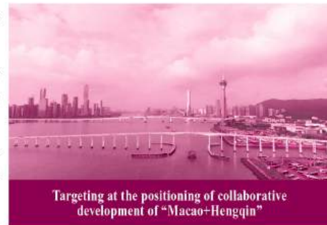
Targeting at the positioning of collaborative development of “Macao+Hengqin”