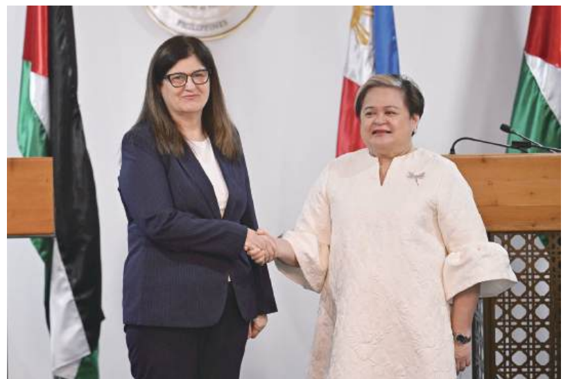
Philippines' Secretary of Department of Foreign Affairs Theresa Lazaro (right) shakes hands with Palestinian Foreign Affairs and Expatriates Minister Varsen Aghabekian Shahin after their joint press conference in Manila yesterday.

President Marcos’s son Sandro fired back yesterday, slamming the accusations as “not only false, but dangerously irresponsible”.