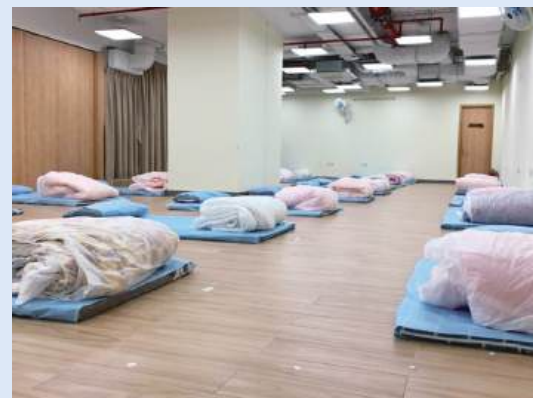
This undated handout photo recently provided by the Social Welfare Bureau (IAS) shows the cold shelter in Edifício do Bairro da Ilha Verde.

At 1:05 a.m. today, the mercury stood at