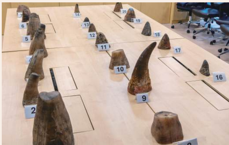
This undated handout photo released yesterday by the National Parks Board of Singapore shows rhinoceros horns seized by authorities in Singapore, after the horns and other animal parts were confiscated during inspection of a shipment bound for Laos.

The horns will now be destroyed according to CITES guidelines, the