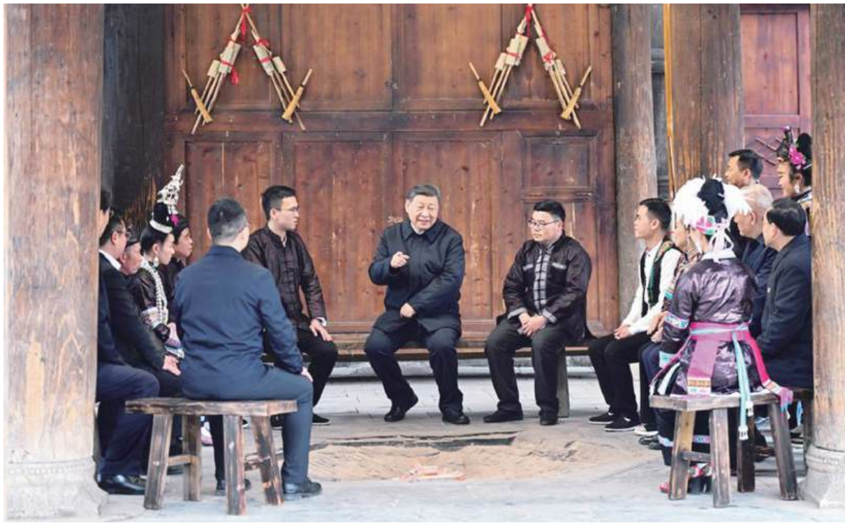
President Xi Jinping (center), also general secretary of the Communist Party of China (CPC) Central Committee and chairman of the Central Military Commission, sits with villagers around a firepit to discuss all-around rural revitalisation at a drum tower while visiting the Zhaoxing Dong village in Liping county of the Qiandongnan Miao and Dong Autonomous Prefecture, southwestern Guizhou province, on March 17, 2025.

From Hebei and Fujian to Zhejiang and Shanghai, and from advancing the rule of law at the county level to municipal and provincial levels, Xi has consistently demonstrated a steadfast