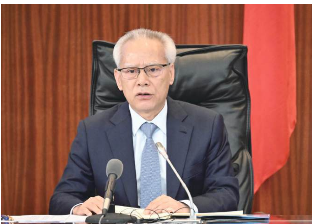
Chief Executive Sam Hou Fai delivers his 2026 Policy Address in the hemicycle of the Legislative Assembly (AL) yesterday afternoon.

While the birth allowance was increased by 20.0 percent, the other six types of pensions and allowances were raised by between 4.3 percent and 4.7 percent, retroactively effective from January this year.