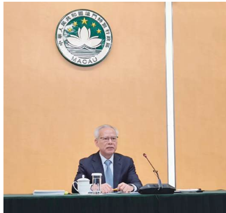
Chief Executive Sam Hou Fai addresses yesterday evening's post-policy press conference at Government Headquarters.