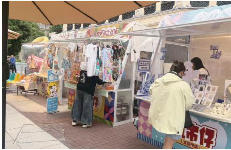
Customers browse the booths at the Macao Chill Market near Taipa Municipal Market yesterday.

Moreover, Wan suggested that the fair dates be concentrated on Fridays, Saturdays and