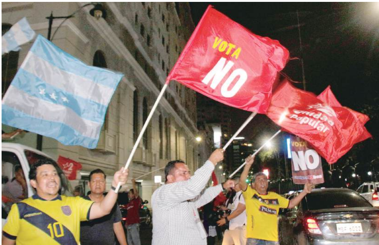
Voters celebrate following the results of a referendum in Guayaquil, Ecuador on Sunday. Ecuadoran voters rejected the return of US military bases, a damaging blow to Trump-friendly President Daniel Noboa.