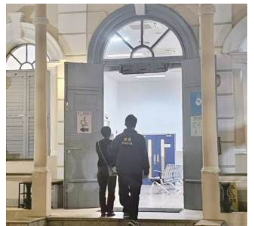
This undated handout photo provided by the Public Security Police (PSP) yesterday shows a PSP officer escorting the theft-by-finding suspect into a police station.