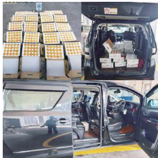
This handout photo shows the 100 kg of uninspected fruit seized from a smuggler's vehicle at the Barrier Gate on November 9.

According to the statement, the 11 smugglers comprise mainland Chinese and foreign nationals, aged between 24 and 56. In accordance with the Tobacco Control Law, the Customs Service has referred the case to the Health Bureau (SSM) for follow-up action. Three of the individuals are additionally being prosecuted for violating the External Trade Law. The cigarette-smuggling trio each face a maximum fine of 100,000 patacas, while the seized contraband has been confiscated. ■