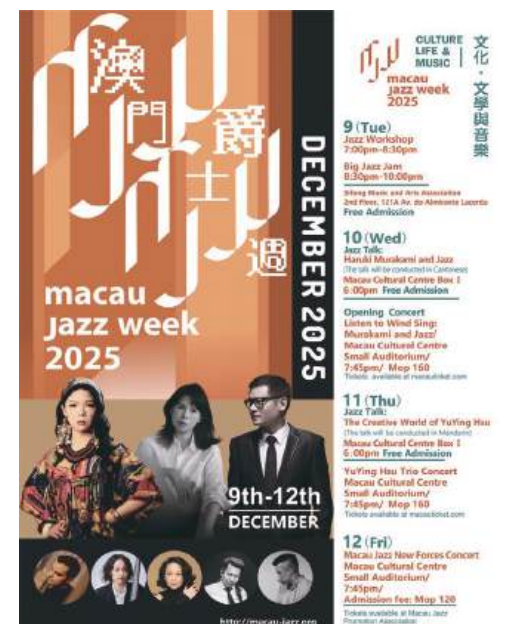
This poster provided by the Macau Jazz Promotion Association (MJPA) yesterday promotes the upcoming Macau Jazz Week 2025, slated to take place next month.

*Haruki Murakami, 76, is a Japanese writer. Throughout his career, his novels, essays, and short stories have been best-sellers in Japan and internationally, with his work translated into 50 languages and having sold millions of copies outside Japan. Some of his notable works include the novels Norwegian Wood (1987) and The Wind-Up Bird Chronicle (1994–95). — DeepSeek