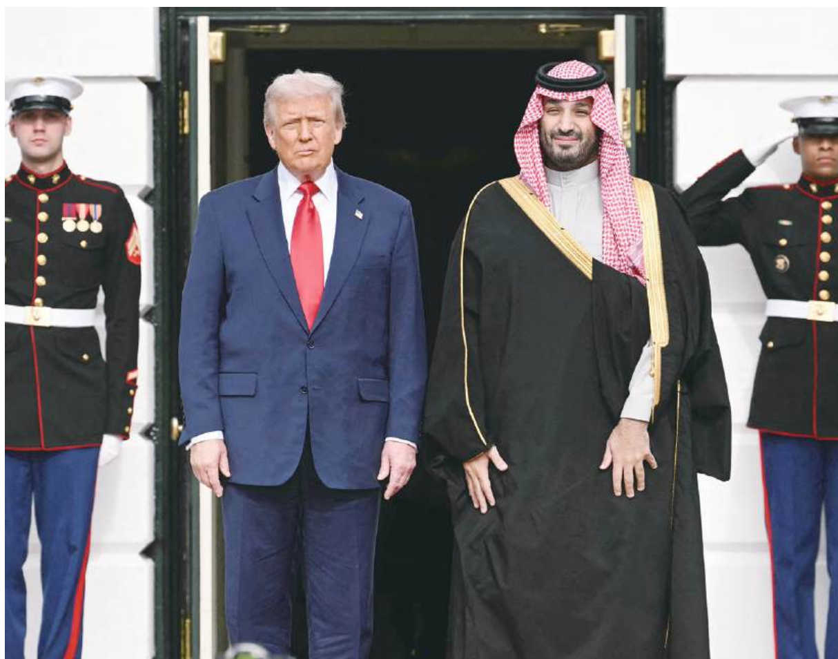
US President Donald Trump greets Crown Prince and Prime Minister of the Kingdom of Saudi Arabia Mohammed bin Salman on the South Lawn at the White House in Washington, DC, yesterday. Trump laid on a noisy military flypast featuring F-35 stealth fighters that Washington will sell to Riyadh as the de facto Saudi ruler arrived at the White House. Portugal soccer legend Cristiano Ronaldo, who plays in Saudi Arabia, was slated to attend the White House for the gala day of events, a White House official told AFP. – AFP

The tech giant has ramped up spending to meet demand for AI infrastructure and pushed a global rollout of AI features in Google Search and the company's Gemini AI models. – AFP