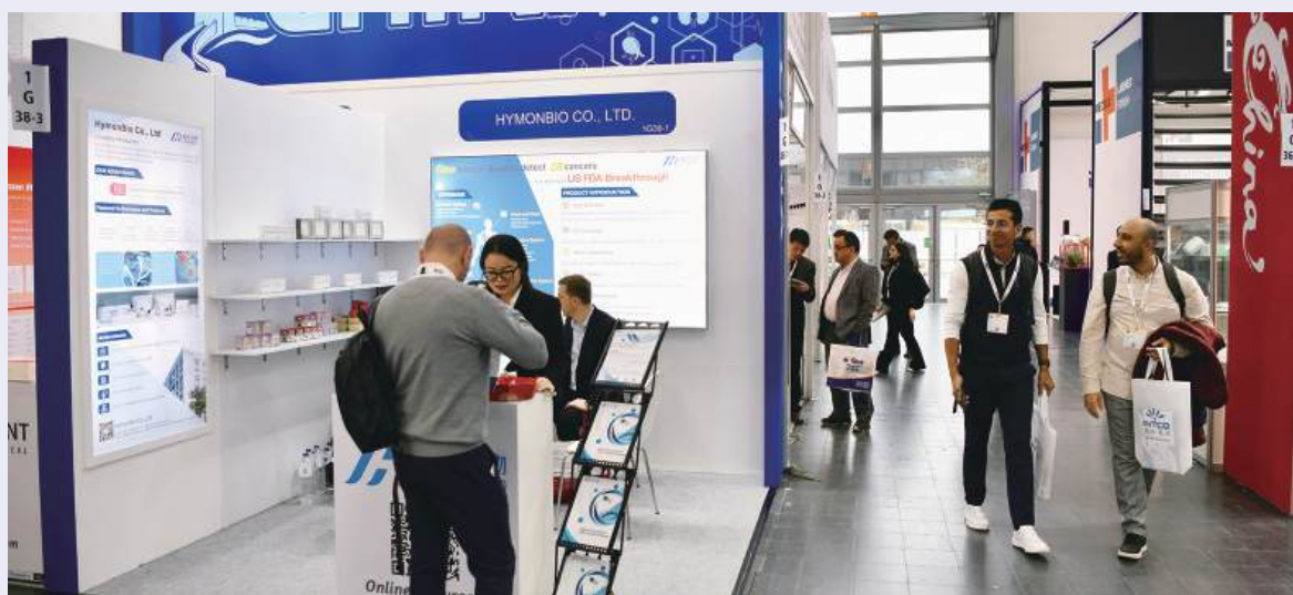
Fairgoers visit an exhibition area of Chinese firms at the Medica 2025 in Düsseldorf, western Germany, on Monday. The prominent medical device exhibition kicked off on Monday, with more than 1,300 Chinese companies attending the event. The Medica 2025 is one of the largest and most influential trade fairs of medical devices. Expecting around 80,000 visitors from over 160 countries and regions, this year's event focused on medical technology and devices, digital health, lab and diagnostics, physio technology, and disposables. Among the participants across the world, the number of Chinese enterprises was the largest from a non-European country. According to the organizer, some 70 countries and regions took part in Medica 2025, which ends tomorrow.