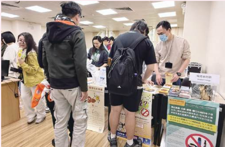
This undated handout photo provided by the Health Bureau (SSM) yesterday shows SSM Tobacco and Alcohol Prevention and Control Office officials promoting the SSM smoking cessation services and the "Tobacco Prevention and Control Law".