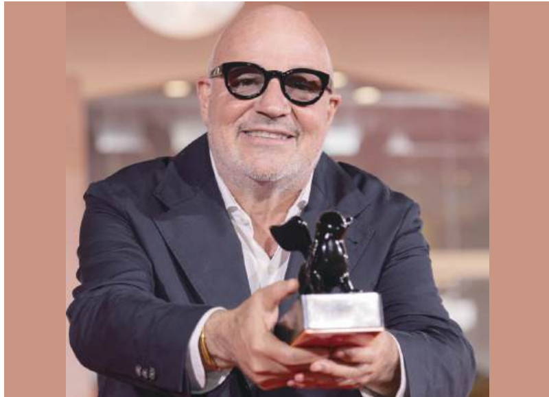
Italian-American filmmaker Gianfranco Rosi poses with his award at the 82nd Venice International Film Festival in Venice, Italy for his film “Sotto le nuvole” (“Below the Clouds”) on September 6, 2025.

For 2013’s “Sacra GRA” (“Holy Ringroad”), his breakthrough documentary, he spent two years living in a van around the ringroad