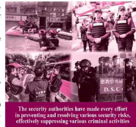
The security authorities have made every effort in preventing and resolving various security risks, effectively suppressing various criminal activities