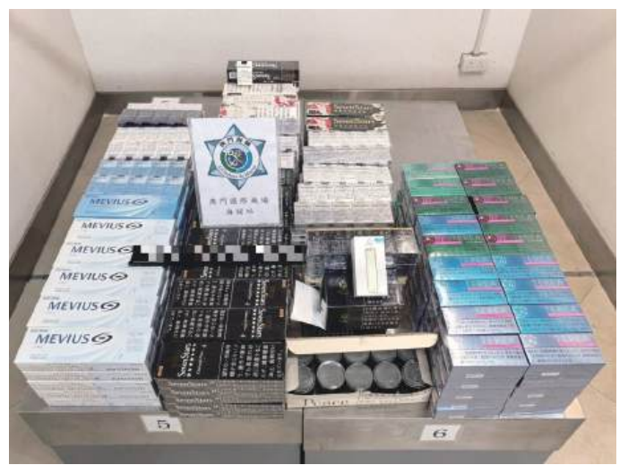
This handout photo shows cigarettes and e-cigarette cartridges seized by Macau Customs Service officers from passengers arriving from Japan at the Macau International Airport last Tuesday.