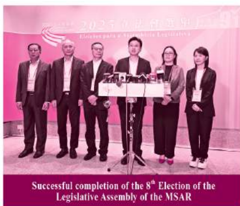
Successful completion of the 8 th Election of the Legislative Assembly of the MSAR