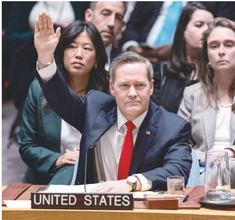
US Ambassador to the United Nations Mike Waltz raises his hand during a meeting of the UN Security Council in New York City on Monday to vote in favour of a draft resolution authorising the deployment of a temporary international stabilisation force and a transitional governance administration in Gaza.

Prime Minister Benjamin Netanyahu's office hailed Trump's plan yesterday, saying it would lead to "peace and prosperity because it insists upon full demilitarisation, disarmament and