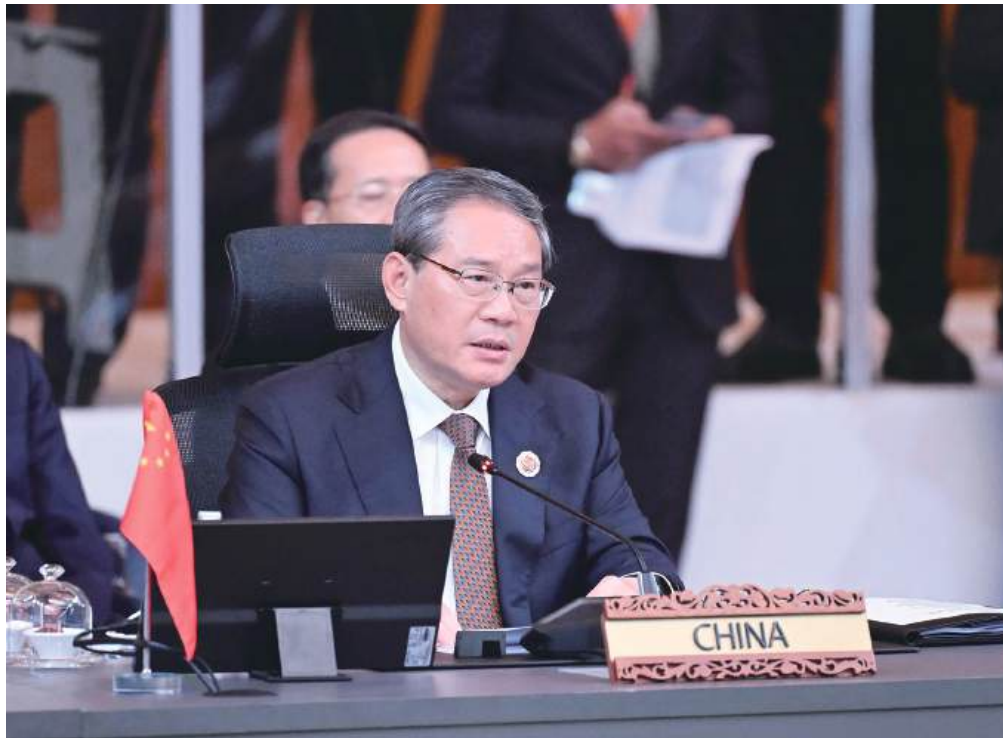
Premier Li Qiang attends the 28 th China-ASEAN Summit in the Malaysian capital Kuala Lumpur yesterday.

Today, we look back with delight on a year of fresh progress in China-ASEAN joint endeavors. Across all areas our cooperation is flourishing. Trade has been growing steadily. The "ASEAN Visa" has brought our peoples even closer. And we have just witnessed the