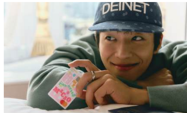
This photo provided by the Macau Government Tourism Office (MGTO) yesterday shows South Korean actor Chae Jong-hyeop holding the "KB Kookmin Travelers Check Card - Macao Edition".

The statement said that KB Financial Group subsidiary Kookmin Card is a leading credit card company in South Korea, one of Macau's top foreign visitor source markets. Visitor arrivals from the country are increasing, with MGTO recording a total of 382,494 in the first three quarters of the year, up by 12 percent year-on-year, according to official figures. ■