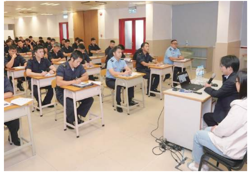
This undated and unlocated handset photo provided by the Health Bureau (SSM) shows SSM doctors conducting a training session for Fire Services Bureau (CB) paramedics a “pre-hospital stroke assessment and notification mechanism”.

*The Stroke Green Channel is a pre-established, hospital-wide protocol that prioritises stroke patients, allowing them to “bypass” typical emergency department queues and procedures. It’s an express pathway designed to get