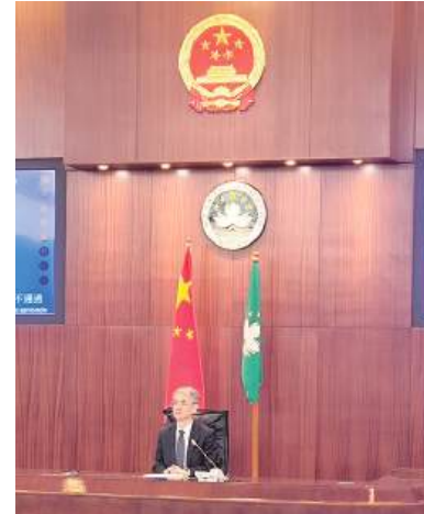
Legislative Assembly (AL) President André Cheong Weng Chon chairs yesterday's plenary session in the hemicycle when legislators were voting on the executive board's suggestion on the lists of lawmakers on the legislature's seven committees.

According to the Legislative Assembly Procedure Rules, the legislature's four-member executive board headed by the president of the Legislative Assembly suggests the number of standing committees that the legislature should have, and what they should be called, when a new four-year legislative term starts.