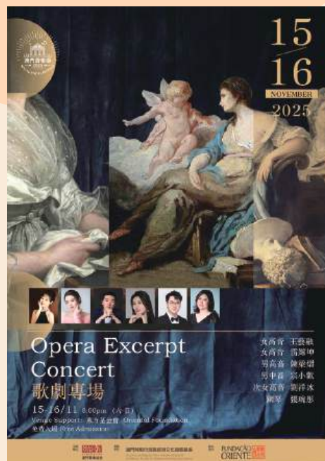
Posters of Macau Vocal Association (MVA) festival