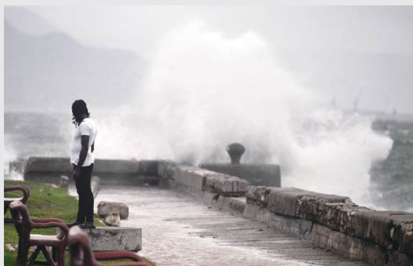
A man watches the waves crash into the coastal defence walls at the Kingston Waterfront in Jamaica's capital on Monday.

"Keep Safe Jamaica," posted Olympian sprinter Usain Bolt, one of Jamaica's most famous figures, on X.