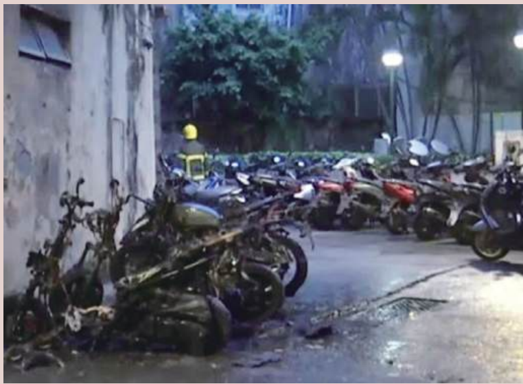
This photo taken yesterday shows the four motorcycles (front, left) burnt in a suspected arson attack.

The statement added that no one was injured or reported feeling unwell during the incident, pointing out that the case has been classified as suspected arson. ■