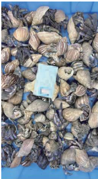
This undated and pixelated handout photo provided by Zhuhai Gongbei Customs on Friday shows 96 hermit crabs seized from a Chinese mainland smuggler on August 19.

In the statement, Gongbei Customs reminded the public that, in accordance with laws and regulations, bringing live animals and plants into the Chinese mainland without approval is prohibited.