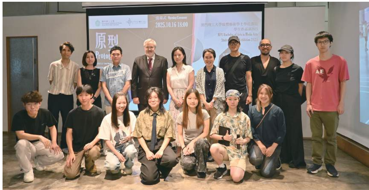
Guests, representatives and students pose during the opening ceremony of the "Prototype" exhibition at the CREATIVE MACAU – Centre for Creative Industries gallery in Nape.