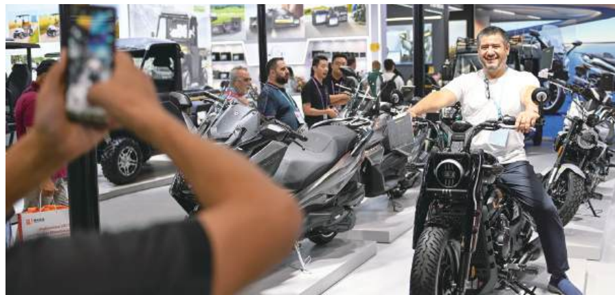
A buyer poses for a photo with a motorcycle at the motorcycle exhibition area of the 138 th edition of the China Import and Export Fair in Guangzhou yesterday. The first phase of the 138 th edition of the China Import and Export Fair, also known as the Canton Fair, concluded yesterday. According to statistics from the China Foreign Trade Center, about 157,900 overseas buyers from 222 countries and regions attended the event offline.