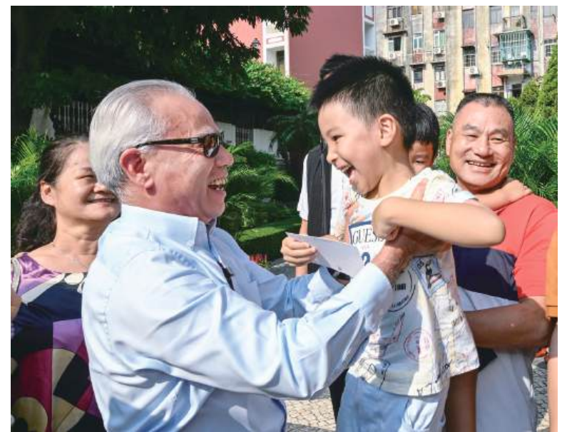
Chief Executive Sam Hou Fai lifts a boy visiting Government Headquarters with his family on Saturday, the first day of its two-day Open Day event. According to a notice issued by the Government Information Bureau (GCS) yesterday evening, the first day of the Open Day recorded 6,226 visits, while the event recorded 9,815 visits yesterday, its second and last day. Consequently, the two-day Open Day drew 16,041 in total. The event was held between 9 a.m. and 6 p.m. on the two days. This year’s floral arrangements for the two-day event were themed 15 th National Games, which will be held in Guangdong, Hong Kong and Macau between November 9 and 21. Sam told reporters during the Open Day on Saturday that the government had received 3,548 opinions from the public during a one-month period, which ended on Friday, gathering opinions and suggestions for his 2026 Policy Address, which he is scheduled to deliver to the legislature next month.

The legislature should propose sound policies and effective measures to improve the city’s social welfare grounded in its long-term sustainable development, while also building the broadest consensus in civil society to support the government in implementing major initiatives, thereby laying a solid foundation for Macau’s socioeconomic development in the long term. ■