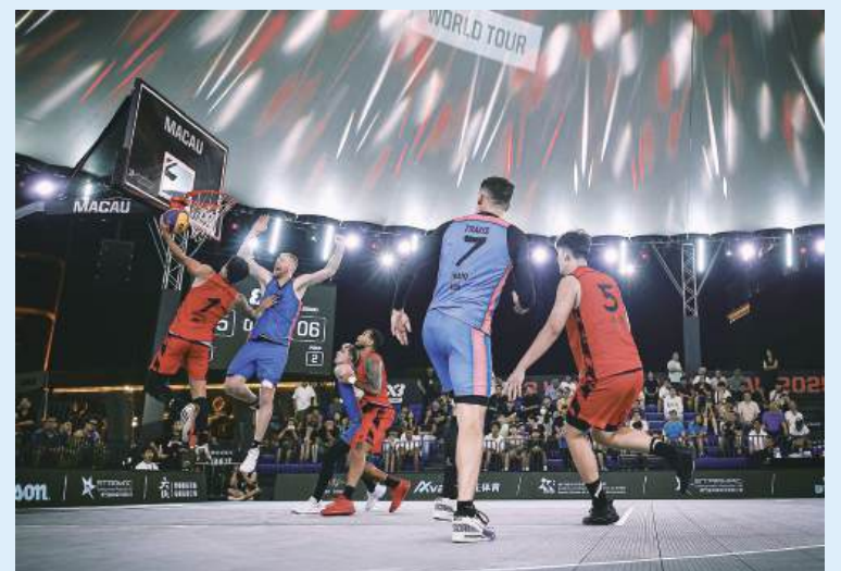
Team Lugano (in red) from Switzerland defeat Team Miami from the US at Wynn Palace in Cotai last night.

More information can be found by visiting worldtour.fiba3x3.com/2025/macau or the Sports Bureau website at www.sport.gov.mo . ■