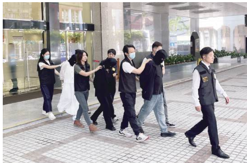
Judiciary Police (PJ) officers escort the three hooded suspects to a PJ van outside the PJ headquarters in Zape on Friday.