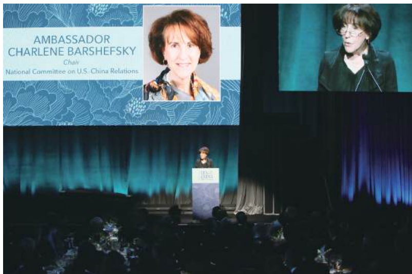
Charlene Barshefsky, former US trade representative and board chair of the National Committee on US-China Relations (NCUSCR), speaks at the annual Gala Dinner of the NCUSCR in New York City on Tuesday. Speakers at the annual gala called for continued dialogue, practical engagement and increased collaboration between Washington and Beijing to stabilize the world's most important bilateral relationship.