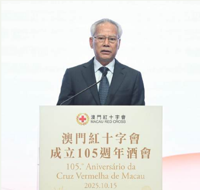
Chief Executive Sam Hou Fai addresses the 105 th anniversary reception of the Macau Red Cross at the Macau Tower Convention and Entertainment Centre yesterday. The event was also attended, among other dignitaries, by the Edmund Ho Hau Wah, the first chief executive (1999-2009) of the Macau Special Administrative Region (MSAR).

A reception was held yesterday at the Macau Tower Convention and Entertainment Center to mark the 105 th anniversary of the Macau Red Cross.