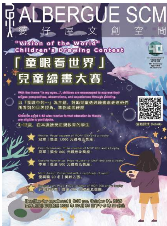
This poster downloaded from the CAC – Círculo dos Amigos da Cultura de Macau Facebook page last night shows details of their “Vision of the World” drawing competition.

The participants can submit their works until 5:30 p.m. on October 31. More details can be found by visiting the CAC Facebook page. ■