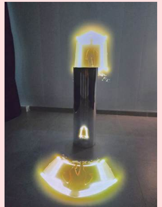
U Ka Kit's Resolve display projections on the floor, a silver pillar, and on a wall.

Depending on the viewer's angle, the movement can be perceived as walking forwards or backwards, creating an optical illusion. This work symbolises the cyclical nature of Macau as a tourist city and explores the tension between passive reception and active creation. By immersing themselves in this distorted spatial environment, viewers are prompted to reflect on the motivations and interactions of those who traverse the city.