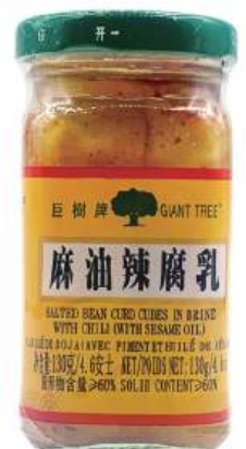
This undated handout photo downloaded last night from the “wellcome” online supermarket shows the Giant Tree Brand’s “Salted Bean Curd Cubes in Brine With Chili (With Sesame Oil)” product that was found to contain 180,000 Bacillus cereus per gram and, consequently, has been ordered by the authorities in Hong Kong and Macau to be taken off the shelves.

*Its Latin name describes the bacterium as a tiny, rod-shaped organism that has a waxy appearance. – DeepSeek