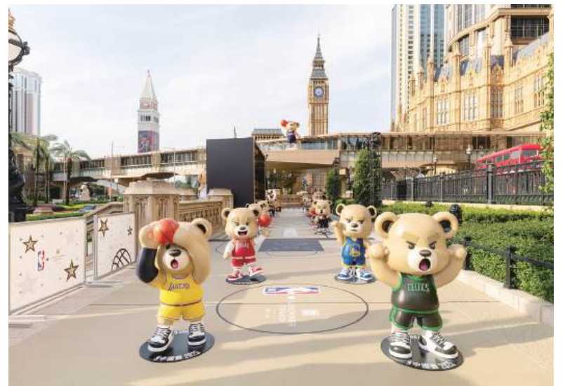
This photo provided by Sands China on Tuesday shows some of the statues that are displayed at The Londoner Macao for the ongoing G Bear Exhibition.

Outside of the games, Macau's first NBA House took place from October 8 to 12 and featured a raft of other activities, with the immersive fan event headlined by NBA legends including Tim