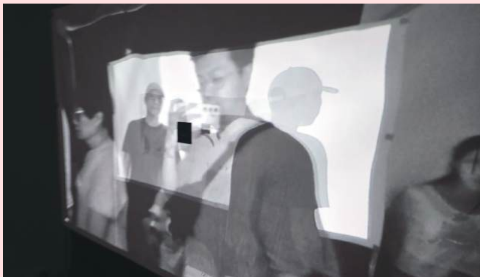
This photo shows myself taking this photo a few seconds earlier.

Cheong Ka Kit's Re:lections creates a dialectical space between perception and reality using delayed projection technology. Several projectors and cameras are used to display visitors' own reflections with a delay of several seconds. This interactive artwork explores