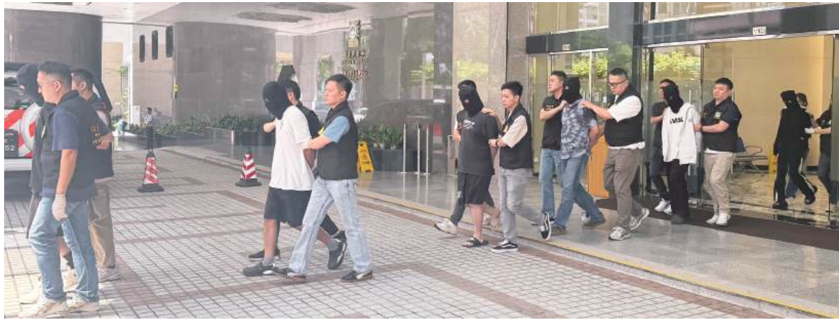
Judiciary Police (PJ) officers escort the six hooded suspects to a PJ van outside the PJ headquarters in Zape yesterday.