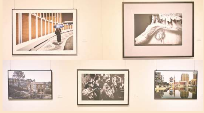
Photos of the ongoing “Halftone Exhibition ‘25’” taken yesterday