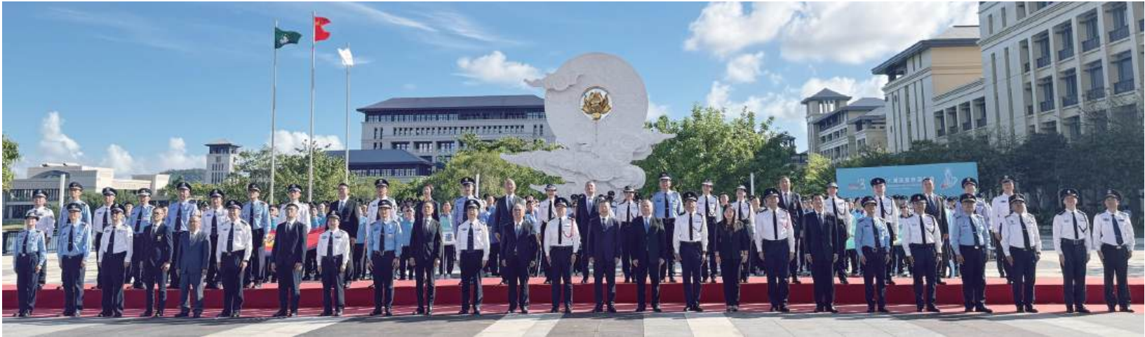
Secretary for Security Wong Sio Chak (front, twelfth from left), flanked by other senior officials and guests, pose for a group photo during yesterday’s opening ceremony for the 3 rd “Guangdong-Hong Kong-Macao Greater Bay Area Police Games” on the Hengqin campus of the public University of Macau (UM).

Secretary for Security Wong Sio Chak noted in a speech that the games feature six major competitions, including pistol shooting, dragon boat racing, seven-a-side football, three-skill challenge*, badminton,