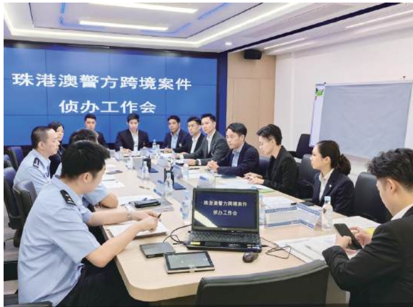
This undated handout photo provided by the Judiciary Police (PJ) yesterday shows officials from Guangdong, Hong Kong and Macau police departments convening for a meeting to discuss a cross-broder prostitution ring case.

According to the PJ spokesman, the online solicitation platform had been operational since January, posting about 2,500 advertisements for prostitution and charging each prostitute 300 yuan per post, resulting in estimated illegal profits of at least 750,000 yuan. The platform was managed by three administrators, who posted 30 to 40 advertisements daily and concealed the flow of funds through virtual currency transactions. ■