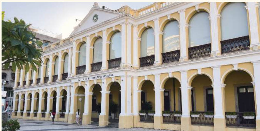
Pedestrians walk past the Cultural Affairs Bureau (IC) headquarters in Praça do Tap Siac yesterday.

For more information on the bidding requirements, please visit the bureau's official website www.icm.gov.mo . ■