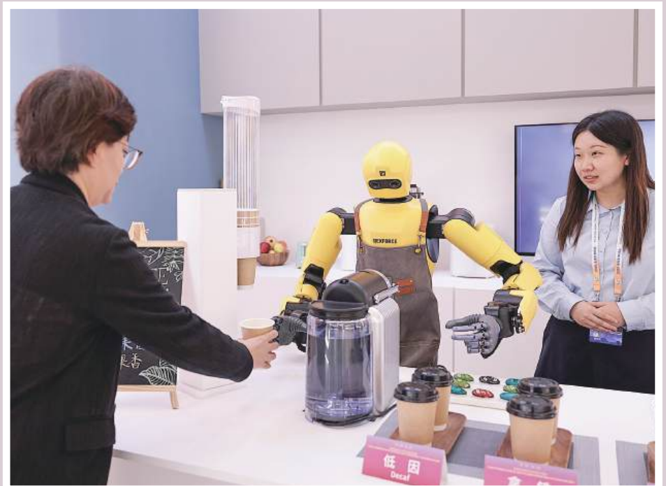
A visitor takes a cup of coffee made by a robot during an exhibition showcasing China's progress in digital and intelligent empowerment for women and girls, in Beijing yesterday. The exhibition opened yesterday as a side event of the Global Leaders' Meeting on Women. (More on pages 6 & 7)