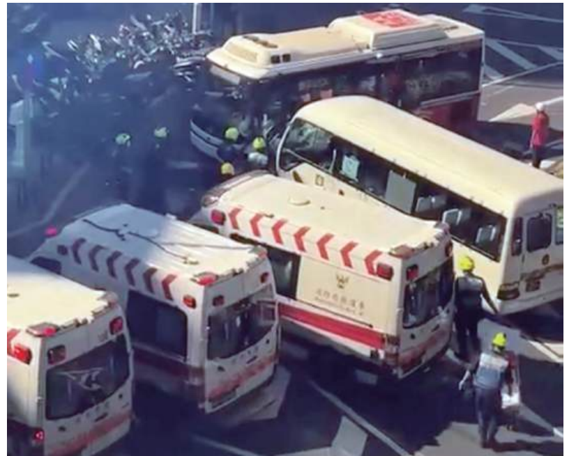
This photo circulating on social media platforms shows a Judiciary Police (PJ) passenger van after colliding with a TCM public bus on Estrada do Canal dos Patos (鴨涌馬路) yesterday.

According to a separate statement released by the Judiciary Police yesterday, PJ officers went to Kiang Wu Hospital and expressed their regret to the injured