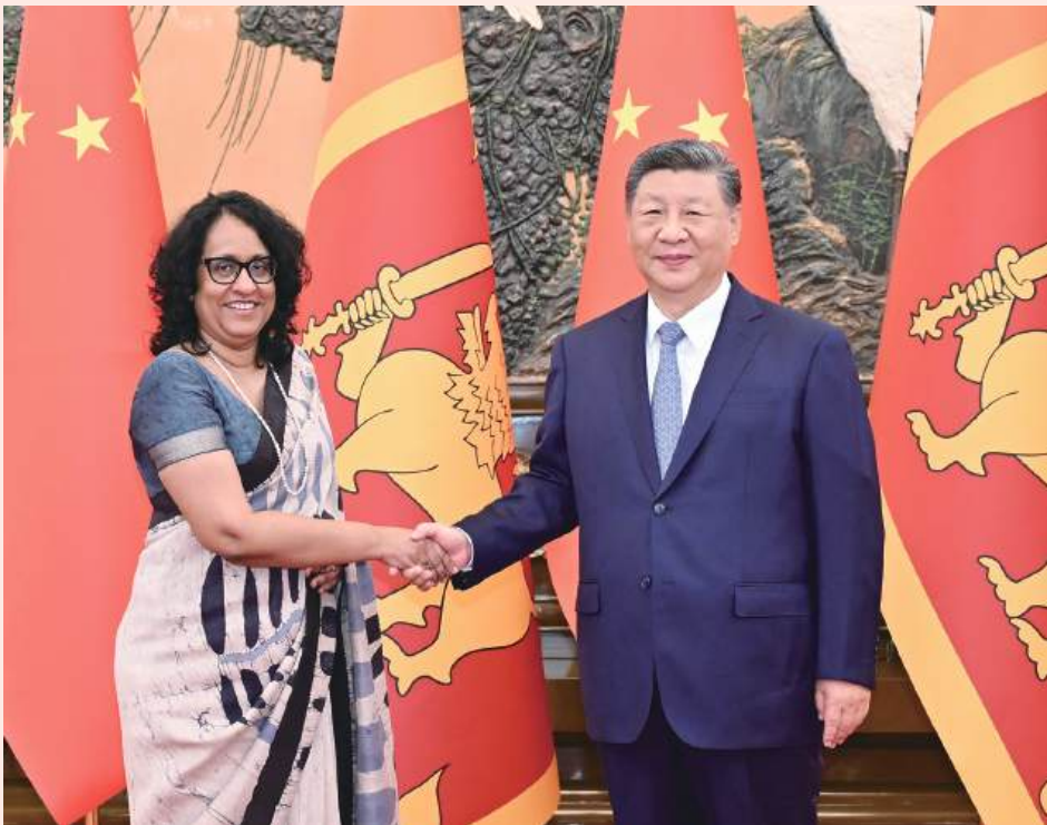
President Xi Jinping (right) shakes hands with Sri Lankan Prime Minister Harini Amarasuriya, who is in Beijing for the Global Leaders' Meeting on Women, at the Great Hall of the People in Beijing yesterday.