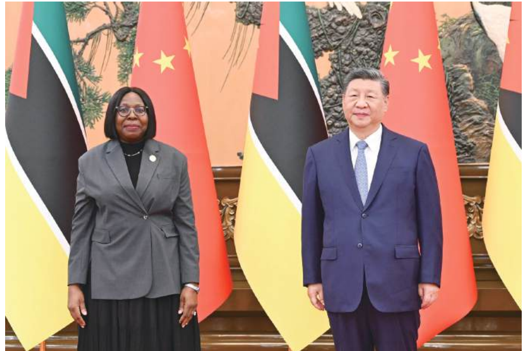
President Xi Jinping (right) poses with Prime Minister of Mozambique Maria Benvinda Delfina Levi, who is in Beijing for the Global Leaders' Meeting on Women, at the Great Hall of the People in Beijing yesterday.