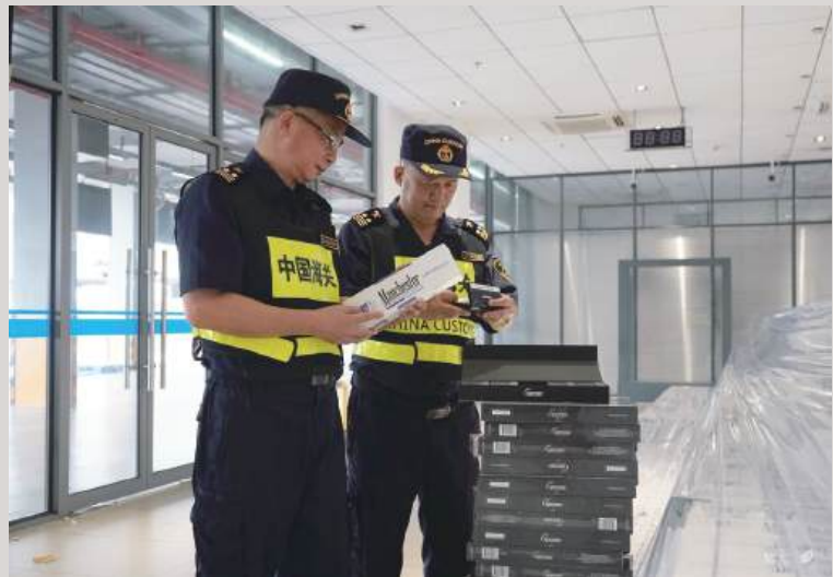
This undated handout photo provided by Gongbei Customs yesterday shows its officers checking the smuggled cigarettes seized from a lorry at the outbound cargo inspection area of the Hong Kong-Zhuhai-Macao Bridge (HZMB) on October 4.

Gongbei Customs reminded the public that in line with the Chinese mainland’s Tobacco Monopoly Law the state has implemented a monopoly management system for the production, sale, import, and export of tobacco products, operating under a tobacco monopoly licence system. The export of cigarettes requires approval from the administrative department under the State Council in charge of tobacco monopoly and the acquisition of a tobacco monopoly licence. ■