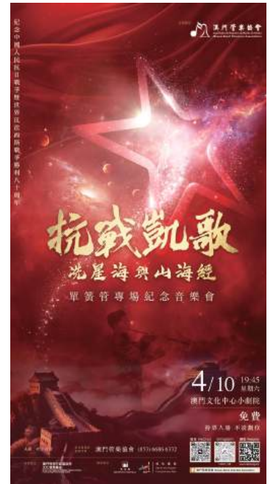
This poster was provided by the Macau Band Directors Association.

*Xian was born into a Tanka (boat dwelling) family in Macau in 1905, and his father died before he was born. His Cantonese name is Sin Sing Hoi. He moved frequently with his mother, living in Singapore and Guangzhou. In 1938, he relocated to Yan'an, where he became the dean of the Music Department at the Lu Xun Institute of Arts. There, he composed the famous "Yellow River Cantata."