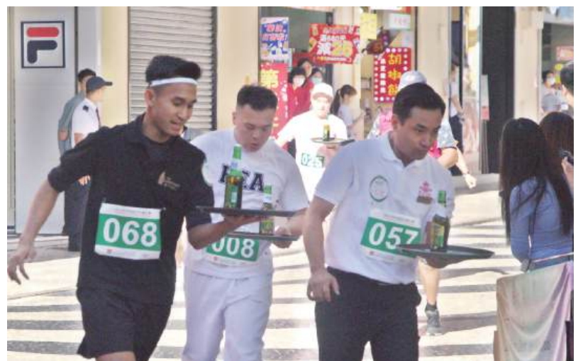
This photo shows contestants from different companies, running down the lanes while balancing a beer on a tray safely through the city's main square, Largo do Senado, on Saturday afternoon.

World Tourism Day 2025, themed "Tourism and Sustainable Transformation" this year, aimed to highlight the transformative potential of tourism as an agent of positive change, the statement concluded. ■