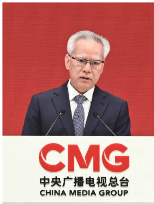
Chief Executive Sam Hou Fai delivers a speech during yesterday's ceremony at the Forum Macao Complex marking the premiere of "Xi Jinping's Cultural Story" and "Xi Jinping's Economic Thought Series Lectures" in Macau.

Sam vows locals will 'tell China's stories well'