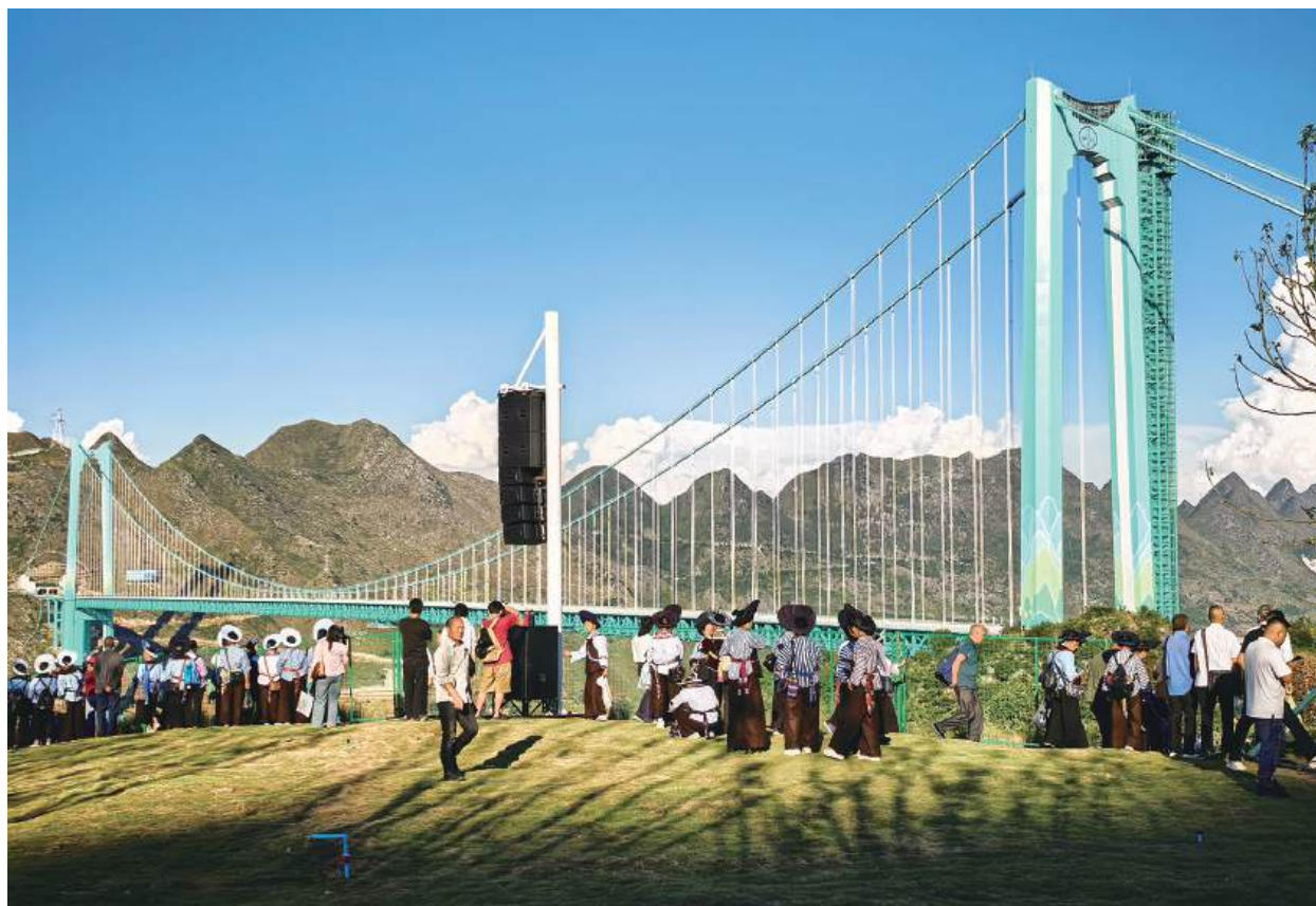
This photo taken yesterday shows tourists viewing the Huajiang Grand Canyon Bridge in Guizhou Province. The world's tallest bridge opened to traffic yesterday morning, slashing travel time across a deep canyon from two hours to just two minutes after three years of construction. The Huajiang Grand Canyon Bridge, soaring 625 meters above the Beipan River in Guizhou's mountainous terrain, is nearly nine times as tall as San Francisco's Golden Gate Bridge. With a main span of 1,420 meters, the project has become the world's longest-span steel truss girder suspension bridge in mountainous terrain, according to Guizhou provincial authorities. Spanning the Huajiang Grand Canyon, dubbed "the Earth's crack," the 2,890-meter-long structure is the latest addition to the rapidly expanding infrastructure network of the world's second-largest economy.