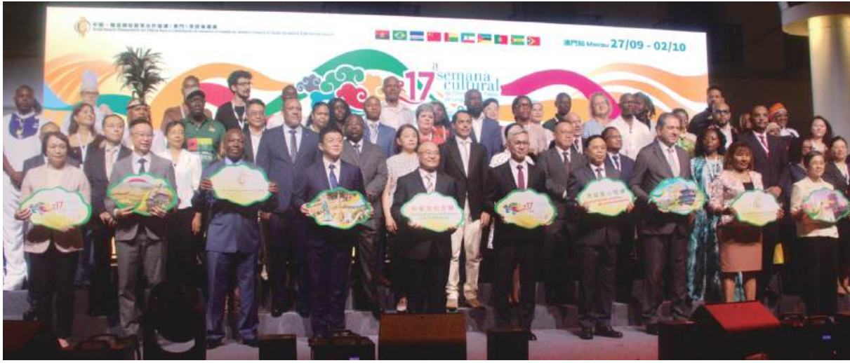
This photo shows representatives of Portuguese-speaking countries and officials from the local and central governments posing for a group photo during the opening ceremony of the 17 th Cultural Week of China and PSCs at Macau Fisherman's Wharf in Nape last night.