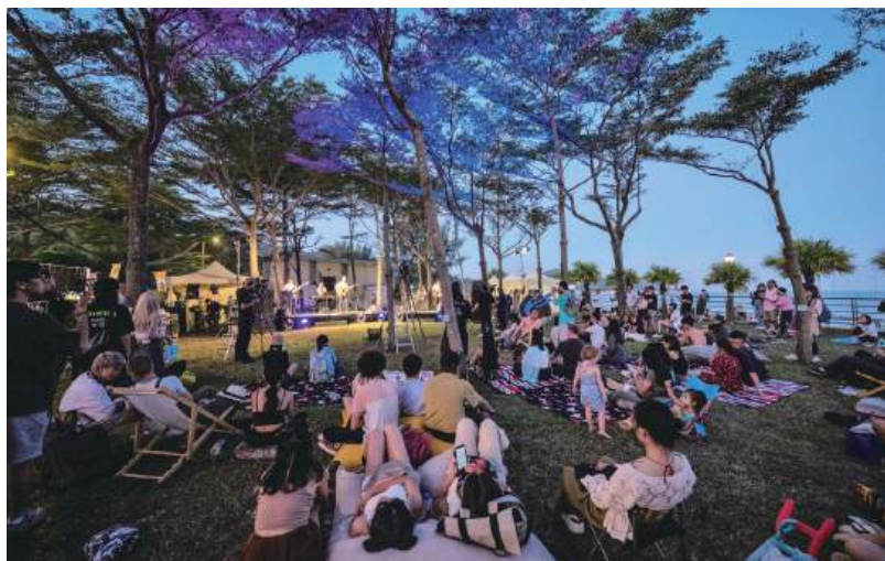
This undated handout photo recently provided by the Cultural Affairs Bureau (IC) shows the "Music Chill" area during a previous "hush! Beach Concerts" event.

For enquiries, one can contact the bureau on 8399 6802 or via email at hush@icm.gov.mo . ■