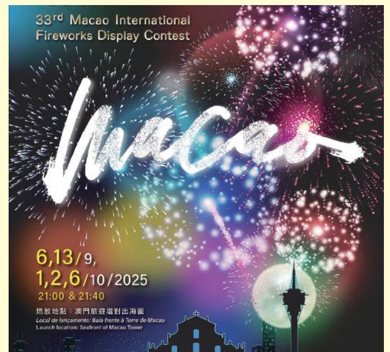
This poster provided by the Macau Government Tourism Office (MGTO) on Friday shows the rescheduled dates for the "33 rd Macao International Fireworks Display Contest".

For more details, one may visit the official event website on https://fireworks.macaotourism.gov.mo . ■