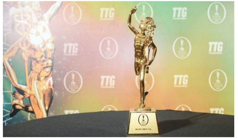
This handout photo provided by the Commerce and Investment Promotion Institute (IPIM) on Friday shows the "Best BT-MICE City" award.

* The term BT-MICE City refers to a city that excels in the fields of Business Travel, Meetings, Incentives, Conventions, and Exhibitions.