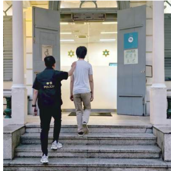
This undated handout photo provided by the Public Security Police (PSP) yesterday shows a PSP officer escorting the sexual harassment suspect into a police station.

Ho has been transferred to the Public Prosecutions Office (MP),