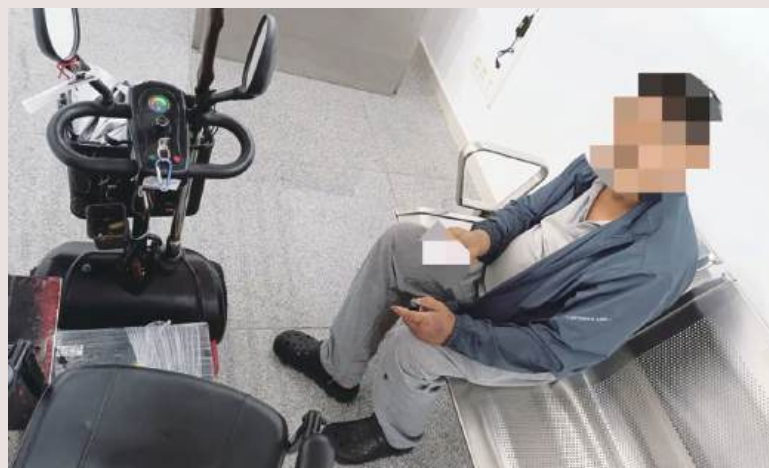
This undated handout photo provided by Zhuhai's Gongbei Customs yesterday shows the smuggler pointing at 10 laptops seized by the customs officers at Zhuhai's Gongbei border checkpoint on Sunday.