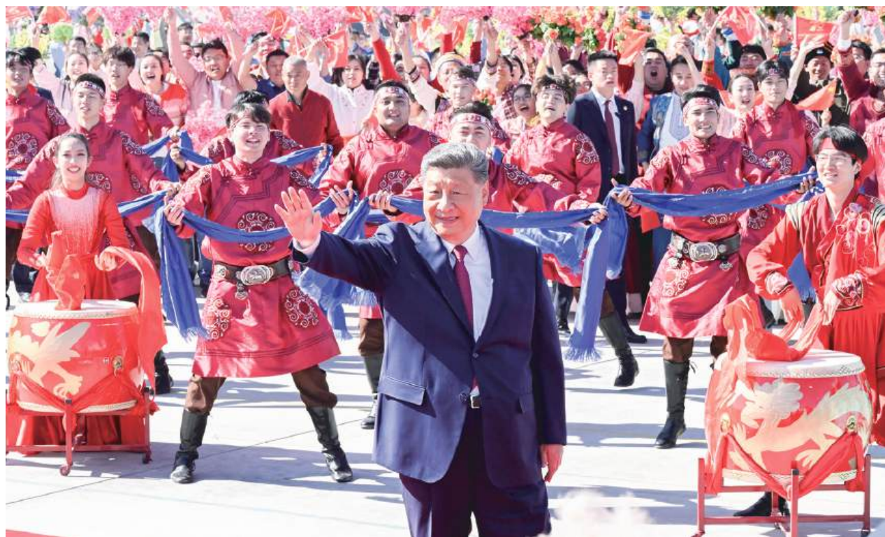
President Xi Jinping, also general secretary of the Communist Party of China (CPC) Central Committee and chairman of the Central Military Commission, waves to the crowds gathering to see him off at Urumqi Tianshan International Airport in northwest China's Xinjiang Uygur Autonomous Region, yesterday. Xi left Xinjiang Uygur Autonomous Region for Beijing yesterday after attending events in celebration of the autonomous region's 70th founding anniversary.

URUMQI – President Xi Jinping yesterday attended a grand gathering in celebration of the 70 th founding anniversary of the Xinjiang Uygur Autonomous Region in Urumqi, capital of this region in northwest China.