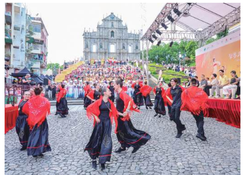
This undated handout photo provided by the Education and Youth Development Bureau (DSEDJ) on Friday shows a glimpse of the International Youth Dance Festival 2024's "Student and Youth Show in Celebration of Macau's Return to the Motherland" in front of the UNESCO World Heritage-listed Ruins of St. Paul's.

Registration is now open; all performers must be between the ages of 13 and 35, and are all encouraged to take part, the statement said. More information can be found on the DSEDJ's official webpage through https://portal.dsedj.gov.mo/websejspace/site/dance/index-e.jsp . ■