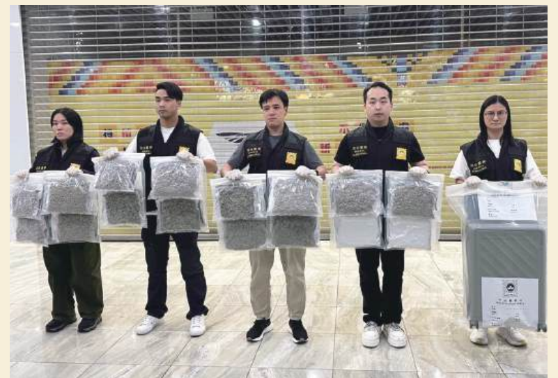
Five PJ officers show journalists the cannabis buds seized from the suspect and his suitcase during last night's press briefing at the airport.