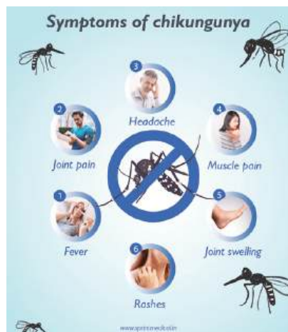
This poster shows the symptoms of Chikungunya.

The statement added that in response to the three cases, the bureau has launched special mosquito eradication operations in the vicinities of their respective homes and workplaces as a precautionary measure. ■