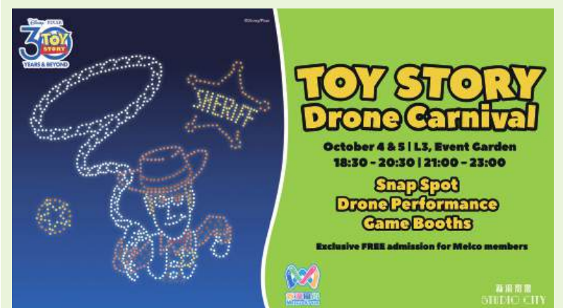
This poster provided by Studio City yesterday promotes the upcoming "Toy Story Drone Carnival".

Aside from the shows, the statement said that there will be carnival game booths featuring prizes, along with Toy Story-themed beverages, among others. Other highlights, the statement said, include a 6-metre Woody inflatable at the Event Garden for guests to "enjoy the carnival atmosphere", according to the statement. ■