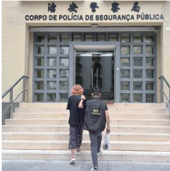
This undated handout photo provided by the Public Security Police (PSP) yesterday shows a PSP officer escorting the liquid-spraying suspect into a police station.