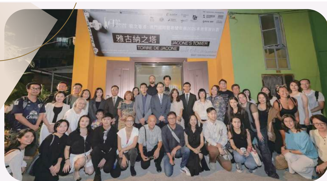
Artists and guests pose in front of No. 3 Travessa dos Poços on September 19.