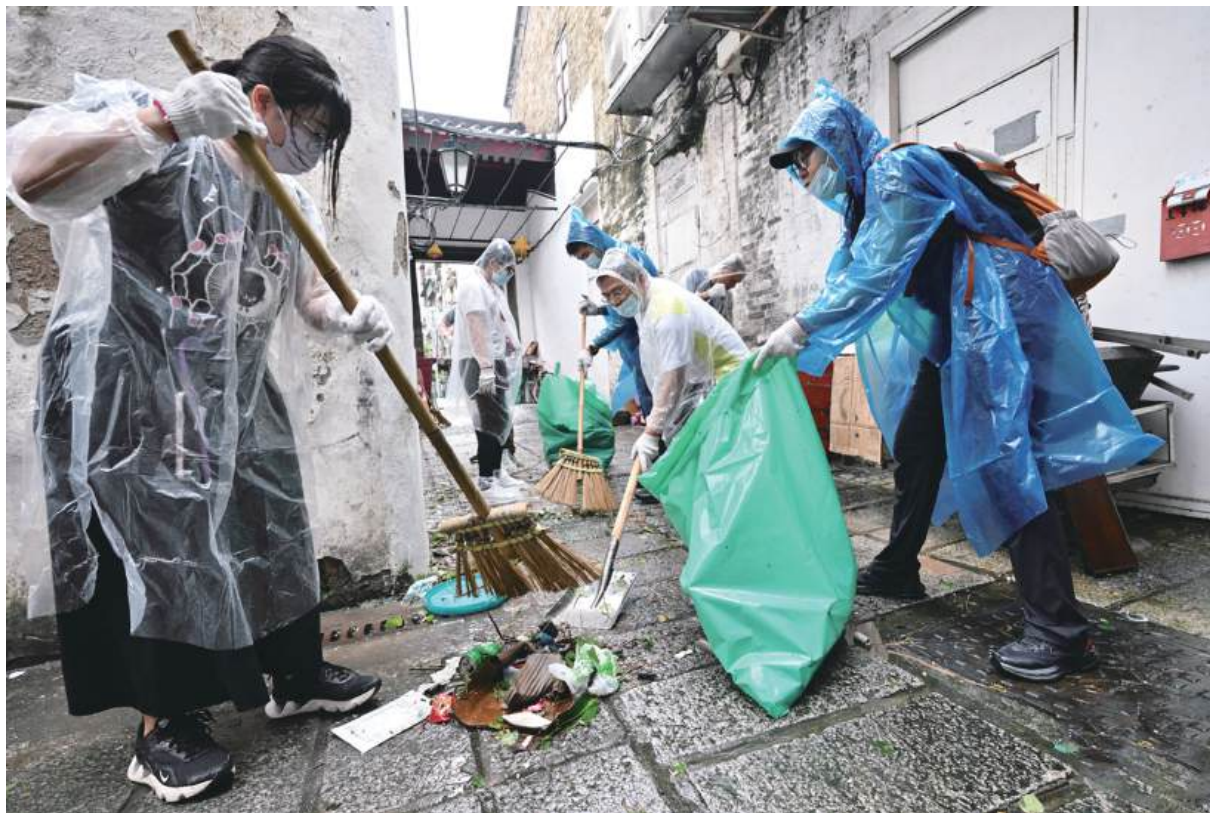
Civil servants mobilised by the government clean up rubbish in an alley yesterday in the aftermath of Ragasa.

In addition to municipal workers and public security personnel who launched the clean-up to remove large pieces of rubbish and debris when Ragasa was weakening on Wednesday evening, the government yesterday mobilised civil servants from various public entities to join its campaign to remove smaller pieces of rubbish and fallen tree branches, apart from volunteers arranged by various community associations, according to various government statements released on Wednesday and yesterday.