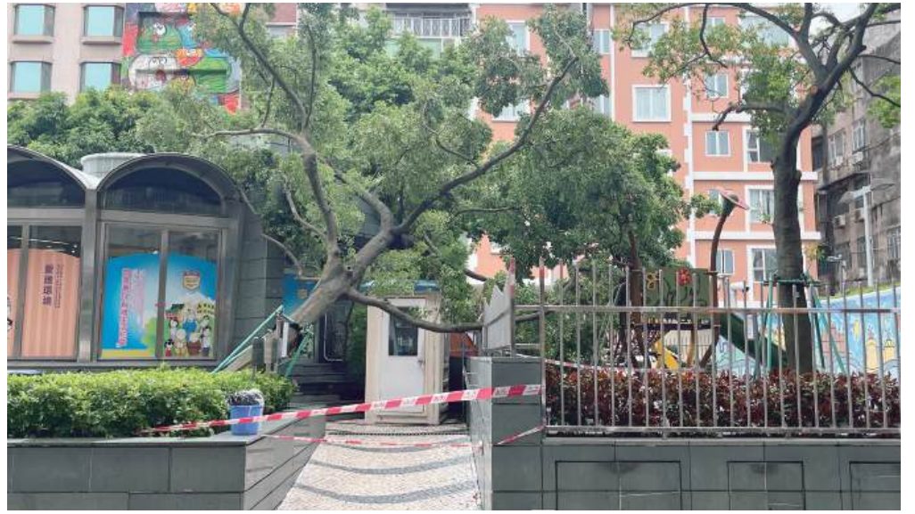
Strong winds from the super typhoon caused a tree to fall.