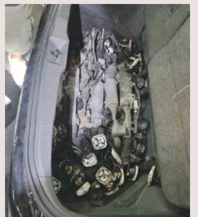
This undated photo provided by Zhuhai's Gongbei Customs shows used auto parts hidden in the boot of the smuggler's car.

According to the statement, customs officers at the delta bridge's Zhuhai checkpoint noticed a single plate Hong Kong vehicle with an anomaly during a routine scan in the inbound passenger vehicle lane.