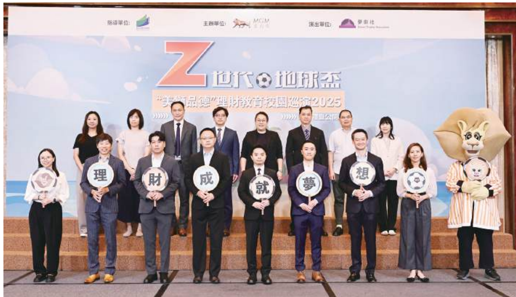
This undated handout photo provided by MGM shows the launch ceremony of the third edition of the MGM Financial Education School Tour 2025 - Gen Z Earth Cup. The caption provided by MGM did not identify those in the photo.