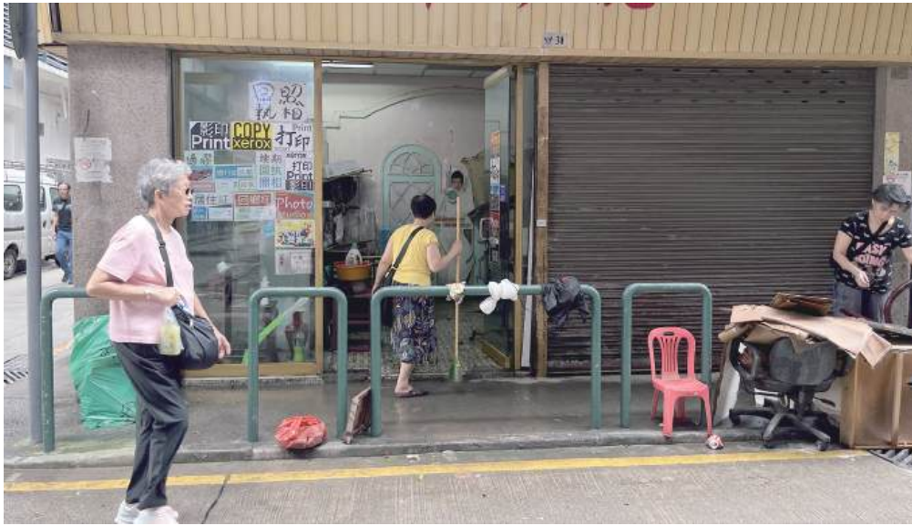
Staff members of a shop in the inner harbour clean up after Super Typhoon “Ragasa”.