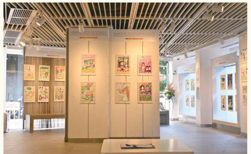
Artworks by students to thank their teachers are displayed at the Centre of Educational Resources of the Education and Youth Development Bureau (DSEDJ) opposite S. Francisco Garden.

A statement displayed at the gallery further highlighted the role of teachers, noting that they "bear the mission of nurturing talent and deserve respect from society". The statement noted that the exhibition shares students' gratitude for their