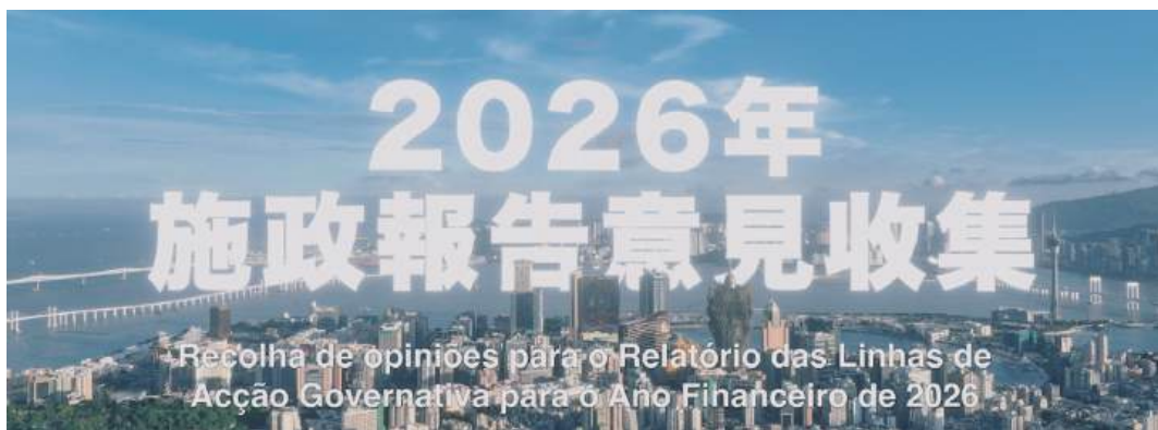
This undated image provided by the Macau Government Information Bureau (GCS) announces the government's public consultation on its policy guidelines for next year.