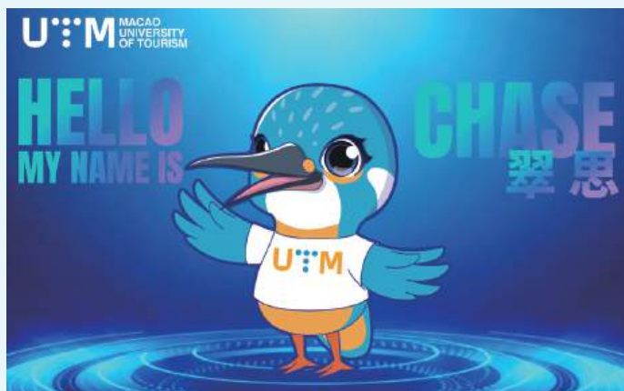
This poster provided by the Macau University of Tourism (UTM) yesterday unveils its first official mascot – "Chase" – during its 30 th Anniversary Gala Dinner at Macau Tower on Monday.

According to the statement, the gala not only marked three decades of its achievements but also aimed to reinforce its commitment to nurturing talent for Macau, the Greater Bay Area (GBA), and the whole nation, adding that UTM will continue to elevate teaching and research, aiming to foster industry collaboration, contributing to Macau's cultural and tourism development. ■