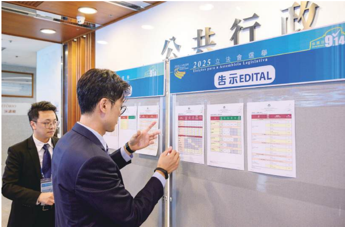
A civil servant pastes the audited results of Sunday's direct and indirect legislative elections on ground floor of the Public Administration Building on Rua do Campo yesterday afternoon.

According to the direct election's preliminary results released in the early hours of Monday, a total of 5,987