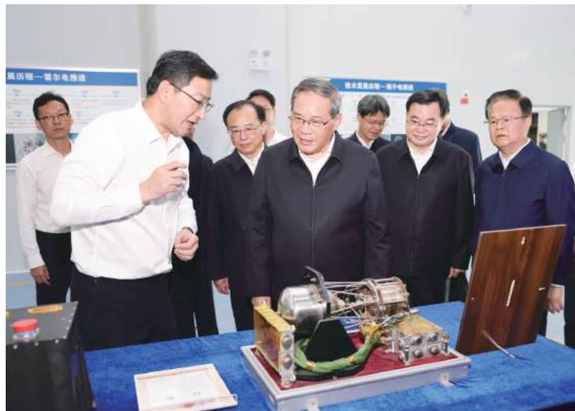
Premier Li Qiang (center), also a member of the Standing Committee of the Political Bureau of the Communist Party of China (CPC) Central Committee, inspects a high-tech company and an industrial park in Lanzhou, northwest China's Gansu Province, on Monday. Li went on a two-day inspection tour of the northwest Gansu and Qinghai provinces that concluded yesterday.

XINING — Premier Li Qiang has urged efforts to coordinate high-quality development with high-level protection, and to accelerate the construction of a modern industrial system that leverages local characteristics and advantages.