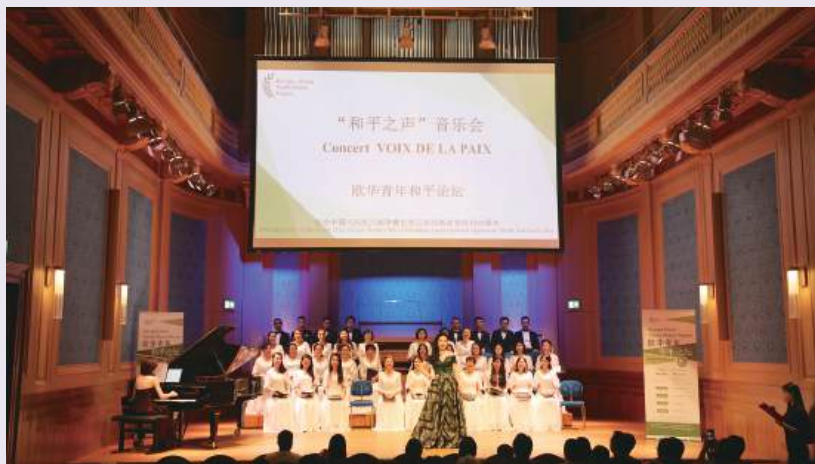
The Concert “Voice of Peace” is held during the first Europe-China Youth Peace Forum in Geneva, Switzerland, on Monday. The first Europe-China Youth Peace Forum gathered about 120 participants in Geneva on Monday, marking the 80 th anniversary of the Victory of the Chinese People's War of Resistance Against Japanese Aggression and the World Anti-Fascist War.

*The author is a communication and publication consultant at the Ethiopian Policy Studies Institute.