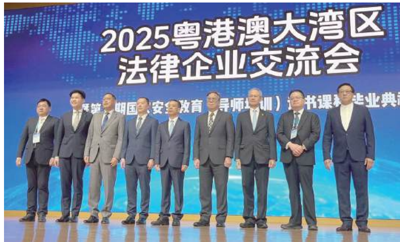
Lawyer Junius Ho Kwan Yiu (first right), who is a member of the National Committee of the Chinese People’s Political Consultative Conference (CPPCC), and others pose for a group photo during yesterday’s “2025 Greater Bay Area (GBA) Legal-Business Exchange Seminar & 6 th National Security Education (Instructor Training) Certificate Course Graduation Ceremony” at Galaxy International Convention Centre in Cotai.

Lawyer Junius Ho Kwan Yiu, a member of the National Committee of the Chinese People’s Political Consultative Conference (CPPCC), said in his speech that as of last week about 618 Hong Kong and Macau lawyers had obtained qualifications to practise in the Greater Bay Area (GBA) through the current pilot scheme, adding that the lawyers participating in the scheme are from nine Guangdong cities, including