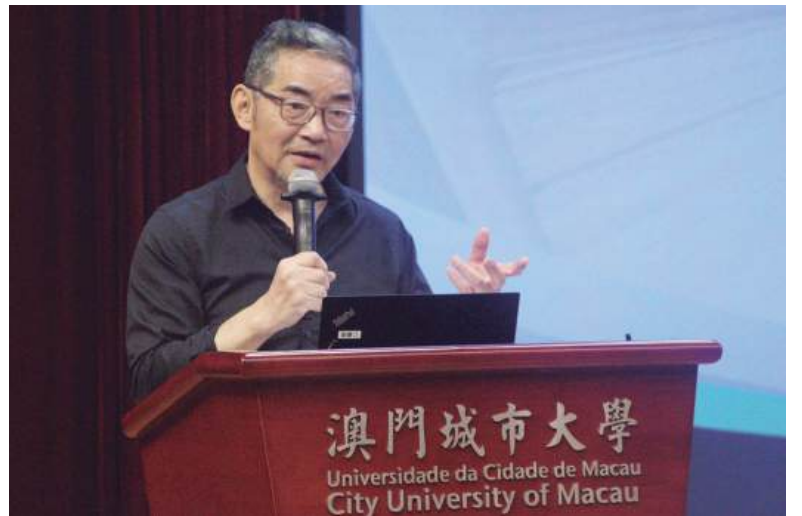
Prof. Su Tong delivers his Doctor honoris causa Lecture titled "My Literary Life" at the City University of Macau in Taipa yesterday.

In his lecture, delivered in Putonghua, Su Tong spoke about key moments in his literary journey. He recalled that in the early 1970s he began writing stories about what he had heard from his neighbours, adding that in order to continue a story he hadn't finished hearing from them yet, he tried to create the rest of the plot himself.