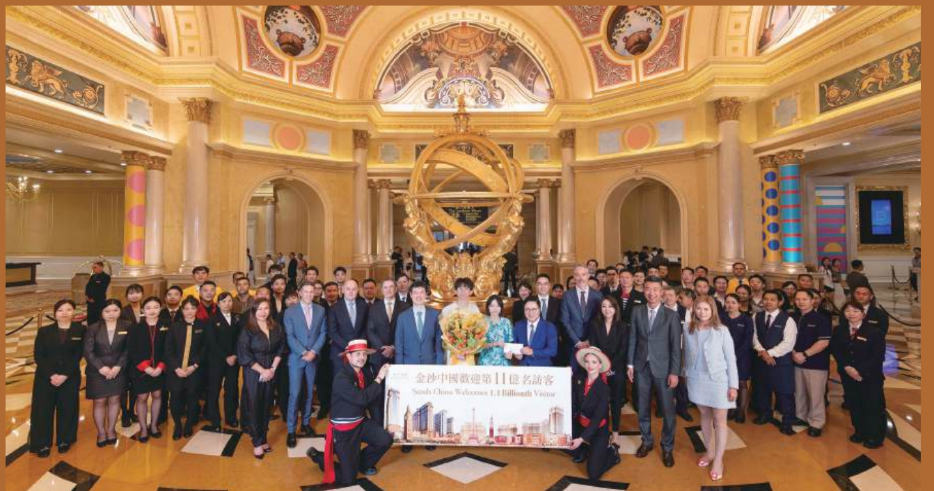
Sands China representatives pose at the integrated resort operator’s flagship property, The Venetian Macao, to celebrate the 1.1 billionth visitor (front, centre, holding a bouquet) to its local properties.

Sands China’s cumulative investment in Macau has exceeded 134.5 billion patacas, the statement said, adding that its integrated resorts offer over 10,000 hotel rooms, 150 dining options, and 760 retail outlets, altogether featuring