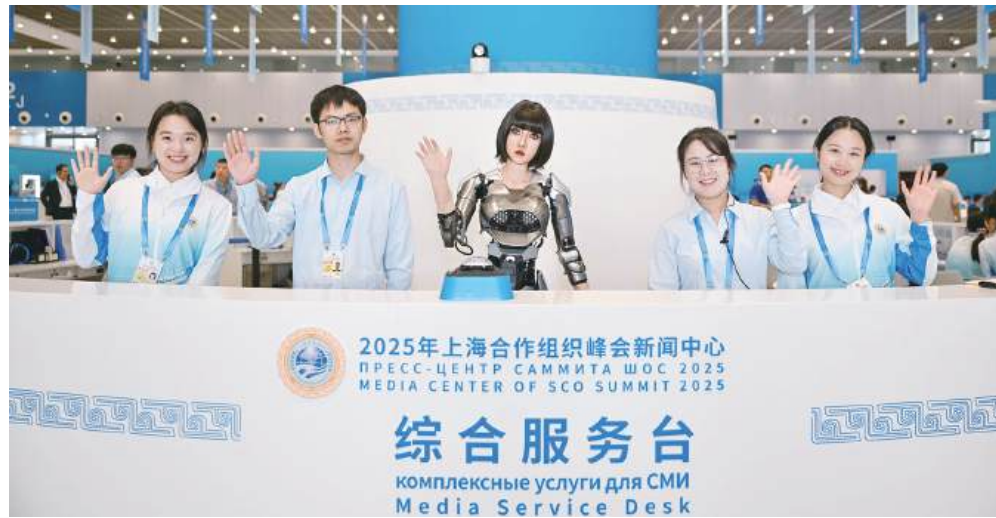
A humanoid robot (center) welcomes journalists with volunteers at the media center for the upcoming Shanghai Cooperation Organization (SCO) Summit 2025 in Tianjin yesterday. The media center opened yesterday. The two-day summit starts on Sunday.

Comprising these 10 member states, two observer states and 14 dialogue partners spanning