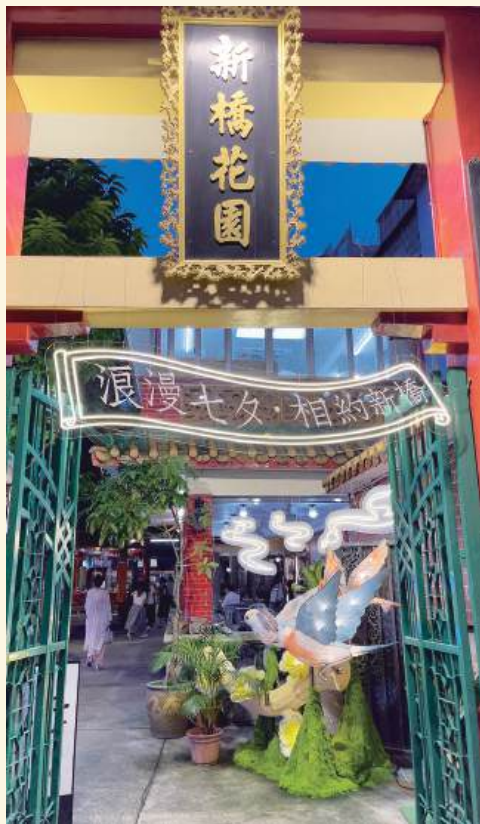
A woman wearing a "Hanfu" walks through the "Qixi Festival Summer Experience in San Kio" market in San Kio Garden yesterday.