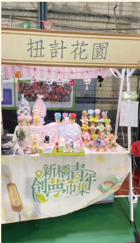
This photo taken yesterday shows the "Tricky Garden" (扭計花園) booth in San Kio Garden.