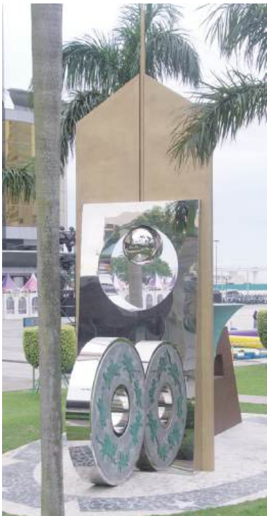
The art installation "Time Tower" is displayed at the Macau Cultural Centre's (CCM) Plaza in Nape yesterday.

According to an information board displayed at the exhibition site by the bureau, Time Tower is "a tribute to time, nature, and the light of the soul". The installation restructures the eternal dialogue between humanity, time and space, while incorporating Macau's unique cultural character, the message said, adding that its towering form resembles a sundial that records the city's cultural layers in the flow of light and shadow, weaving together