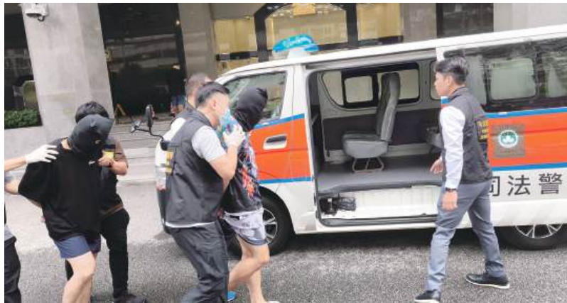
Judiciary Police (PJ) officers escort the two hooded drug suspects to a PJ van outside the PJ headquarters in Zape yesterday.