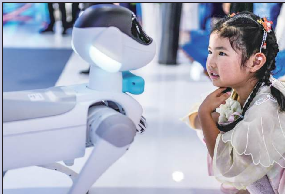
A girl looks at a robot dog during the China International Big Data Industry Expo 2025 in Guiyang, capital of Guizhou Province, yesterday. The expo opened here yesterday. It spotlights cutting-edge innovations integrating data with artificial intelligence, which aim to drive efficient convergence and value realization of data resources, injecting robust momentum into industrial upgrading and high-quality economic growth. – Xinhua

Wen noted that the new facility will include three main operational divisions: module development, full-system production and manufacturing, and quality control and testing. Construction on the factory is currently underway, with equipment expected to be deployed gradually by the end of October. – Xinhua