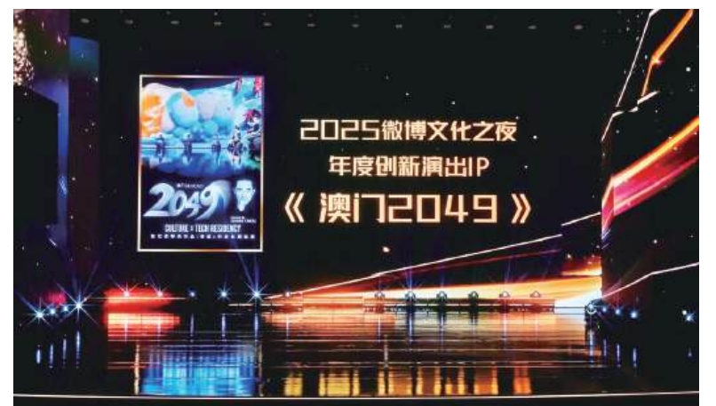
“Macau 2049” receiving the “Annual Innovative Performance IP Award” at the 2025 Weibo Cultural Night held in Zhengzhou.

During the event, the statement said that the production team also launched the national campaign “Culture in Action” inspired by a 12,500-kilometre journey across the Chinese cultural landscape. “The campaign encourages the public to take part in the living legacy of intangible heritage through interactive, tech-powered experiences”, according to the statement.