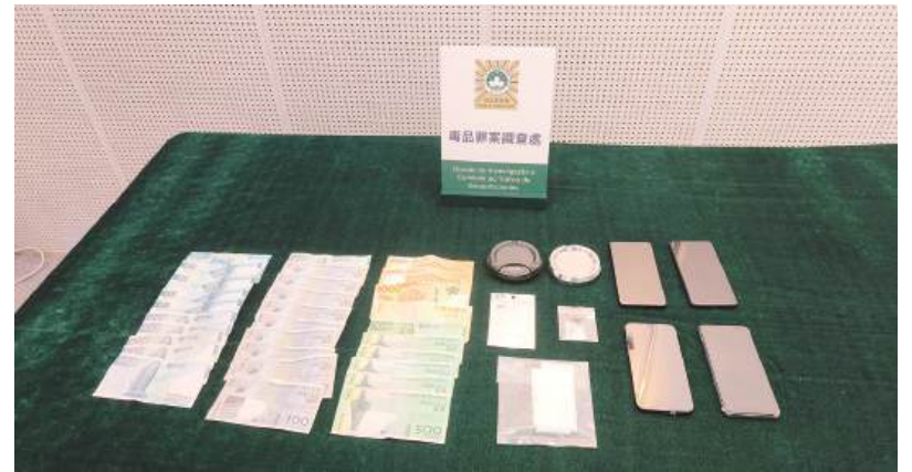
Evidence seized in the drug case are displayed at a pressroom of the PJ headquarters yesterday.

According to Chao, the police confirmed that they are friends, and