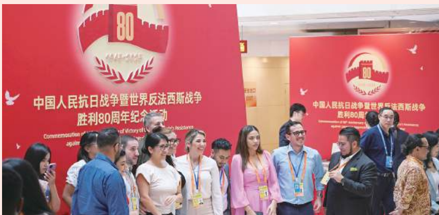
Journalists pose for a group photo at the press center of Commemoration of 80th Anniversary of Victory of Chinese People's Resistance against Japanese Aggression and World Anti-Fascist War in Beijing yesterday. The press center opened on Wednesday. Based at Beijing Media Center Hotel, the center handles press credentials and coordinates interview opportunities for both Chinese and foreign journalists. It also offers technical support, reference materials, and assistance with reporting inquiries.

BEIJING — President Xi Jinping will host leaders from 26 countries at a massive military parade in Tian'anmen Square next week to mark the 80th anniversary of the country's victory against Japanese aggression and the world's victory against fascism.