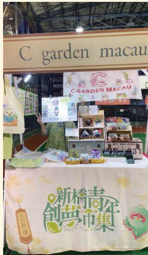
The owner of the "C garden macau" brand gives the victory sign at her booth in San Kio Garden yesterday.