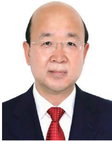
Undated file photo of Commissioner Liu Xianfa.

Macao is never absent from this war and fights shoulder to shoulder with the motherland throughout. All sectors of Macao society spared no efforts and overcame all difficulties to provide relief such as accommodation, food and medical care to a large number of compatriots displaced by the war. Macao's patriotic figures like Mr. Ma Man-kei, Ho Yin and Ke Lin broke through heavy blockades of the Japanese invaders and sent supplies and funds to the front line. A legion of passionate young people from Macao were heading off to battlefronts in the Pearl River Delta, Dongjiang and other areas without hesitation. Patriotic groups raised huge sums of money to support soldiers at the front line and went to great lengths to promote the publicity of the War of Resistance. The Yellow River Cantata composed by the Macao-born people's musician Mr. Xian Xinghai sounded the roar of national peril and became the strongest voice for national salvation. History will never forget