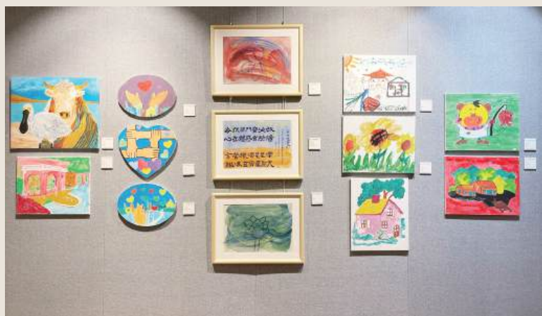
Exhibits of “2025 Cross-Disability Art Invitational Exhibition” are displayed at Chun Chao Tong gallery, Lou Lim Ieoc Garden, which ended yesterday.

The message added that MPMHPA expressed gratitude to the Macao Foundation (FM) the funding sponsor, and the Municipal Affairs Bureau (IAM), the venue sponsor, for their support. ■