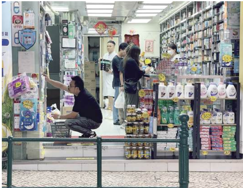
Shoppers look for goods at a Western pharmacy on Rua dos Mercadores in the city centre yesterday.

The Post talked to the elderly in a park on the peninsula.