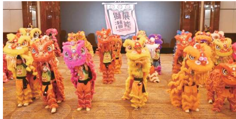
Young lion dancers deliver an opening performance yesterday afternoon at MGM MACAU.

A record 14 percent increase in youth participation has been set, while Lio also told the Post during the interview that the upcoming competition will have more female athletes participating than before, showing that although the lion dance might still be seen by some as a male-dominated sport, it can be for everyone regardless of age, gender, and nationality. ■