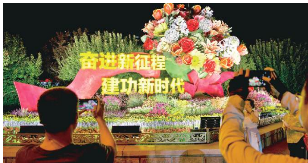
Pedestrians take photos of a floral installation at Fuxingmen in Beijing yesterday. Ten sets of floral installations along Chang'an Avenue marking the 80 th anniversary of the victory in the Chinese People's War of Resistance Against Japanese Aggression and the World Anti-Fascist War have been completed. A grand parade will be held in Beijing next Wednesday in commemoration of China's victory. The Chinese characters read: "Embark on a new journey — Contribute to the new era".

*VLSI stands for Very-Large-Scale Integration. It is the process of creating an integrated circuit (IC) by combining millions or even billions of transistors onto a single silicon microchip. — DeepSeek