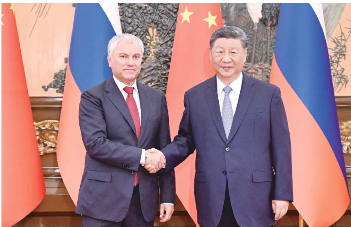
President Xi Jinping shakes hands with Vyacheslav Volodin, chairman of the Russian parliament's lower house, the State Duma, at the Great Hall of the People in Beijing yesterday.

China and the Soviet Union, as the main battlefields of World War II in Asia and Europe, respectively, made immense national sacrifice in resisting the aggression of Japanese militarism and German Nazism, and