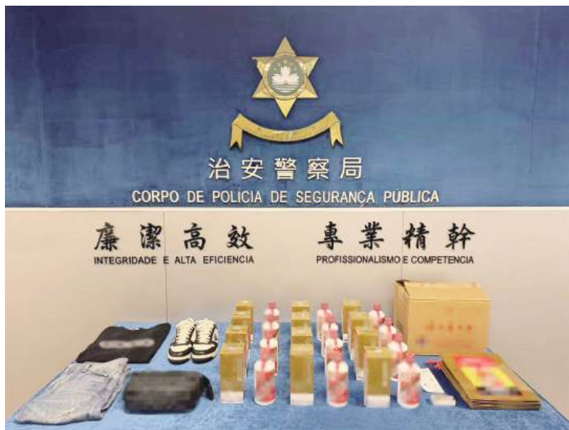
This undated pixelated handout photo provided by the Public Security Police (PSP) yesterday shows 12 bottles of a famous “baijiu” (Chinese white liquor) stolen by the suspect.