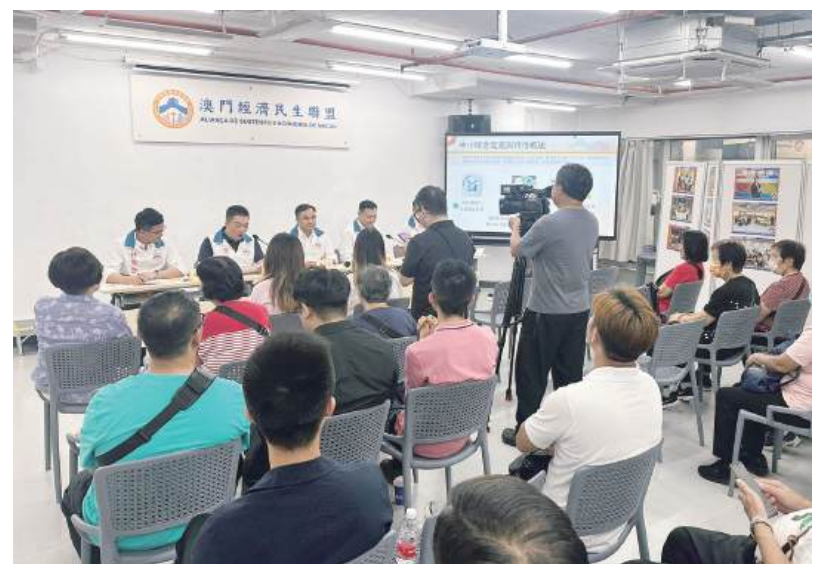
Representatives of the Macau Economic and Livelihood Alliance address yesterday's press conference at their office in Zape.

First launched in 1997, the CIFIT, organized by the Ministry of Commerce, has become an important platform for boosting investment and facilitating global development. — Xinhua