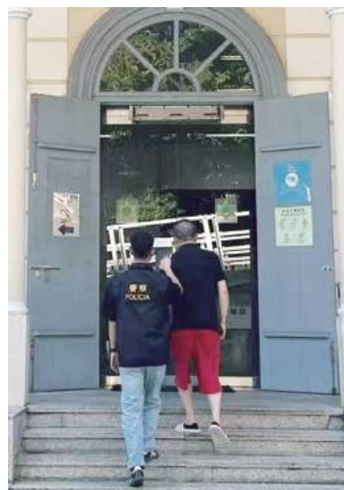
This undated handout photo provided by the Public Security Police (PSP) yesterday shows a PSP officer escorting the ‘baijiu’ theft suspect into a police station.