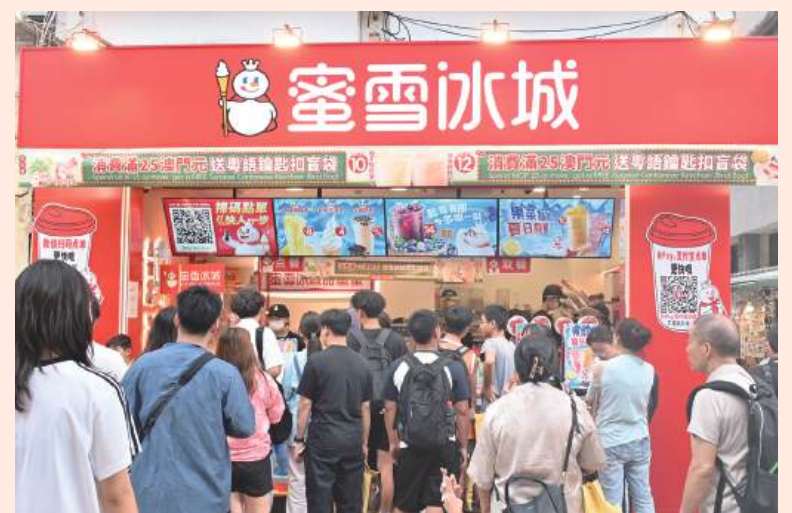
Heat-challenged consumers queue at Mixue Ice Cream & Tea (蜜雪冰城) on Travessa do Soriano yesterday.

The alert noted several essential precautions for the public to follow. These include wearing loose, thin, and light-coloured clothing when outdoors and seeking immediate rest in a shaded area if feeling unwell. It also strongly advises avoiding prolonged exposure to sunlight and the harmful effects of UV radiation. In a critical safety reminder, the public are warned