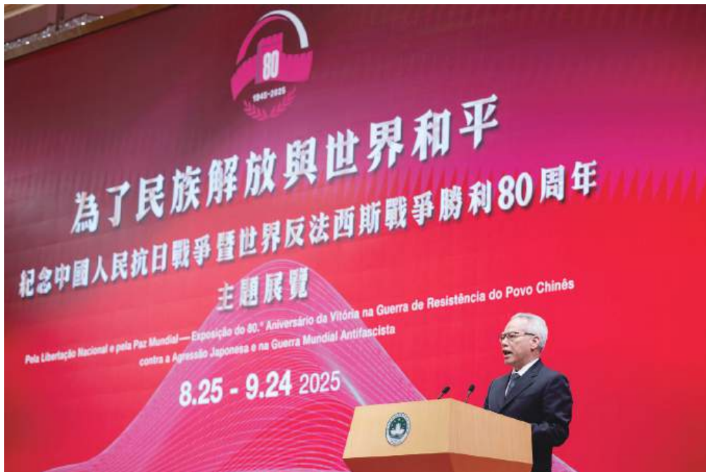
Macau SAR Chief Executive Sam Hou Fai addresses the opening ceremony of the Exhibition Commemorating the 80 th Anniversary of the Victory in the Chinese People's War of Resistance Against Japanese Aggression and the World Anti-Fascist War, at the Forum Macao complex in Nam Van yesterday.