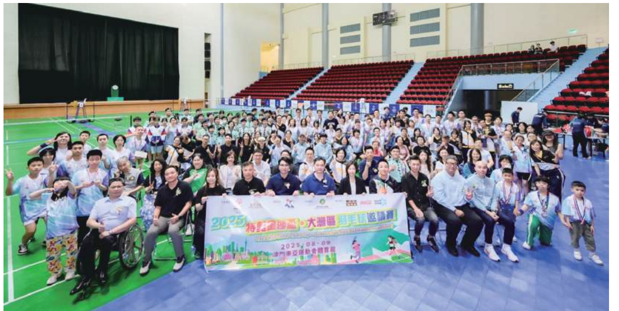
This handout photo taken on August 9 and provided on Thursday by Sands China shows athletes and volunteers posing with guests and representatives during the one-day 2025 MSO Sands China Cup - Greater Bay Area Badminton Invitational.