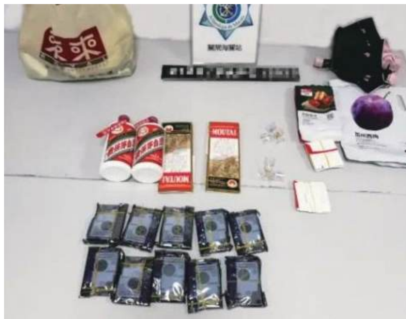
shows 10 computer hard drives and two bottles of Mou Tai seized by custom officers at the Barrier Gate checkpoint.

According to the "Solid Waste Pollution Prevention and Control Law of the People's Republic of China", the import of solid waste in any form is prohibited. Besides, the law forbids the dumping, stacking, or disposal of solid waste from outside the Chinese mainland. Those who violate these regulations, the customs authorities will order the return of the waste to their country of origin and impose heavy fines; if the incident constitutes a crime, criminal liability will be pursued in accordance with the law. ■