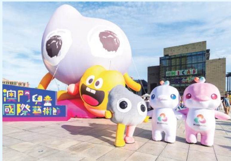
This undated handout photo provided by the Cultural Affairs Bureau (IC) shows the "MICAFA" mascot and the National Games' "Xiyangyang" ("Joyful") and "Lerongrong" ("Happy Harmony") mascots during this past weekend's "MICAFA Fun Day" Arts Carnival.

Meanwhile, the "MICAFA, Where Are You?" Magical Mark Collection and the "Child Fun Upgrade Magic" draw, according to the statement, offer participants chances to win prizes, including round-trip Air Macau tickets and BOC electronic vouchers, with results to be announced on the bureau's Facebook page after the final draw at the end of the month. ■