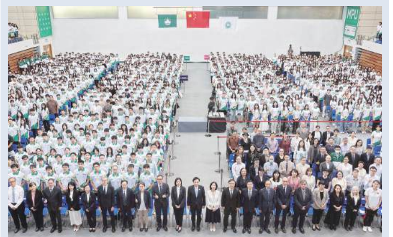
These handout photos provided by UTM and MPU show students and staff members posing during the respective 2025/2026 orientation ceremonies of both public universities last week.