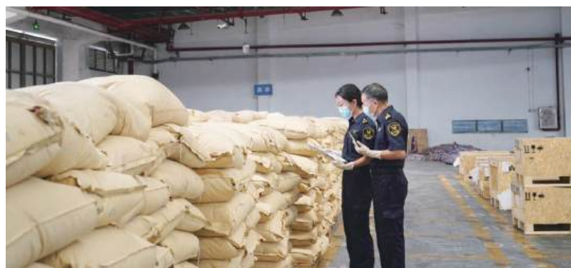
This undated handout photo provided by Zhuhai Wanzai Customs yesterday shows 27 tonnes of plastic pellets in bags seized by customs officers at Hongwan Port.