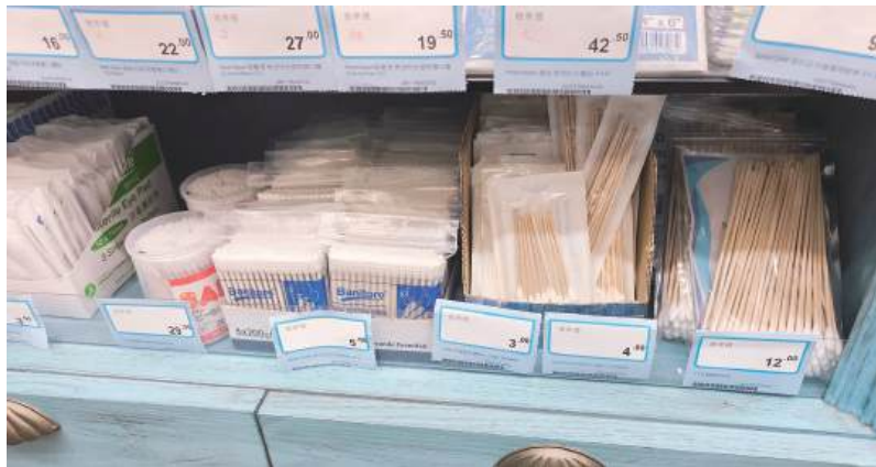
Packs of cottonwool buds are displayed on the shelf of a pharmacy in the city centre yesterday.

The government has banned the import of single-use Styrofoam meal boxes, bowls, cups and plates since January 1, 2021, the import of single-use non-biodegradable plastic drinking straws and drink stirrers since January 1, 2022, the import of single-use non-biodegradable plastic knives, forks and spoons since January 1, 2023, and the import of single-use non-biodegradable plastic plates and cups as well as single-use Styrofoam