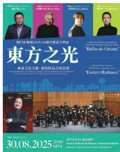
This poster provided by the Cultural Affairs Bureau (IC) on Friday promotes the upcoming opening concert "Eastern Radiance" for the Macao Chinese Orchestra's new concert season.

Ticket prices for the upcoming performance, which will start at 8 p.m., range from 120 patacas to 380 patacas, with more details available on www.macaoticket.com and www.ochm-macau.org . ■