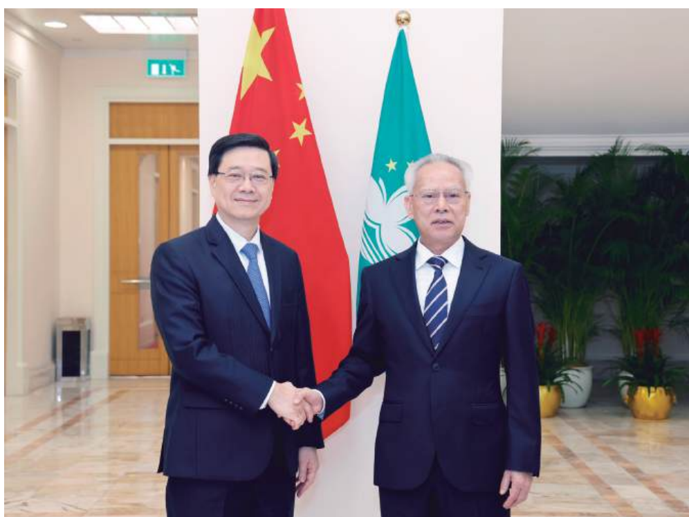
Chief Executive Sam Hou Fai (right) shakes hands with his Hong Kong counterpart John Lee Ka-chiu at Government Headquarters yesterday.

According to the statement, Sam said that he expects the two cities to promote cross-border policy coordination and strengthen internal and external connectivity, with the