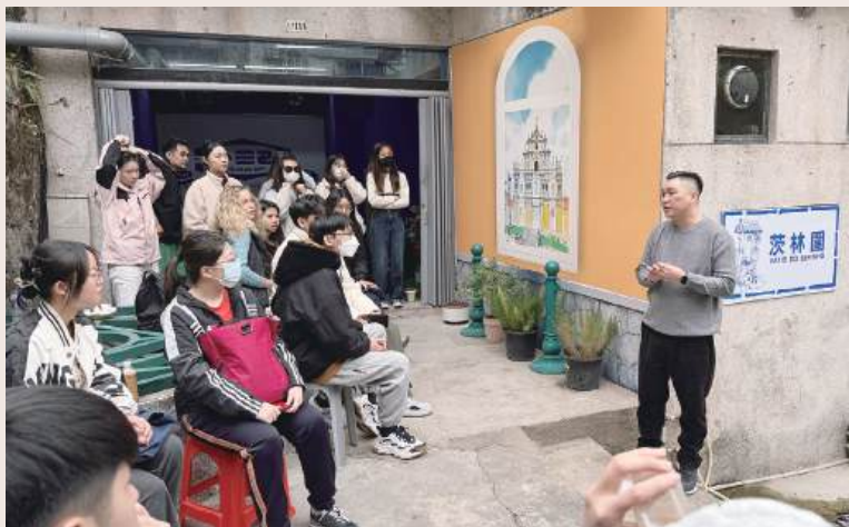
This undated handout photo provided by Macau University of Tourism (UMT) shows participants attending a session of the "Siu Saam Baa" project in an unverified location.