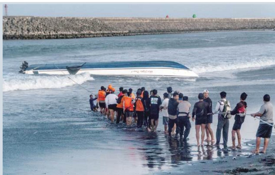
People and officers use rope to pull the capsized fast boat to the sea shore at Sanur beach in Bali, Indonesia, yesterday.

Macau's most popular English-language newspaper – Your trustworthy source of news & views