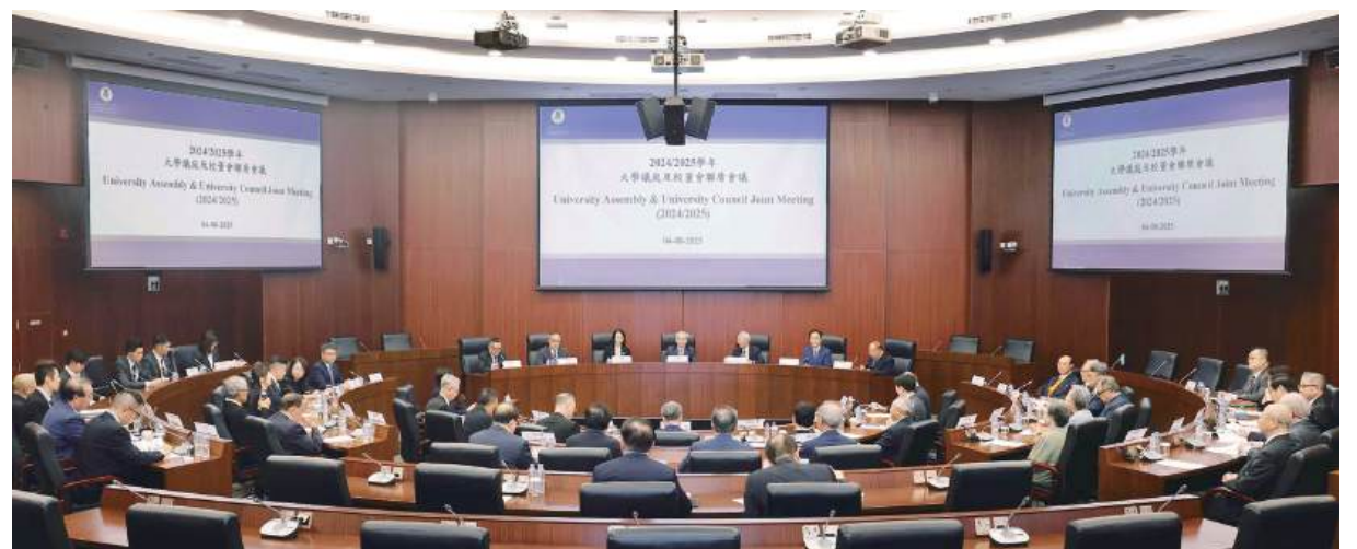
This handout photo provided by the University of Macau (UM) shows the Joint Meeting of the University Assembly (UA) and University Council (UC) in the Ho Yin Conference Hall on Monday.