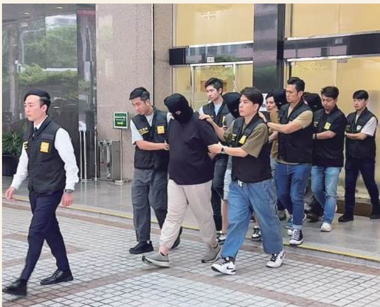
Judiciary Police (PJ) officers escort the hooded suspects to a PJ van outside the PJ headquarters in Zape yesterday.

The four suspects were transferred to the Public Prosecutions Office (MP) yesterday, each facing a charge of illegal currency exchange, according to Cheong. ■