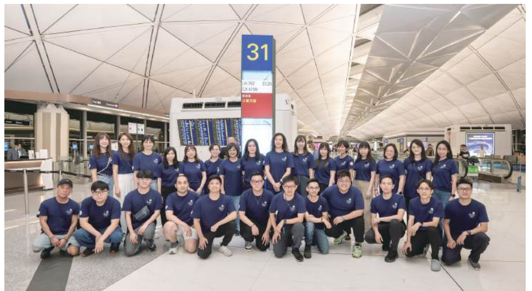
Dolce Voce members pose at the Macau International Airport before embarking on their Portugal tour.