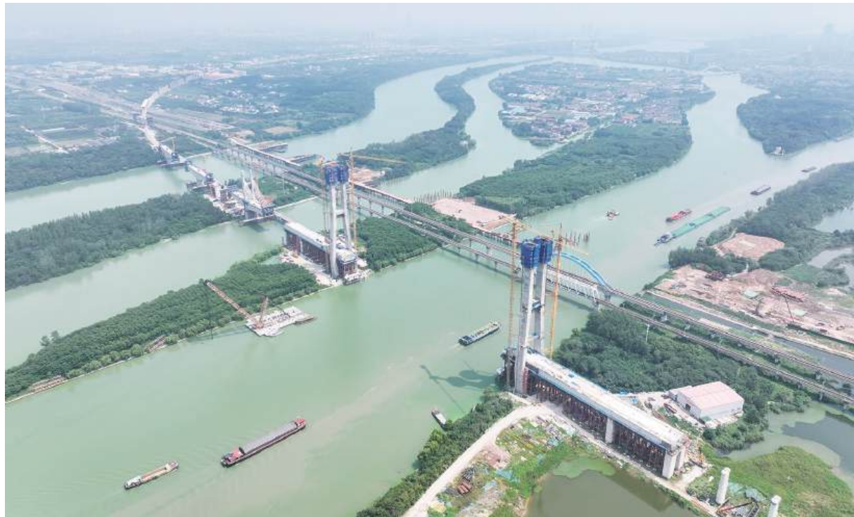
An aerial drone photo taken on yesterday shows the construction site of a cable-stayed bridge across the Beijing-Hangzhou Grand Canal in Yangzhou, east province of Jiangsu, yesterday. The main tower of the bridge witnessed its topping-out yesterday. The bridge, with a total length of 564.3 meters, is a key project along the Shanghai-Chongqing-Chengdu High-speed Railway. – Xinhua

“Xizang is still among the world's regions with the best ecological environment,” Wang said. – Xinhua