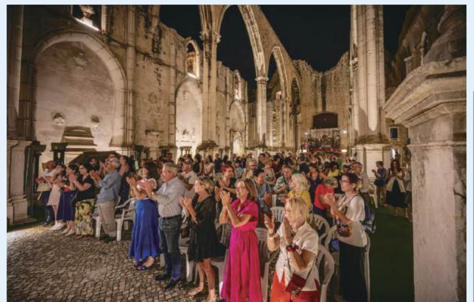
Portuguese audience gives a standing ovation following Dolce Voce’s performance on Saturday.