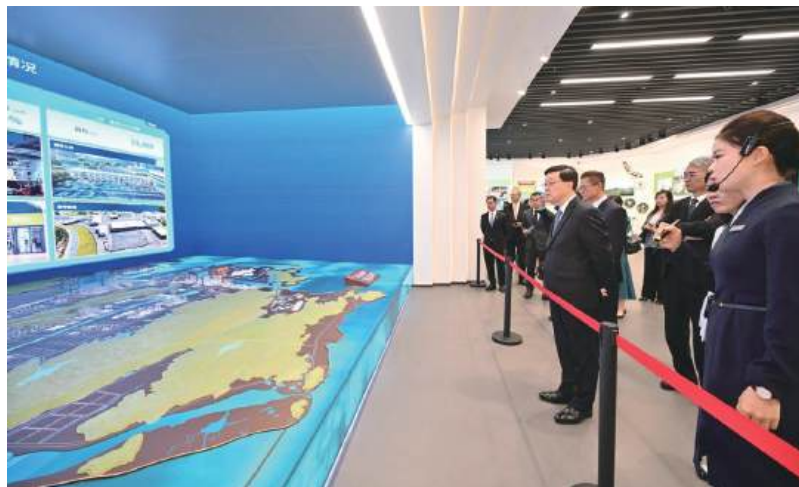
This photo provided by the Hong Kong government yesterday shows Hong Kong Chief Executive John Lee Ka-chiu (centre) looking at an urban development model for Hengqin while visiting the island's urban planning exhibition hall yesterday.