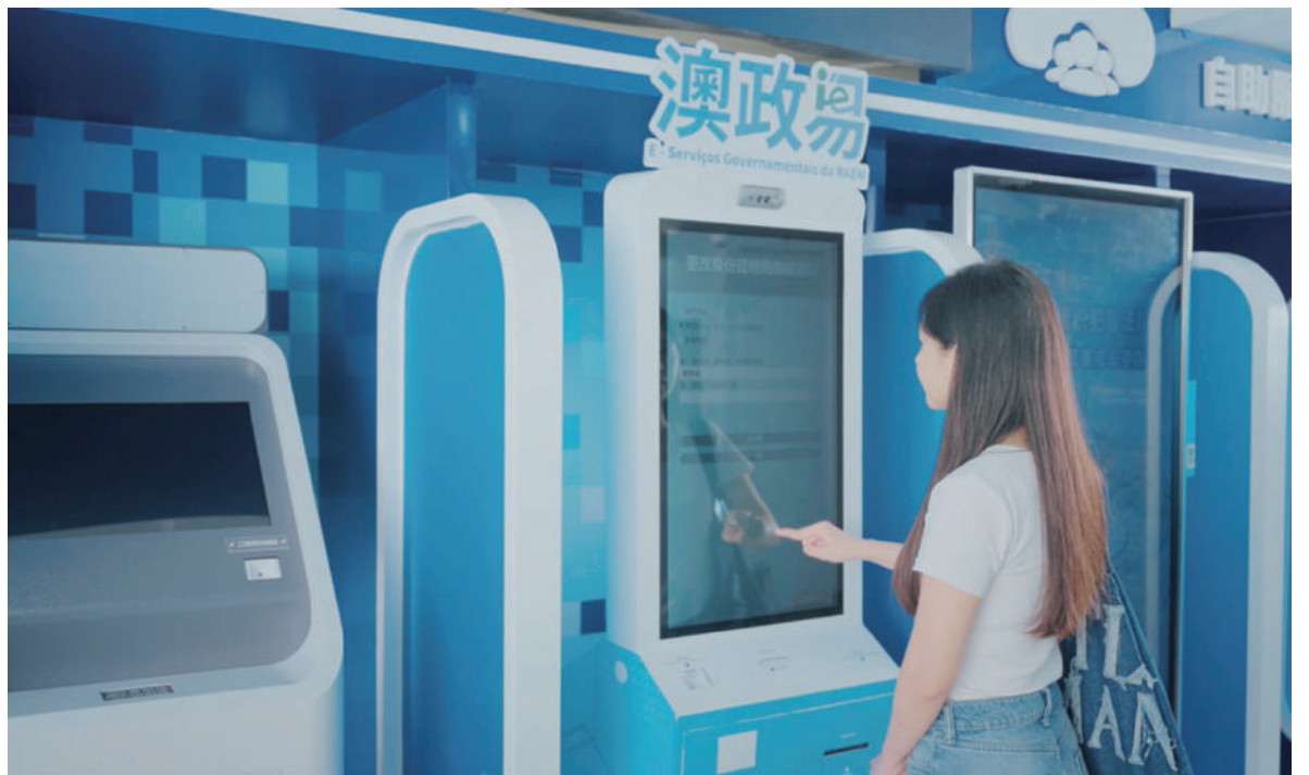
This demonstrative video clip downloaded yesterday from the Identification Services Bureau's (DSI) dedicated website about its self-service kiosks in Guangdong GBA cities shows a woman using a self-service kiosk for Macau's public administrative service at a government service centre in Guangzhou.