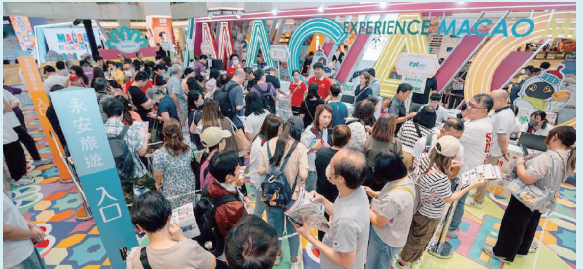
This undated handout photo recently provided by the Macau Government Tourism Office (MGTO) shows a crowd of Hong Kong residents during the 'Experience Macao' carnival held at East Point City in Hong Kong last weekend.