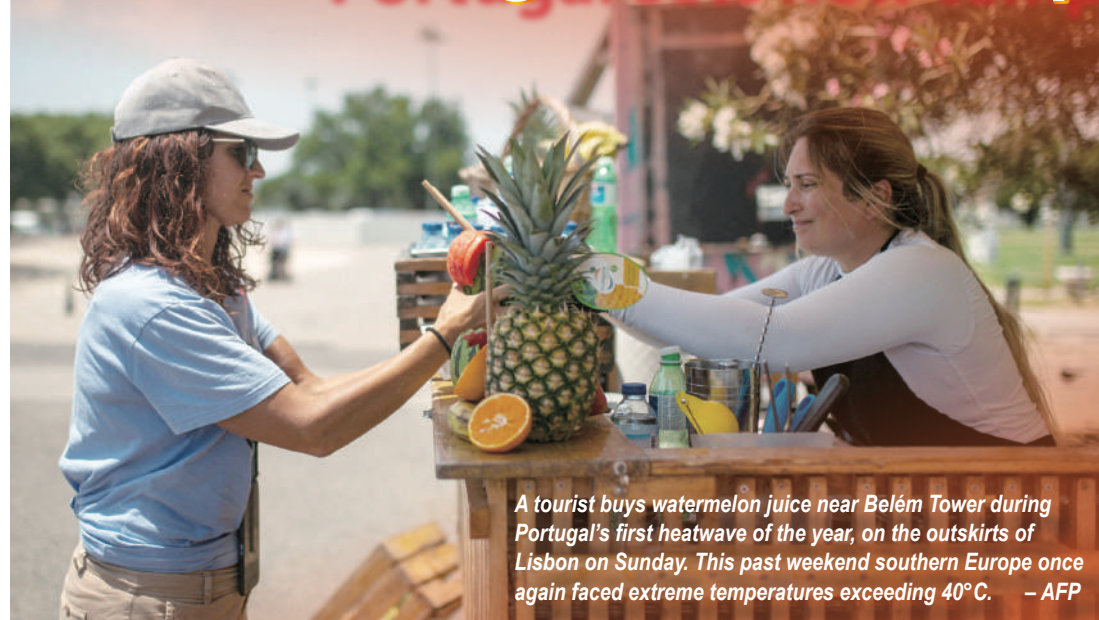
A tourist buys watermelon juice near Belém Tower during Portugal's first heatwave of the year, on the outskirts of Lisbon on Sunday. This past weekend southern Europe once again faced extreme temperatures exceeding 40°C.

LISBON — Portugal has set a new national temperature record for the month of June. According to data from the Portuguese Institute for the Sea and Atmosphere (IPMA), the inland town of Mora, in the Évora district, recorded a maximum temperature of 46.6 degrees Celsius on Sunday, marking the highest temperature ever recorded in Portugal during June.