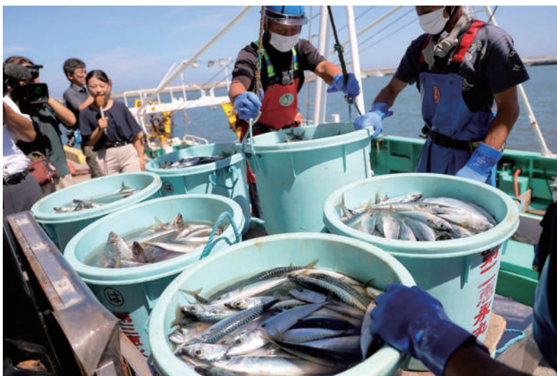
This file photo taken on September 1, 2023 shows fishery workers unloading seafood caught in offshore trawl fishing at the Japanese port of Matsukawaura in the city of Soma, Fukushima prefecture, about a week after the country began discharging treated wastewater from the TEPCO Fukushima Daiichi nuclear power plant.

The bureau said that enhanced retail inspections would continue in order to ensure compliance, reaffirming that the restrictions align with precautionary measures for food safety. ■