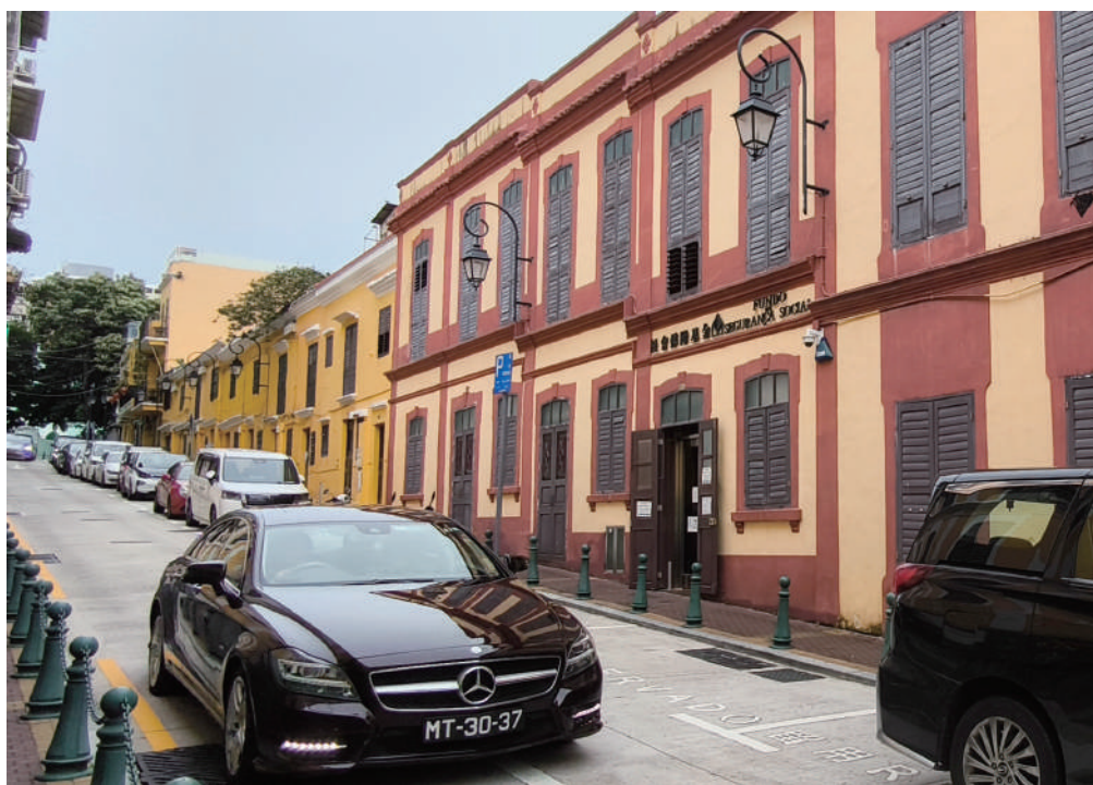
A car is driven past the Social Security Fund's (FSS) service centre on Rua de Eduardo Marques, located near São Lázaro Church, yesterday.

The old-age pension and disability pension are paid to the respective beneficiaries once every quarter, meaning that they receive a