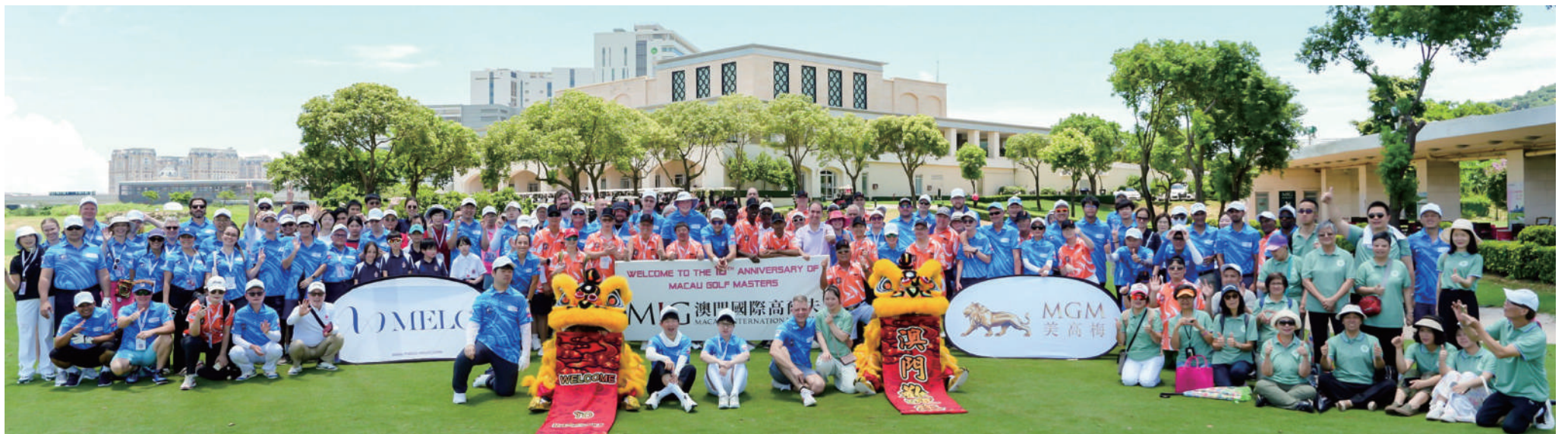
This undated handout photo provided by the Charity Association of Macau Business Readers on Sunday shows a group picture of golfers, guests and representatives for the Macau Golf Masters.