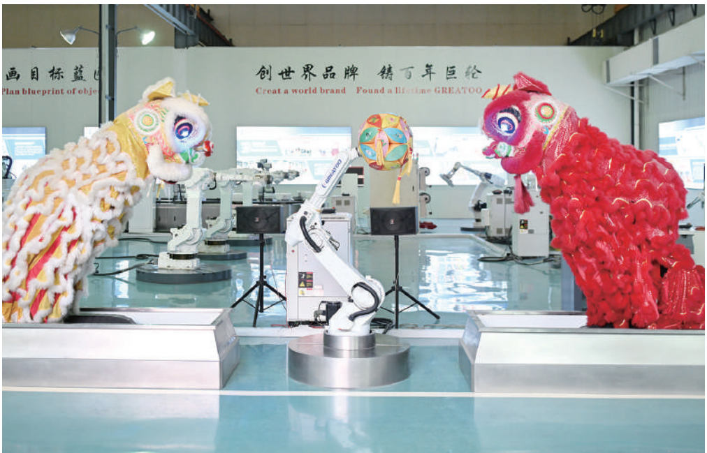
This photo taken on Sunday shows two industrial robots perform lion dance at Greetoo Intelligent in Jieyang, Guangdong Province. Guangdong has been bolstering its pivot cities including Guangzhou, Shenzhen, Foshan and Dongguan to engage in manufacturing intelligent equipment, an effort to build an industrial cluster for manufacturing high-end equipment. In 2024, the province’s operating revenue from the high-end equipment manufacturing reached 390.565 billion yuan with the total profit standing at 18.873 billion yuan. – Xinhua

China will take necessary measures to resolutely defend the legitimate rights and interests of Chinese enterprises, the spokesperson said. – Xinhua