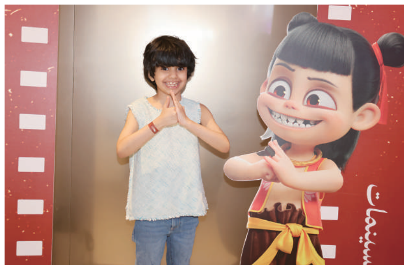
A child poses for a photo with a promotional display for the premiere of Chinese animated blockbuster “Ne Zha 2” in Riyadh, Saudi Arabia, last week.

Indeed, what began as a retelling of a rebellious boy-god from Chinese mythology has blossomed into a contemporary saga that resonates across age groups and cultures. While rooted in ancient lore, the film explores modern themes such as destiny, social prejudice and identity, earning praise from both teenage fans seeking empowerment and older viewers drawn to