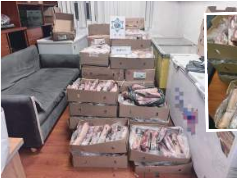
These undated handout photos released by the Macau Customs Service on Tuesday shows the seized frozen beef tongue stored at room temperature at a parallel trading den in the northern district.

Macau to the mainland. The suspect will be fined in compliance with the relevant provisions listed in the External Trade Law, the statement said. Moreover, the statement added, the man also violated the Food Safety Law as the supposedly frozen beef tongue was stored merely at room temperature, adding that the Customs Service has meanwhile transferred the case to the Municipal Affairs Bureau (IAM) for follow-up action. ■