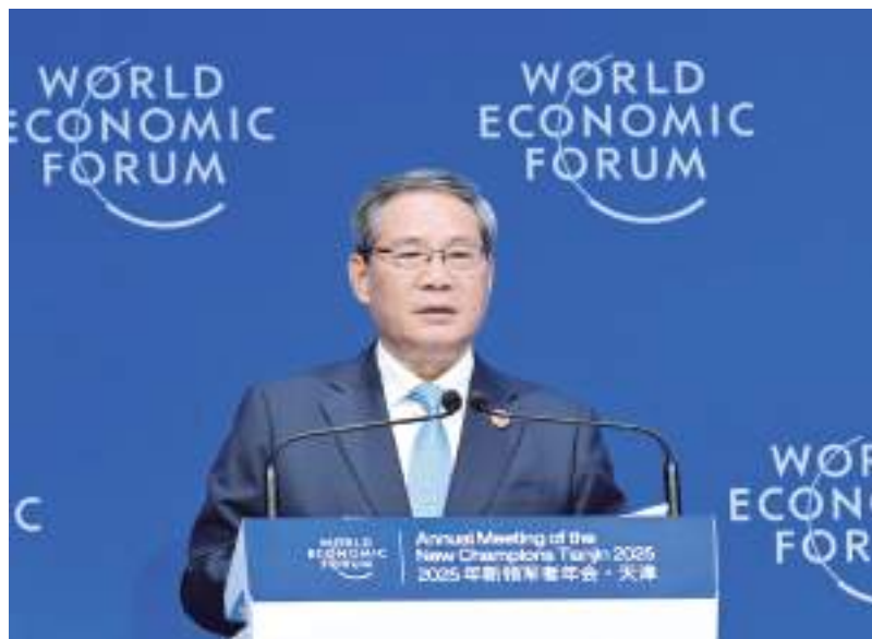
Premier Li Qiang addresses the opening of the 16 th Annual Meeting of the New Champions, also known as the Summer Davos, in the northern Tianjin Municipality, yesterday.

China is willing to do whatever it takes to help tackle the difficulties and challenges facing the global economy,