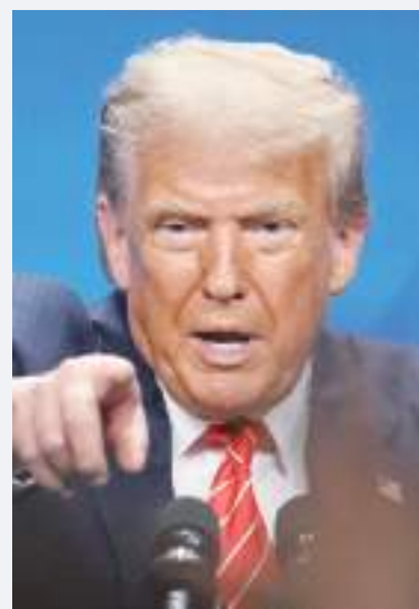
US President Donald Trump gestures during a press conference on the last of the two-day NATO Heads of State and Government Summit in The Hague yesterday.

Macau's most popular English-language newspaper – Your trustworthy source of news & views