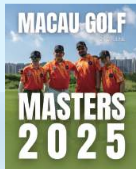
This poster downloaded from the Macau Golf Masters Facebook page last night promotes the ongoing event.

He added: "This week we celebrate not only excellence in golf but the power of diversity, the joy of team spirit, and the importance of visibility for athletes of all abilities." ■