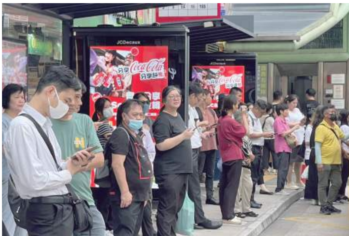
Netizens look at their phones at a bus stop in the city centre yesterday evening.

The survey concludes by emphasising the critical need to focus on youth digital literacy development, strengthen cybersecurity education, and establish a robust cybersecurity protection framework. ■