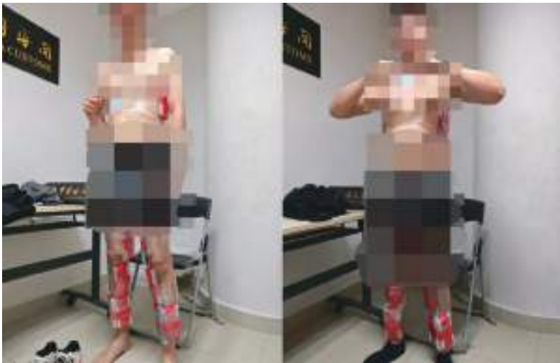
This undated handout photo provided by Zhuhai's Gongbei Customs yesterday shows the suspects smuggling used mobile phones hidden behind transparent elastic bandages around their waist, crotch, and thighs.

Zhuhai's Gongbei Customs officers at the Hong Kong-Zhuhai-Macao Bridge have recently arrested two male bus drivers separately for smuggling 60 used mobile phones in total from Macau to the mainland, according to a statement from the Gongbei Customs. The statement noted that last Tuesday, Gongbei customs officers at the Hong Kong-Zhuhai-Macao Bridge checkpoint in Zhuhai noticed that the driver of a Macau single-plate bus acting strangely and stood out because of his bulky frame. Upon inspection, they found 30 used mobile phones concealed behind transparent elastic bandages around the driver's waist, crotch, and thighs. Four minutes later, officers seized another 30 used mobile phones concealed in the same manner on a different driver of a Macau single-plate bus.