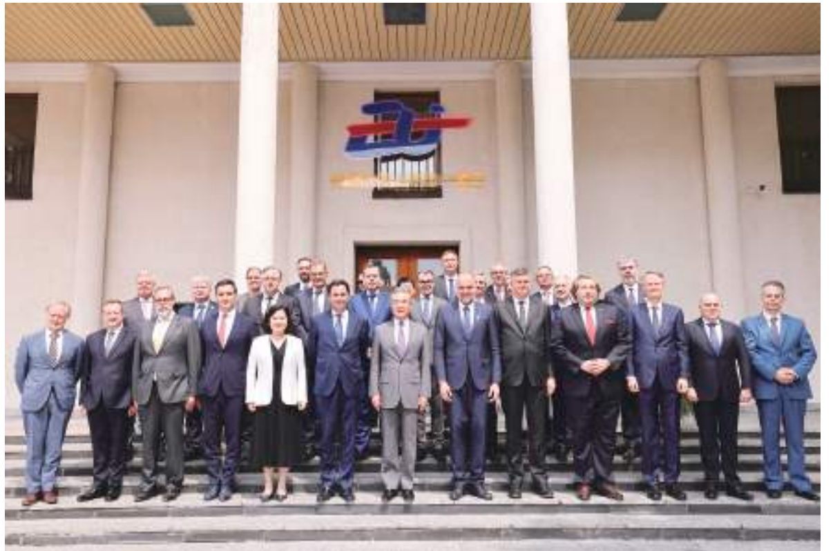
Foreign Minister Wang Yi (front, center), also a member of the Political Bureau of the Communist Party of China (CPC) Central Committee, poses with diplomatic envoys to China from the European Union (EU) and its member states in Beijing yesterday.

BEIJING – Foreign Minister Wang Yi met with diplomatic envoys to China from the European Union (EU) and its member states yesterday in Beijing.