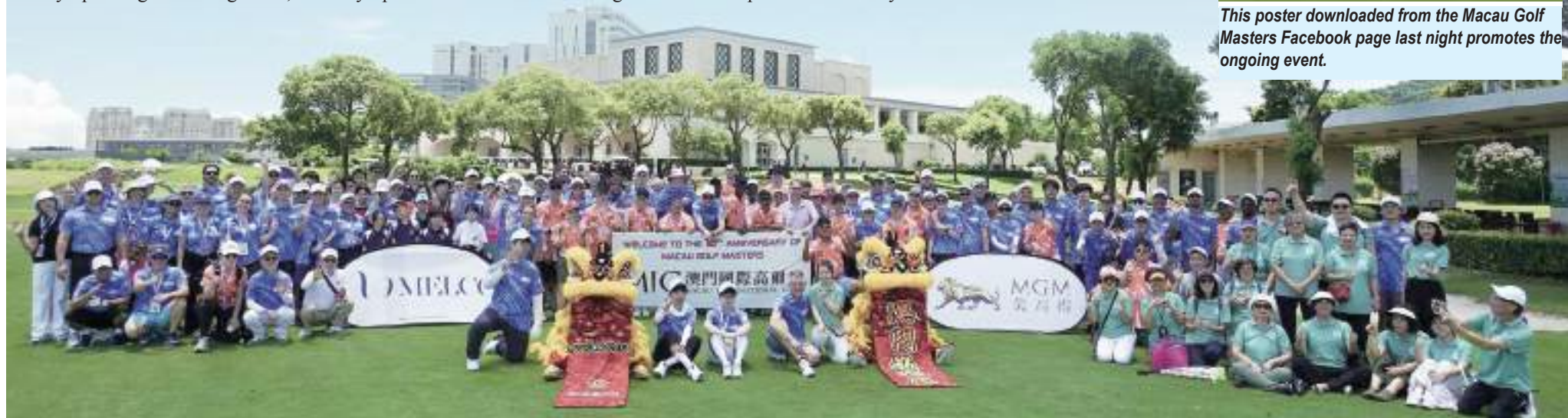
This photo provided by the Charity Association of Macau Business Readers yesterday shows a group photo of the athletes, guests and representatives of the 2025 Macau Golf Masters taken at the Macau International Golf course in Cotai.