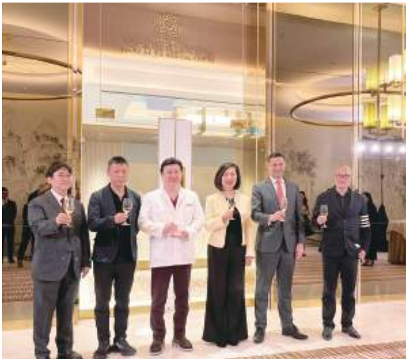
Guests and representatives propose a toast during the opening ceremony of the South Korean Blanc de Vie Medical Centre at Wynn Palace in Cotai yesterday afternoon.

*Appropriately diversified development refers to the framework of the government's "1+4" appropriate economic diversification model, which aims to consolidate and diversify the development of the city's tourism and leisure industry while putting special emphasis on promoting the development of four diversified industries, namely 1) big health, 2) modern finance, 3) high-tech, and 4) MICE as well as culture and sports.