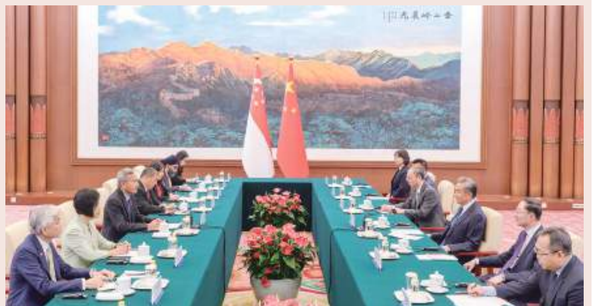
Foreign Minister Wang Yi (third from right), also a member of the Political Bureau of the Communist Party of China (CPC) Central Committee, meets with Singaporean Foreign Minister Vivian Balakrishnan (third from left) in Beijing yesterday. – Xinhua

with China, with a forward-looking and strategic vision, to seize the opportunities brought by the development of emerging technologies and deepen cooperation in various fields such as economy, trade, investment and connectivity. Singapore will, together with other ASEAN countries and China, adhere to openness and inclusiveness and defend multilateralism. – Xinhua