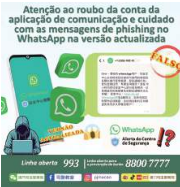
This undated poster provided by the Judiciary Police (PJ) shows details about the phishing messages.

The Judiciary Police reminded members of the public in the statement that WhatsApp will never ask members of the public to click on any link through SMS or software messages to deal with account suspension issues, no matter how realistic it appears to be, adding that any official WhatsApp account has a "blue tick" beside the name of its holder.