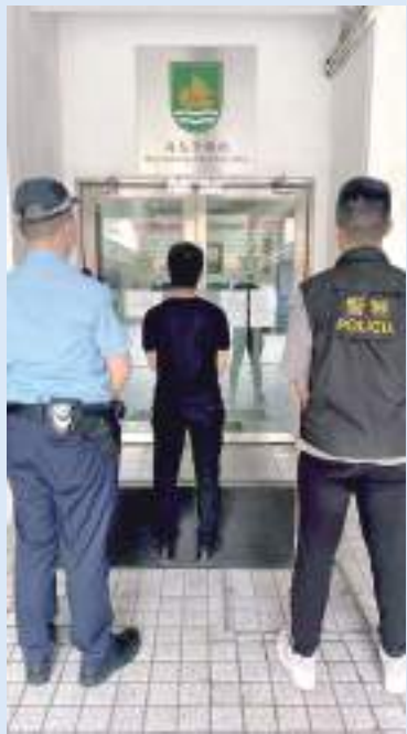
shows PSP officers escorting the theft suspect into a police station.