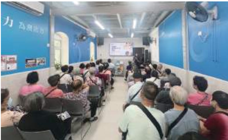
Residents attend yesterday's community health lecture about “At-home Colon Cancer Test Kits and Nutritious Diets to Prevent Colon Cancer” at the General Union of Neighbourhood Associations of Macau’s (UGAMM aka Kai Fong) Southern District Activity Centre.

The statement pointed out that most cases of colorectal cancer can be prevented and cured, and the screening can identify colorectal cancer patients who do not have symptoms and high-risk people early, allowing them to receive treatment as early as possible, in order to increase the cure rate. ■