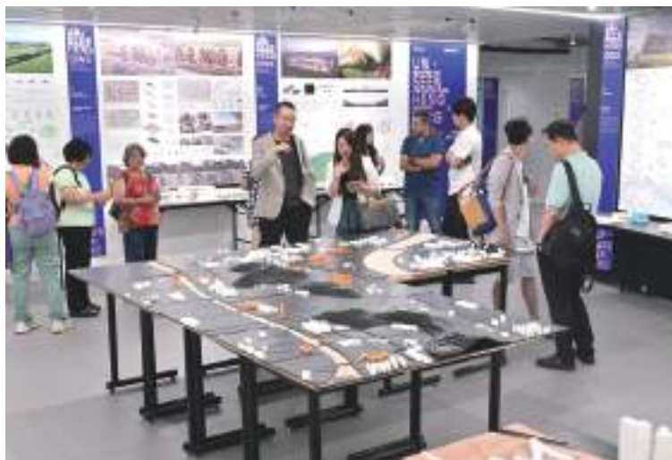
Exhibitiongoers explore works at the Kent Wong Gallery on the University of Saint Joseph's (USJ) Ilha Verde campus last night.