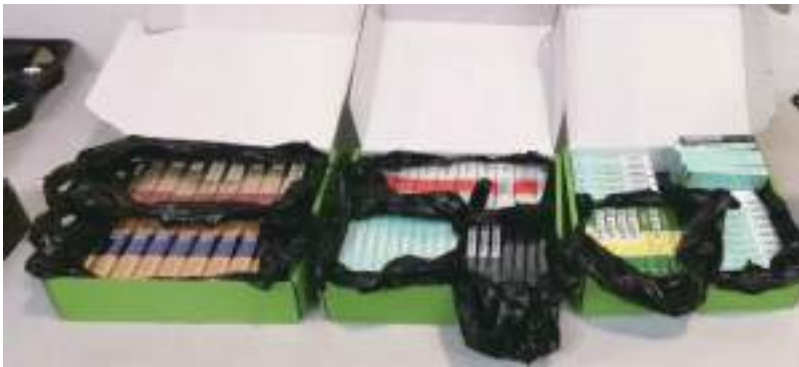
This undated handout photo released by the Customs Service on Monday shows 1,600 cigarettes smuggled in three takeaway cartons from Zhuhai to Macau.

As the suspect has violated the External Trade Law, he faces a fine of 5,000 to 100,000 patacas, according to the statement. ■