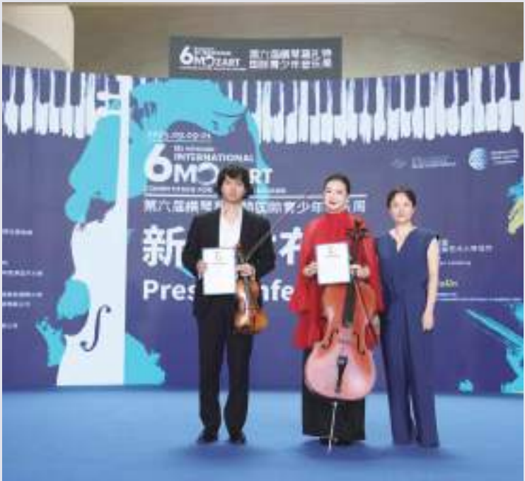
Two music performers receive awards from Huafa Music during an event at the Hengqin Culture and Art Center last Friday.

The September finals will be held at the Hengqin Culture and Art Centre, the statement said, adding that the finals will be open to the public, with free admission. For details and ticket bookings, follow Huafa Music's official WeChat account. ■