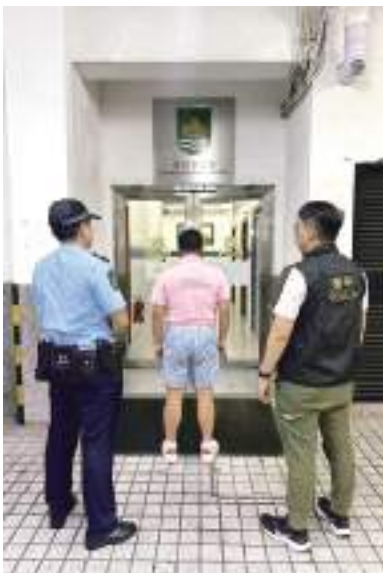
This undated handout photo provided by the Public Security Police (PSP) yesterday shows PSP officers escorting the fraud suspect into a police station.

Wu has been transferred to the Public Prosecutions Office (MP), facing a fraud charge, according to Wong. ■