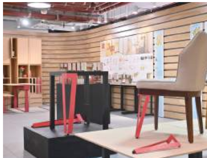
This photo shows some of the exhibits showcased at the dual exhibition.