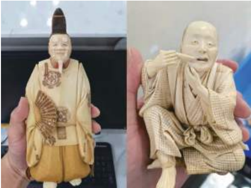
This undated handout photo provided by Zhuhai’s Gongbei Customs yesterday shows the smuggled African elephant ivory statuettes.

Customs reminded the public that African elephants are listed as protected species under Appendix I of the Convention on International Trade in Endangered Species of Wild Fauna and Flora (CITES). It is prohibited to transport endangered