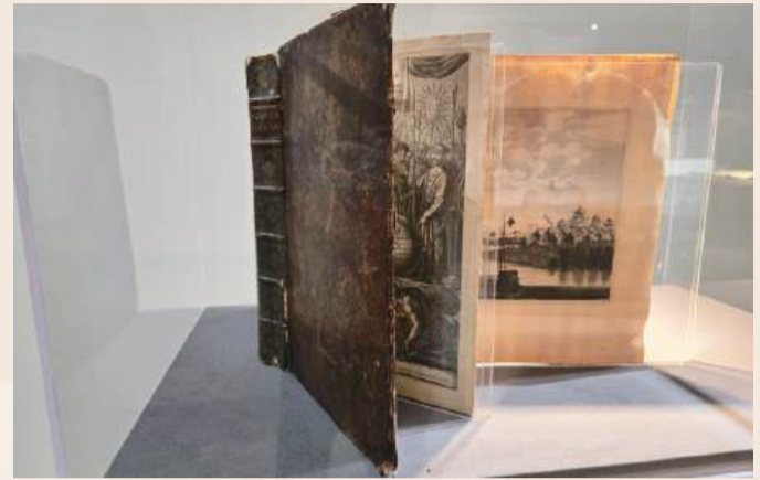
Legatio Batavica Ad Magnum Tartariae Chamum Sungteium, Modernum Sinae Imperatorem (1668), metal movable type printing (“Dutch Embassy to the Great Cham of Tartary, Modern Emperor of China”)

Dutch traveller Johan Niehof, drawing from the records of the Dutch East India Company’s delegation during their 1655 visit to China, documented the sights and experiences from their approximately 2,400-kilometer journey from Guangzhou to Beijing in this book. Published in Amsterdam in 1665, the book garnered significant attention across Europe.