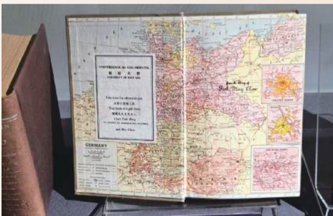
The government of Greater Germany (1938), Lead movable-type printing

“A Dictionary of the Chinese Language” is the world’s first bilingual English-Chinese and Chinese-English dictionary. It is also the earliest Chinese book to utilise Western movable type printing technology. Compiled by Robert Morrison, a Protestant missionary to China, it was printed at the Macau printing factory associated with the British East India Company and published between 1815 and 1823.