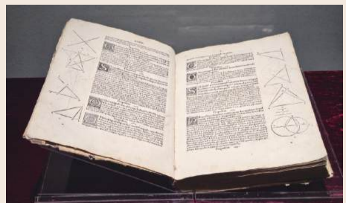
Preclarissimus liber elementorum Euclidis perspicacissimi: in artem geometrie incipit quam foelicissime (1491)