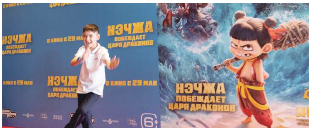
A boy poses in front of a poster for "Ne Zha 2" after the animated film's media premiere in Moscow on Sunday. The film will be officially released in Russia tomorrow.