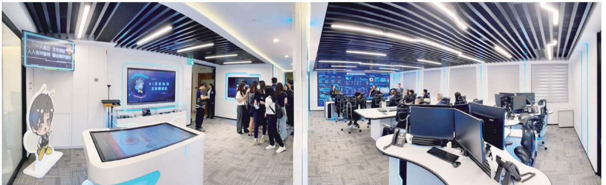
This photo shows the Anti-Fraud Coordination Centre 3.0 on the 14 th floor of the Judiciary Police (PJ) headquarters in Zape during yesterday's press conference about the launch of the upgraded centre.