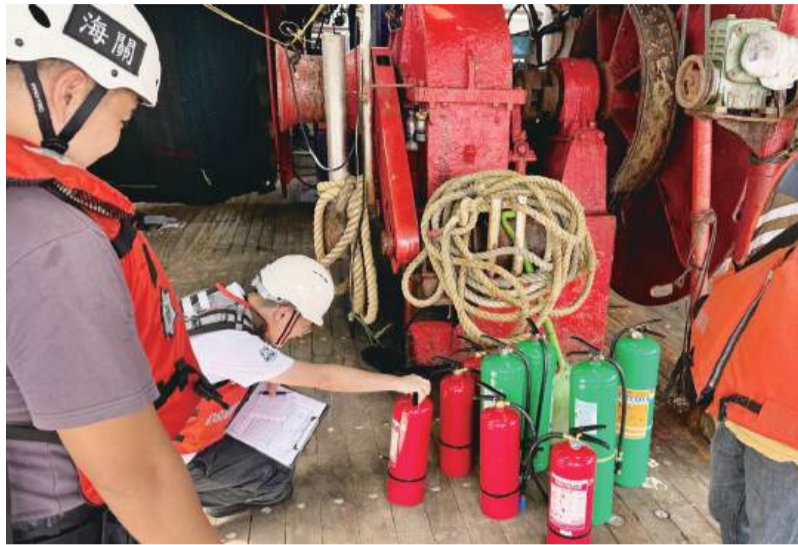
This handout photo taken and provided by the Marine and Water Bureau (DSAMA) yesterday shows DSAMA officials carrying out safety checks on board fishing vessels.

According to the statement, safety inspections have recently been conducted on multiple fishing vessels, focusing on flammable and explosive materials as well as firefighting equipment. The inspections included checking whether the fuel reserves and the number of liquefied petroleum gas cylinders were within the prescribed safety limits, whether flammable and explosive materials were stored properly, and verifying the quantity, specifications, and validity periods of firefighting