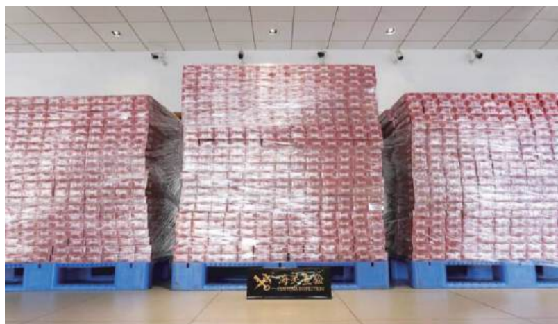
This undated handout photo released by the Gongbei customs on Sunday shows the smuggled "Manchester" cigarettes seized from a lorry stopped at the HZMB Zhuhai checkpoint on May 17.