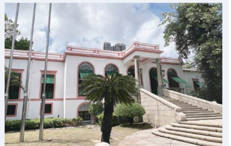
This undated handout photo provided by Fundação Oriente on Monday shows the newly renovated Casa Garden.

"The reopening of Casa Garden represents a renewed commitment to culture and the community", according to the statement, with the space set to host a variety of activities such as workshops, lectures, and interactive events that "will stimulate cultural exchanges between Macau and the world". ■