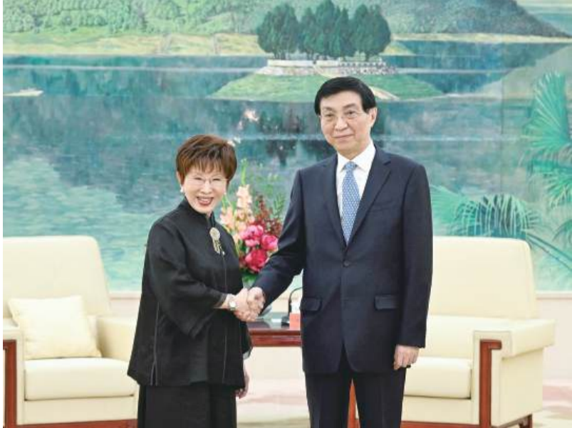
Wang Huning (right), a member of the Standing Committee of the Political Bureau of the Communist Party of China (CPC) Central Committee and chairman of the National Committee of the Chinese People's Political Consultative Conference (CPPCC), shakes hands with Hung Hsiu-chu, former chairperson of the Chinese Kuomintang (KMT) in Beijing yesterday on the sidelines of the 2 nd Cross-Strait Chinese Culture Summit.

BEIJING — Senior national leader Wang Huning yesterday called for joint efforts across the Taiwan Strait to promote Chinese culture.