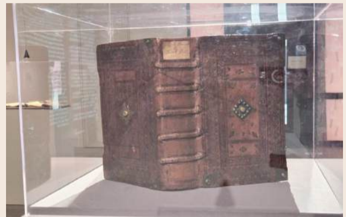
Benoit Bible: La sainte Bible: contenant le Vieil et le Nouveau Testament, ou, la Vieille et Nouvelle Alliance... (1566) (“Benedict Bible: The Holy Bible: Containing the Old and New Testaments, or, the Old and New Covenant”)

Dutch traveller Johan Niehof, drawing from the records of the Dutch East India Company’s delegation during their 1655 visit to China, documented the sights and experiences from their approximately 2,400-kilometer journey from Guangzhou to Beijing in this book. Published in Amsterdam in 1665, the book garnered significant attention across Europe.