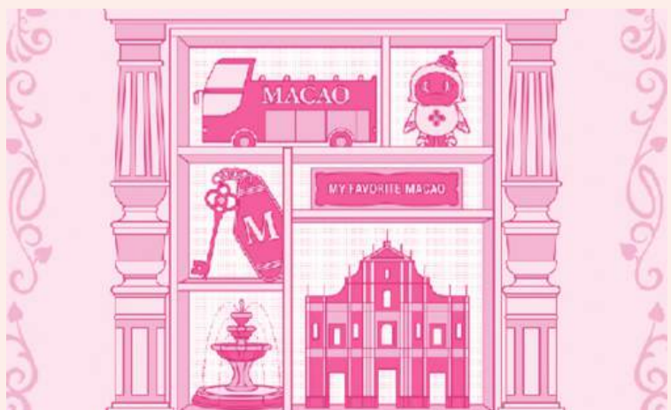
This poster provided by the Macau Government Tourism Office (MGTO) yesterday promotes its upcoming roadshow in Seoul.

** In tourism studies, travel intentions refer to a traveller's planned or anticipated behaviour regarding future trips, including the desire, motivation, and likelihood of visiting a particular destination or engaging in specific tourism activities. - DeepSeek