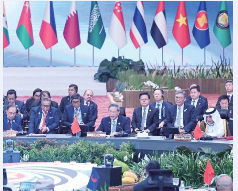
Premier Li Qiang (center) addresses the ASEAN-China-GCC Summit in Kuala Lumpur, the capital of Malaysia, yesterday.

Secondly , he called on the three sides to forge a model of