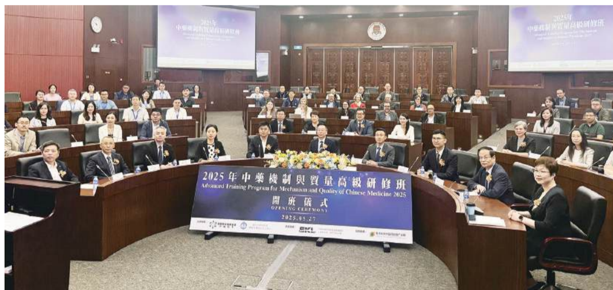
Guests and students pose for a group photo after yesterday's opening ceremony for the eight-day 12 th Advanced Training Programme on Mechanism and Quality of Chinese Medicine on the campus of the University of Macau (UM) in Hengqin.