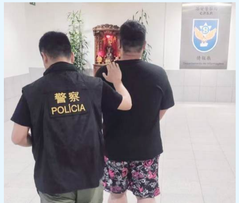
This undated handout photo provided by the Public Security Police (PSP) yesterday shows a PSP officer escorting the person in charge of a local scrapyard, suspected of illegally hiring non-local workers, into a police station.