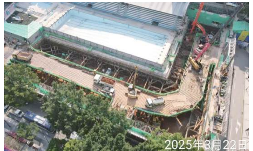
This handout photo taken in March and downloaded from the Public Works Bureau's (DSOP) website yesterday shows the basement work of the ongoing new central library project, which is being carried out on the site where the former Hotel Estoril was located.

Meanwhile, Tam also said during the meeting that the government will further improve its system for