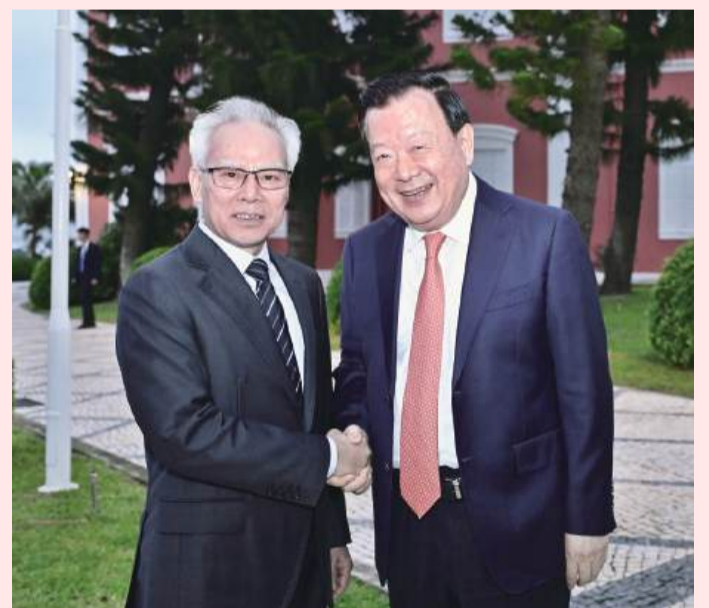
Xia Baolong (right), who heads both the Hong Kong and Macao Work Office (HKMWO) of the Communist Party of China (CPC) Central Committee and the State Council's Hong Kong and Macao Affairs Office (HKMAO), shakes hands with Chief Executive Sam Hou Fai outside Santa Sancha Mansion yesterday.

Sam pledged that his government will continue to actively implement the spirit of Xi's various important speeches and advance its governance with the strong support from the central authorities, including the State Council's Hong Kong and Macau Affairs Office and the Liaison Office in the MSAR. ■