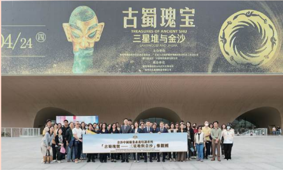
This recent handout photo provided by Sands China shows 100 staff members posing during their tour of the "Treasures of Ancient Shu - Sanxingdui and Jinsha" at the Hengqin Cultural and Art Complex last month.