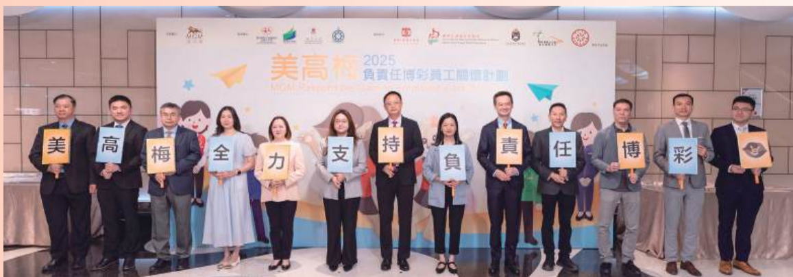
This undated handout photo from MGM shows participants posing during the opening ceremony of its latest "MGM Responsible Gaming Employee Care Programme" at MGM COTAI.

According to the statement, MGM aims to leverage innovative approaches to reinforce RG understanding and execution, building a foundation for long-term stability and sustainable development. MGM will continue to collaborate with other entities to promote RG-related information, fostering a healthy society.