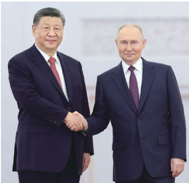
President Xi Jinping (left) shakes hands with Russian President Vladimir Putin at the Kremlin in Moscow yesterday. Xi held talks here yesterday with Putin. Putin held a welcome ceremony for Xi at the Grand Kremlin Palace's St. George's Hall.

MOSCOW – China and Russia have set a model for the world on building new-type international relations as well as on developing cooperation between major countries and between the countries as each other's biggest neighbor, said a joint statement yesterday.