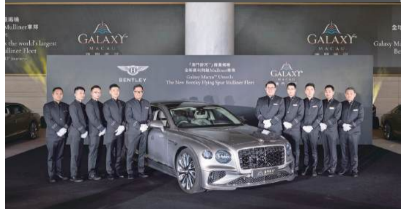
This undated handout photo provided on Wednesday by Galaxy Macau shows staff members posing with one of the Bentley Flying Spur Mulliner cars.