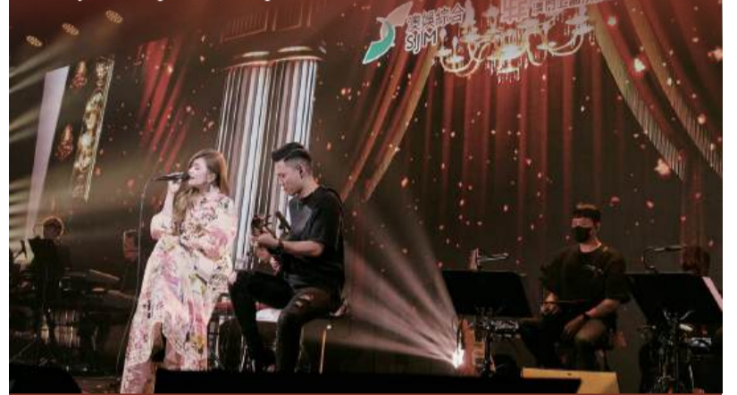
This handout photo taken on Saturday and provided by SJM Resorts on Monday shows Malaysian singer-songwriter Fish Leong performing during the "SJM Fish Leong Music Show" at The Grand Pavilion of Grand Lisboa Palace (GLP) in Cotai.

The statement noted that Leong said that she hoped that the evening had touched the hearts of her fans and that she looked forward to sharing more journeys of love and courage in the future, leaving everyone inspired and uplifted.