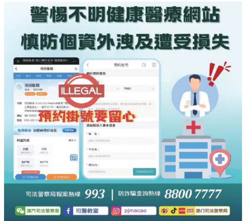
This poster provided by the Judiciary Police (PJ) yesterday warns members of the public of the fake "health-care" from the Chinese mainland.