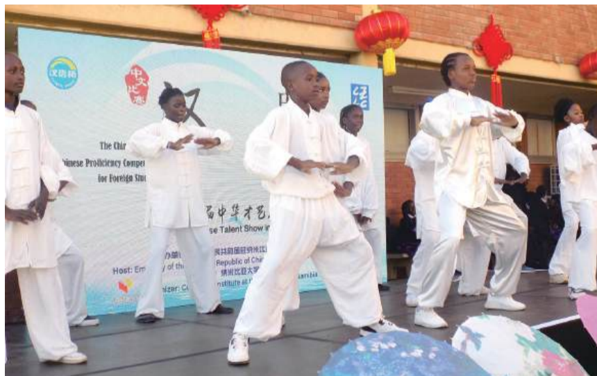
Namibian students perform Chinese martial arts during the Chinese Talent Show, part of the Chinese language competition, in the capital Windhoek, Namibia, on Tuesday. Hosted by the Chinese Embassy in Namibia and organized by the Confucius Institute at the University of Namibia (UNAM), the event marked part of UNAM’s celebrations for the Chinese Language Day, observed annually around April 20. The competition showcased Namibian students’ talents in Chinese literature, poetry, and language, underscoring the deepening cultural ties between the two countries. – Xinhua

The revision adds a human touch to the prevention and control of infectious diseases, underscoring the country’s firm commitment to human rights protection, as well as the practical wisdom behind the modernization of its governance system and capacity, Fang added. – Xinhua