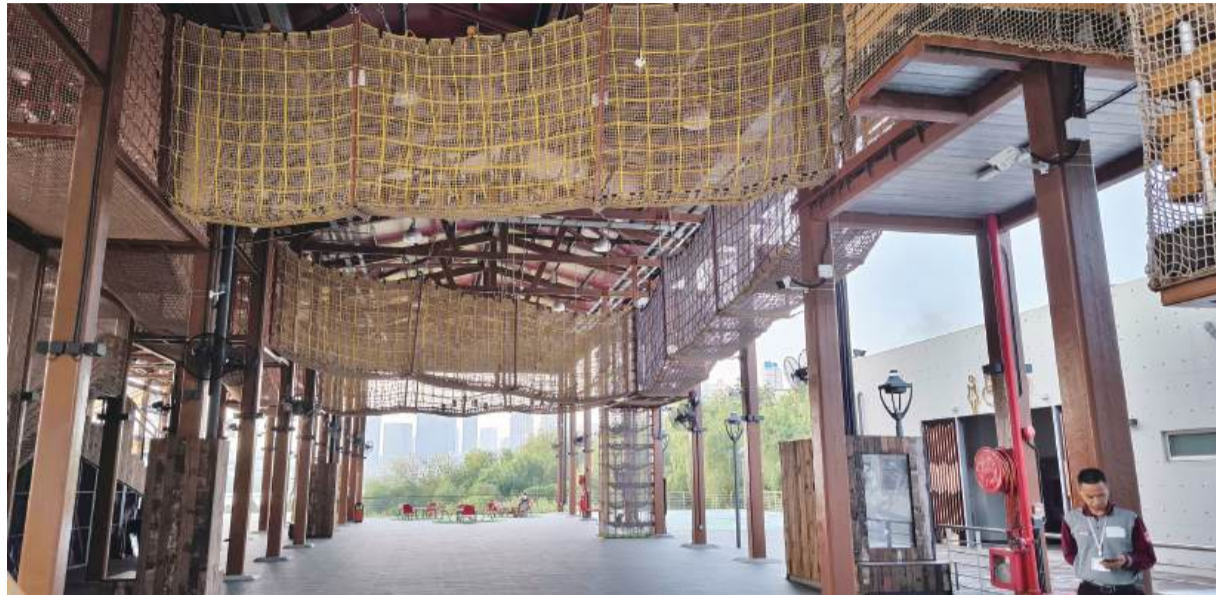
This photo taken on Tuesday shows a part of Coloane’s Lai Chi Vun shipyards revitalised area featuring play facilities for children.

upcoming orienteering competition was held on Tuesday at Galaxy International Convention Centre (GICC) in Cotai.