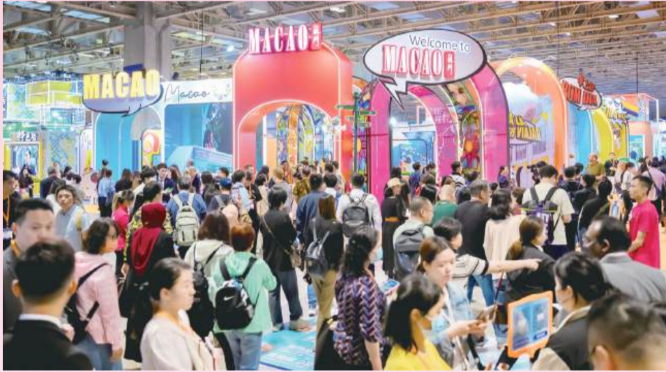
This undated handout photo provided by the Macau Government Tourism Office (MGTO) yesterday shows attendees of the three-day 13 th Macao International Travel (Industry) Expo (MITE), which was held at The Venetian Macao in Cotai between last Friday and Sunday.