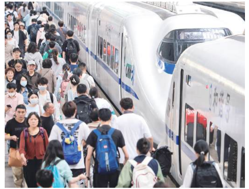
Passengers board a train at Nanjing Railway Station in Nanjing, Jiangsu Province, yesterday. China’s railway network is expected to handle approximately 144 million passenger trips during the eight-day May Day holiday travel rush, which kicked off on Tuesday, the national railway operator said.