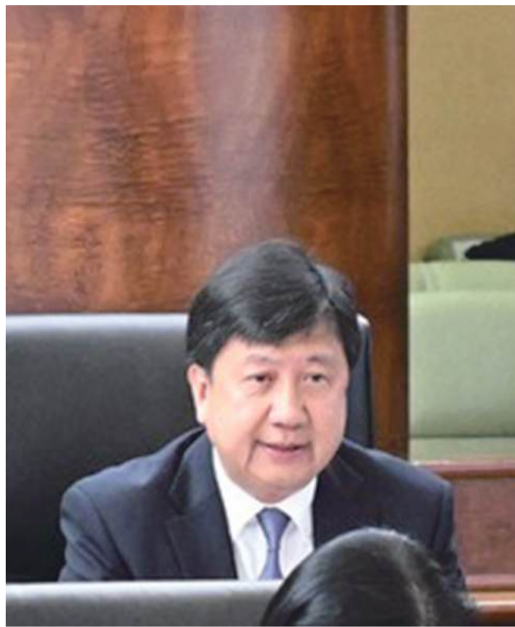
Secretary for Transport and Public Works Raymond Tam Vai Man addresses yesterday's Q&A session about his portfolio's 2025 policy guidelines in the Legislative Assembly's (AL) hemicycle.