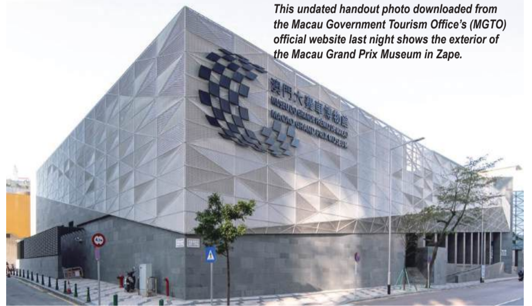
This undated handout photo downloaded from the Macau Government Tourism Office's (MGTO) official website last night shows the exterior of the Macau Grand Prix Museum in Zape.

For more information about the Macau Grand Prix Museum, one may visit the official website https://mgpm.macaotourism.gov.mo/en/ . ■