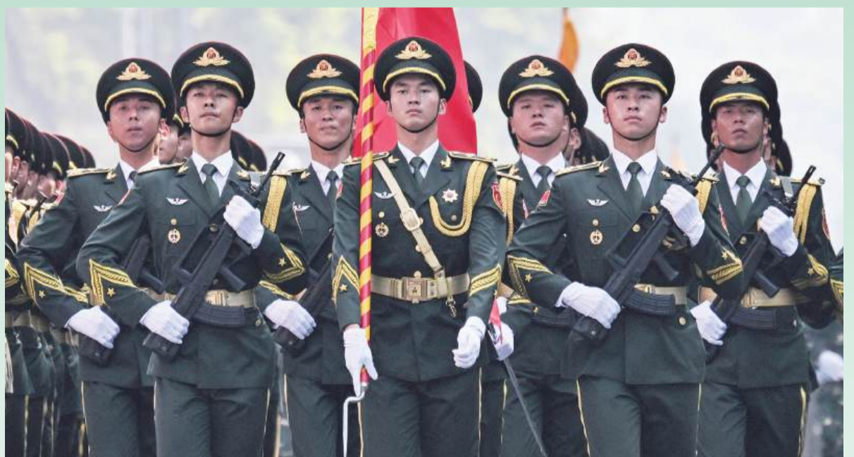
Chinese People's Liberation Army (PLA) Guard of Honour soldiers take part in a parade marking the 50 th anniversary of the fall of Saigon and the end of the Vietnam War in Ho Chi Minh City yesterday. Vietnam held its biggest celebration of the liberation of Saigon on its 50 th anniversary yesterday. — AFP

This marked the first time for the PLA's Guard of Honor to be invited to participate in a military parade in Vietnam. Troops from the Vietnamese army, navy and air force, police forces, as well as foreign military formations participated in the parade. — Xinhua