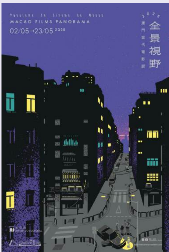
This poster provided by Cinematheque•Passion on Tuesday promotes the 2025 Panoramic Vision - Macao Contemporary Film Festival starting tomorrow.

For more details about the festival and ticket information, visit the Cinematheque•Passion website and social media platforms. ■