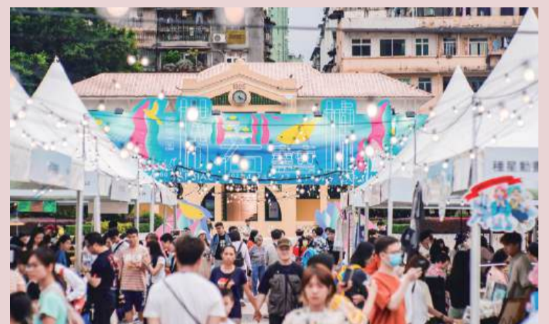
This undated handout photo provided by the Cultural Affairs Bureau (IC) yesterday depicts the Tap Siac Craft Market, featuring a diverse array of stalls and installations.