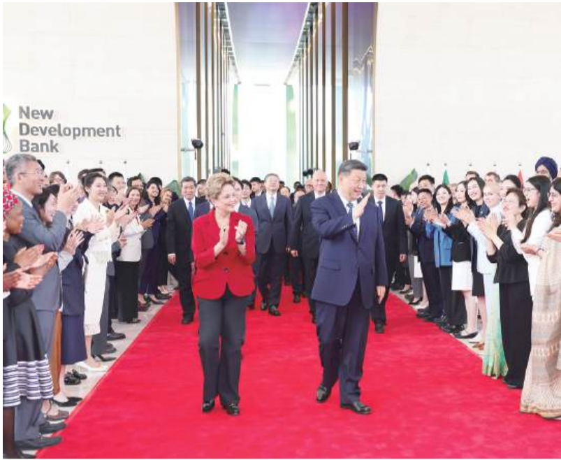
President Xi Jinping (front, right) arrives at the New Development Bank, welcomed by Dilma Rousseff (front, left), president of the lender, in Shanghai yesterday.

SHANGHAI — President Xi Jinping yesterday visited the New Development Bank (NDB) in Shanghai and met with Dilma Rousseff, president of the institution.