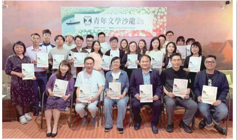
Participants take a group photo during Friday's literary salon at Wine Macau.