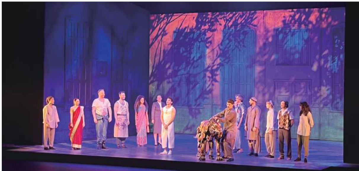
The cast of Life of Pi take a bow after Saturday night's show at the Grand Auditorium of the Macao Cultural Centre (CCM).