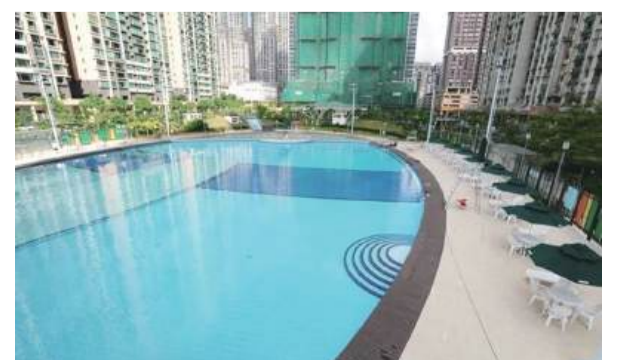
This undated handout photo from the Sports Bureau (ID) shows the Taipa Central Swimming Pool (氹仔中央公園泳池).

Furthermore, the statement noted that the daily opening hours for the pools will be divided into three sessions. For more details, please visit: www.sport.gov.mo . ■