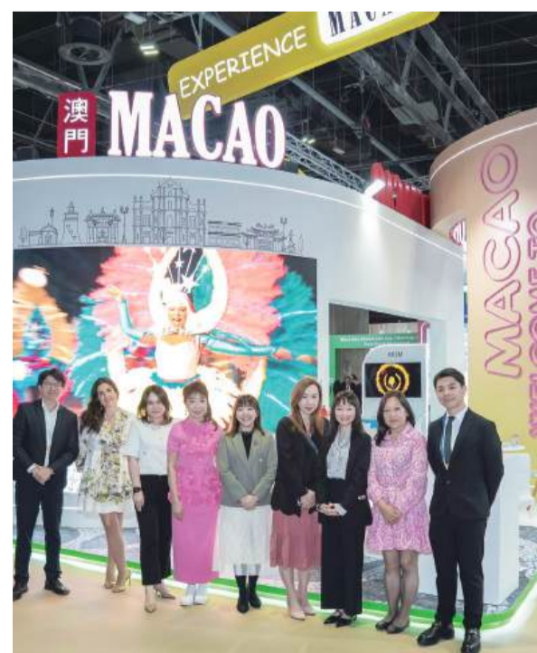
This undated handout photo provided by the Macau Government Tourism Office (MGTO) shows representatives posing at the "Experience Macao" booth at the Arabian Travel Market (ATM) 2025 in Dubai.

Other ongoing efforts like setting up the Halal Horizons Pavilion at the recent 13 th MITE and regular training are also held aiming to tap into the Muslim tourism market, according to the statement. ■