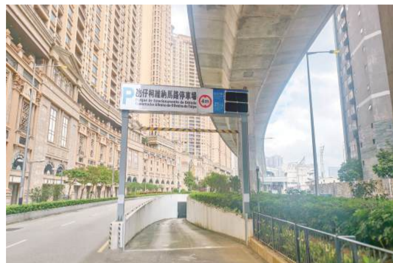
This undated handout photo released by Macau Light Rapid Transit Corporation Limited (MLM) yesterday shows the entrance to the underground parking area on Estrada Governador Albano de Oliveira in Taipa.

The underground parking area for heavy passenger vehicles on Estrada Governador Albano de Oliveira came into use in May 2022, but its usage rate has