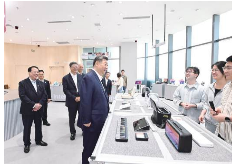
President Xi Jinping (center), also general secretary of the Communist Party of China (CPC) Central Committee and chairman of the Central Military Commission, talks to staff members at an AI product experience store at the Shanghai Foundation Model Innovation Center, a large-model incubator home to over 100 enterprises in Shanghai yesterday. Xi paid an inspection visit to Shanghai yesterday.

Shanghai announced a comprehensive plan last December aimed at developing a world-class AI industry ecosystem by 2025, including measures to step