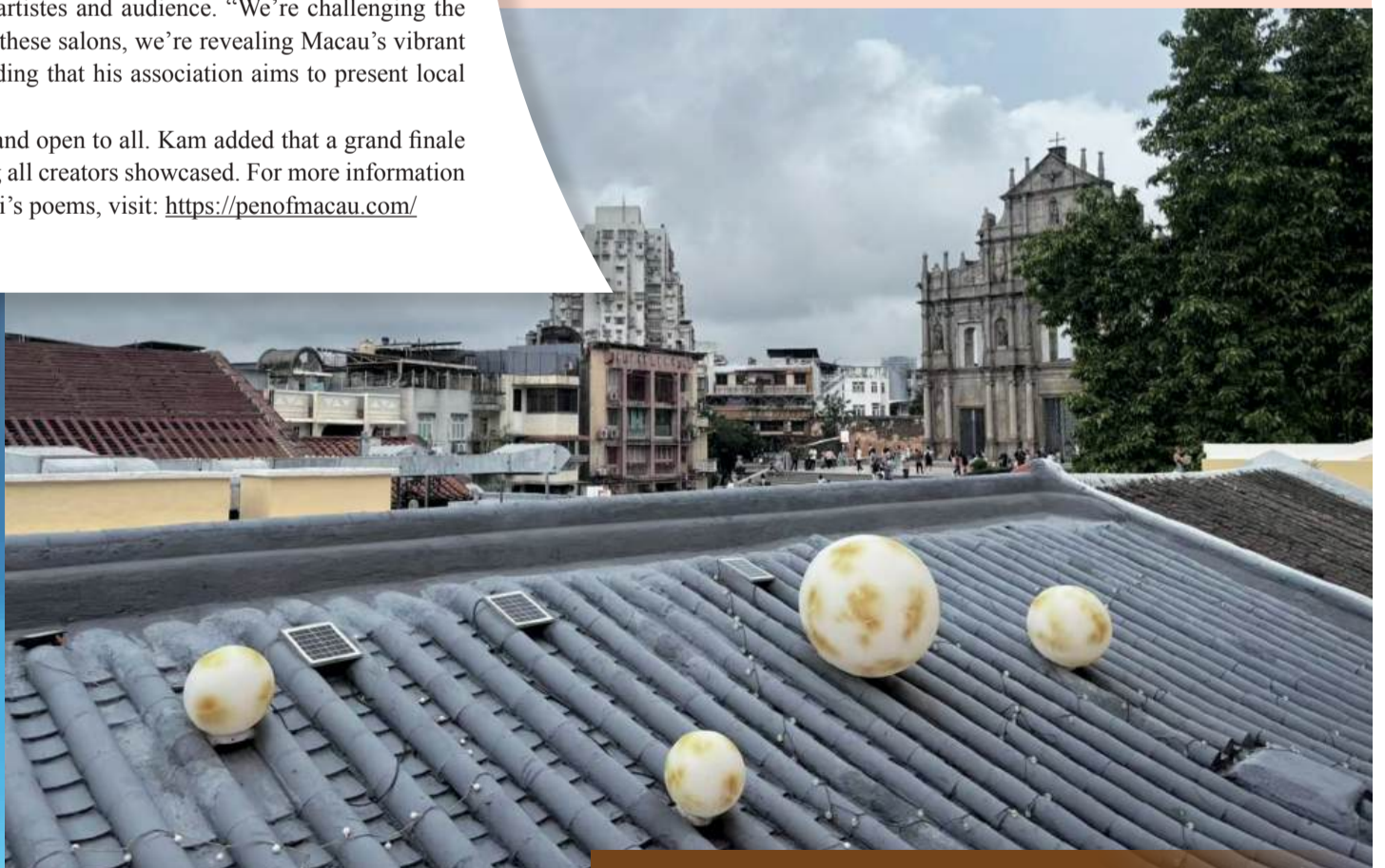
This photo taken on Friday from the upper floor of Wine Macau shows the scenery of the Ruins of St. Paul and its surroundings.