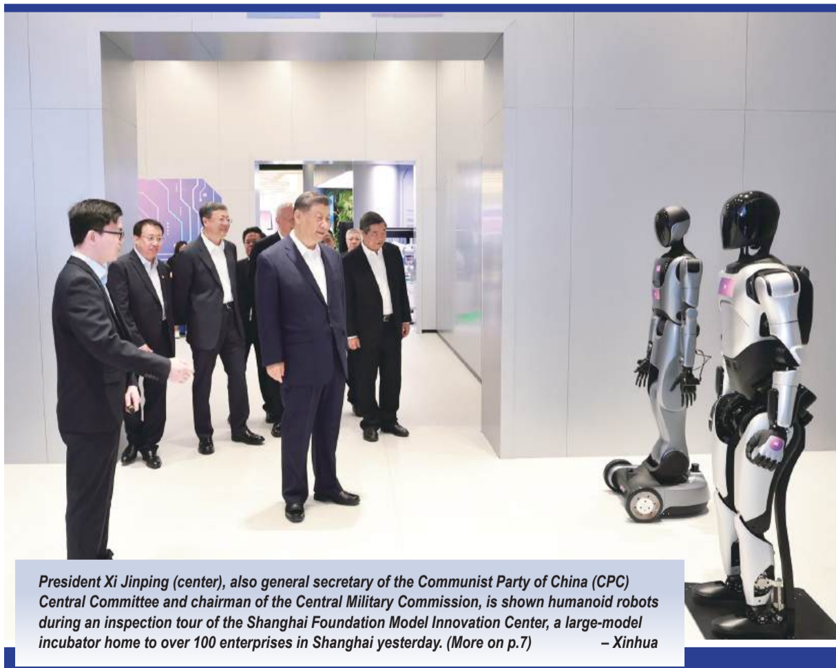
President Xi Jinping (center), also general secretary of the Communist Party of China (CPC) Central Committee and chairman of the Central Military Commission, is shown humanoid robots during an inspection tour of the Shanghai Foundation Model Innovation Center, a large-model incubator home to over 100 enterprises in Shanghai yesterday. (More on p.7)