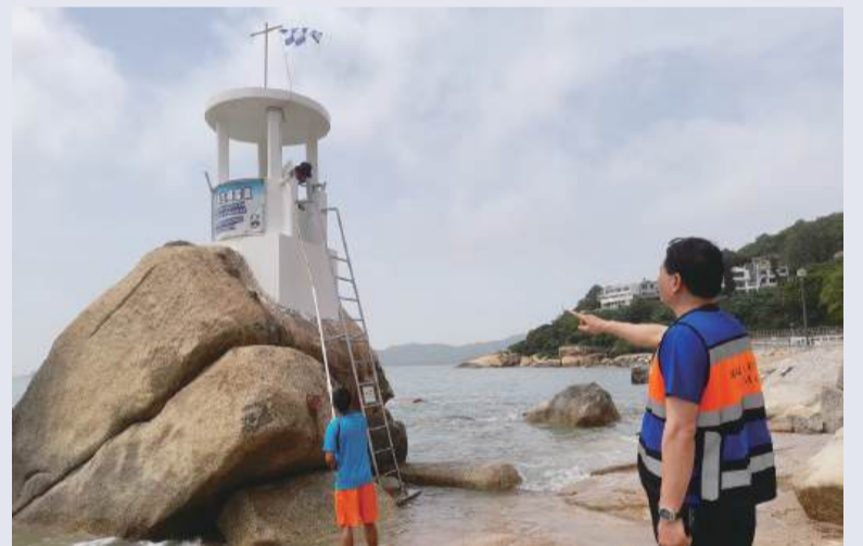
This undated file photo from the official website of the Macau Marine and Water Bureau (DSAMA) shows workers maintaining a lifeguard tower at Cheoc Van Beach.

The bureau reminded beachgoers and swimmers to pay attention to the latest notices, flags on site and their personal physical condition before swimming in the sea, avoid touching marine life, and not to enter the sea if feeling unwell or having any injury. Meanwhile, if there is any emergency, the swimmers and