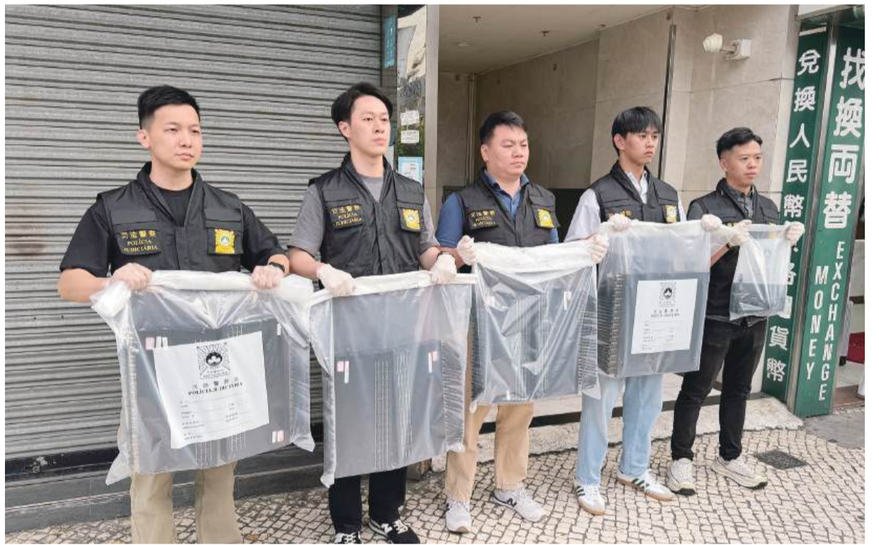
Judiciary Police (PJ) officers display the eight GOIP devices used in the 46 scams outside the crime scene near the northern district's Barrier Gate checkpoint yesterday afternoon.