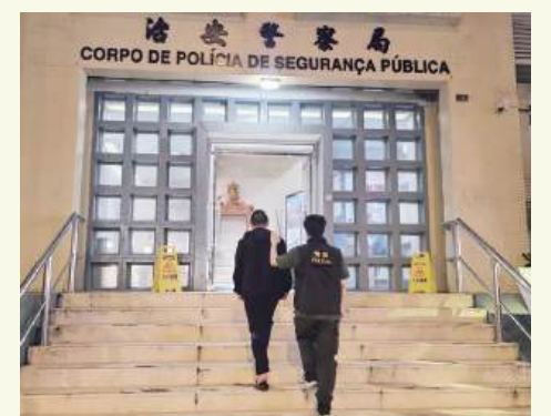
This undated handout photo provided by the Public Security Police (PSP) yesterday shows a PSP officer escorting the phoney phone suspect into a police station.