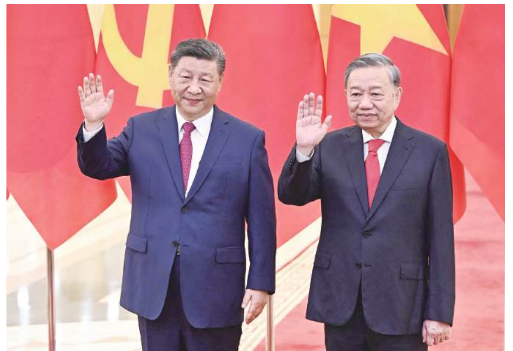
Vietnam's Communist Party General Secretary To Lam (right) and President Xi Jinping wave during a meeting at the Office of the Party Central Committee in Hanoi yesterday.