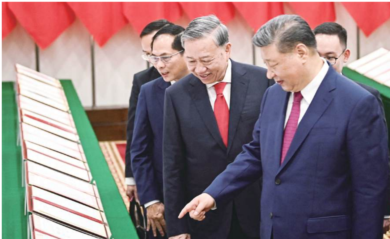
President Xi Jinping (front) and Vietnam's Communist Party General Secretary To Lam (centre) look at copies of agreements signed between China and Vietnam following their meeting at the Office of the Party Central Committee in Hanoi yesterday. Xi warned that protectionism “leads nowhere” and that a trade war would have “no winners”, as he arrived in Vietnam yesterday for a two-day visit on the first leg of a three-nation tour of Southeast Asia, which also includes Malaysia and Cambodia. (More on p. 6)