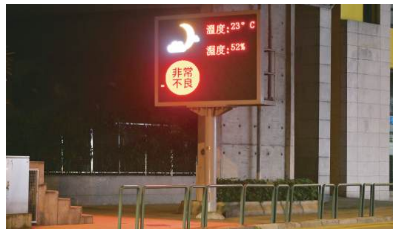
An electronic sign near Flora Garden (二龍喉公園) shows Macau's temperature, relative humidity and "very bad" air quality last night.

that he had heard the news about the city's bad air quality, which made him feel "a bit surprised", adding that he did not expect the situation to be that serious. "I mustn't forget that I need to wear a mask when I go out."