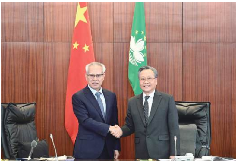
Chief Executive Sam Hou Fai (left) shakes hands with Legislative Assembly (AL) President Kou Hoi In after presenting his policy address during yesterday afternoon's plenary session in the legislature's hemicycle.

N.B. Translation arranged by The Macau Post Daily. The Chinese-language statement was released by the office last night.