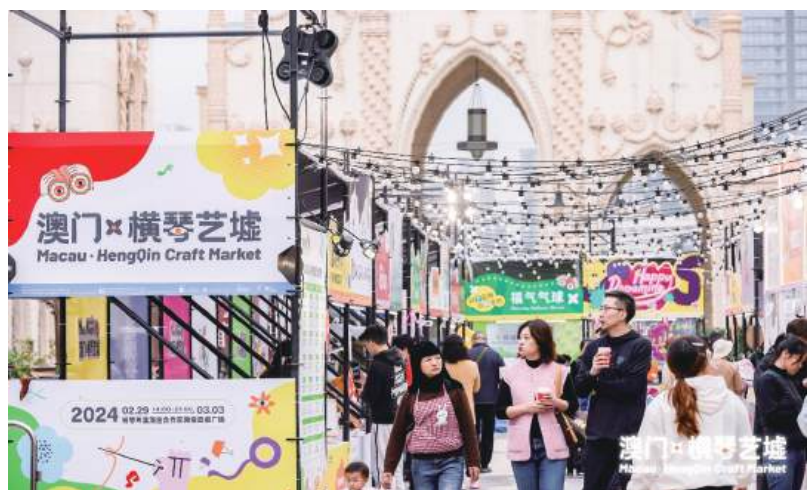
This undated file photo shows last year's "Macao • Hengqin Craft Market", which was held at Ponto Legend Square in Hengqin.

Those interested may call 8399 6292 or 8399 6289. ■