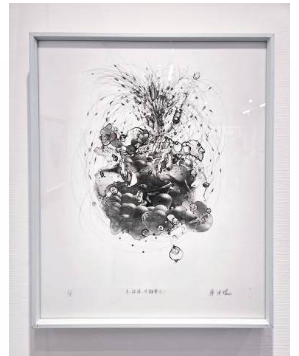
Lord, can I have some eggs instead?

The exhibition will run until May 11, with free admission. It is closed on Mondays. The gallery opens from 1 p.m. to 7 p.m. For more information, visit: www.cloudgallerymo.com