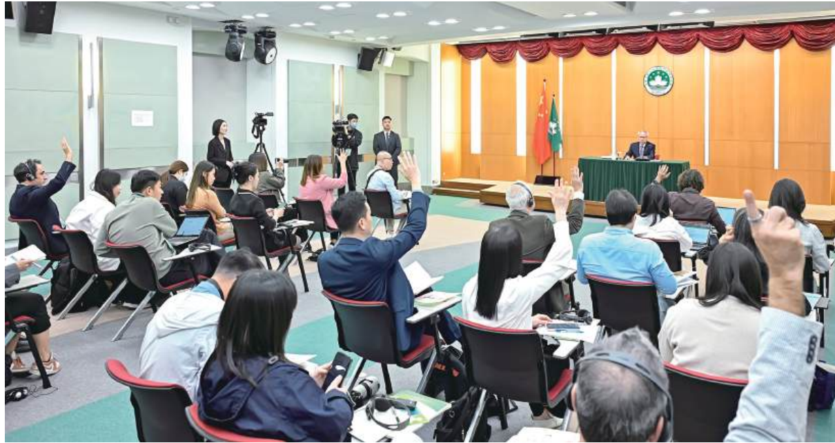
Journalists raise their hands to ask questions during yesterday evening's press conference at Government Headquarters in Nam Van about Chief Executive Sam Hou Fai's 2025 Policy Address.

However, Sam said, the government will improve the system for its annual wealth-sharing programme in line with opinions raised by various segments of civil society, adding that the government will then use the money that it can save thanks to lower expenditure on its wealth-sharing programme to enhance various other social welfare measures and promote