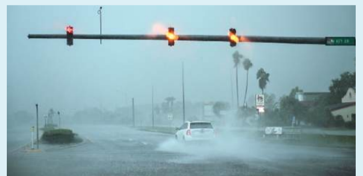
A car drives through the heavy rain in Fort Myers, Florida, yesterday as Hurricane Milton approaches. Milton regained power on Tuesday to become a Category 5 storm with maximum sustained winds of 270 kph as it barrels towards the west-central coast of Florida, according to the US National Hurricane Centre. — AFP

By yesterday morning (local time), Milton was located 400 kilometres southwest of Tampa, generating maximum sustained winds of 250 kph, according to the National Hurricane Center (NHC). — AFP