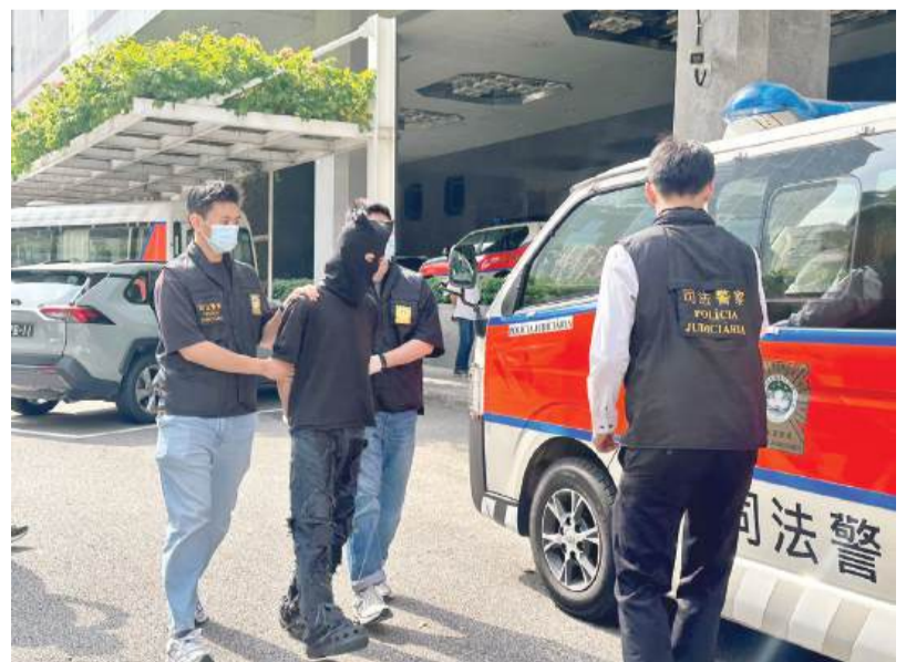
The hooded organised crime and fraud suspect from Hong Kong is escorted by Judiciary Police (PJ) officers from the PJ headquarters to a police vehicle in Zape after yesterday's special press conference.

The suspect was transferred to the Public Prosecutions Office (MP), facing charges of organised crime and fraud, the spokesperson said, adding that at the time of the press conference PJ officers were still tracing the whereabouts of the ill-gotten money and other suspects involved in the case. ■