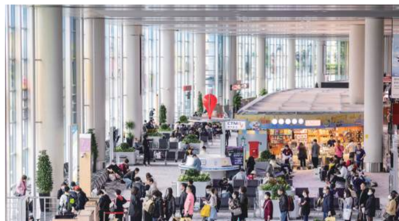
This undated handout photo released by CAM yesterday shows the local airport's boarding area.

The statement also underlined that the local airport will continue with its campaign to expand its passenger routes to destinations in Southeast and Northeast Asia. ■