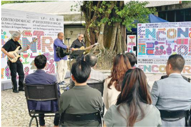
Goa Groovie Band, a local Portuguese art group, performs during yesterday’s kick-off ceremony of the “Encounter in Macau – Arts and Cultural Festival between China and the Portuguese-speaking Countries” at the waterfront Taipa Houses museum complex.

According to Leong, once again to be held in parallel with the “2024 GEG Lusofonia Festival”, the “representative brand event” of the Encounter in Macau – Arts and Cultural Festival, through programmes such as “Chinese and Portuguese Picture Book Fair”, “Memories • Legacies • Mutations - Annual Arts Exhibition between China and the Portuguese-speaking Countries”, “GEG Traditional Music and Dance Performance in the Community”, “China and the Portuguese-speaking Countries Film Festival”, “Wine tasting workshops”, “Tito Paris Concert with the Macao Chinese Orchestra”, features 70 sessions with more than 700