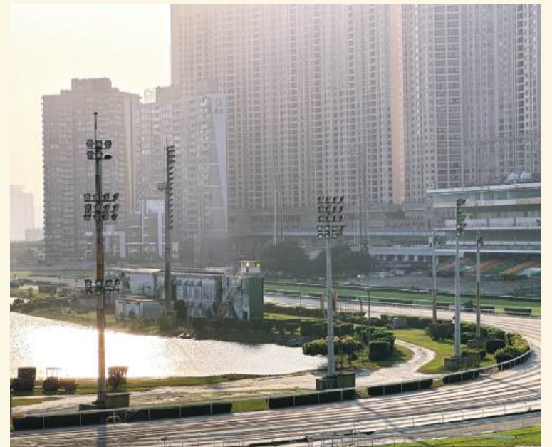
This file photo taken in May shows part of the former Macau Jockey Club site in Taipa.

The suspect refused to cooperate with the PJ officers, and he was transferred to the Public Prosecutions Office (MP) yesterday, facing charges of usury and illegal imprisonment. ■