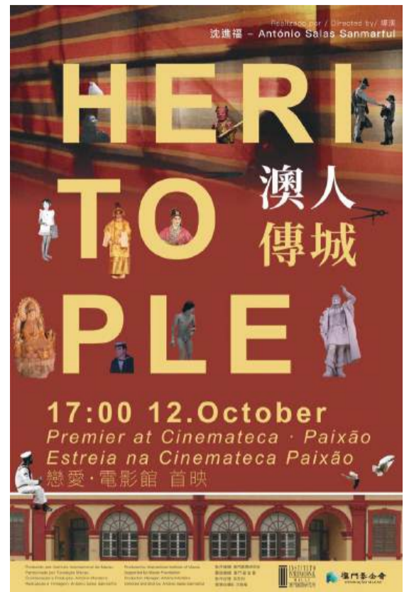
This poster provided by the International Institute of Macau (IIM) earlier this week promotes "Heritople", which premieres this Saturday at Cinematheque•Passion.

The film's trailer can be viewed on https://www.youtube.com/watch?v=0oE9V-71oI1&t=7s