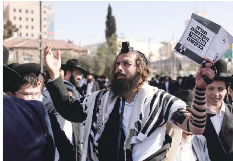
An ultra-Orthodox Jewish man prays during a protest against conscription into Israel's military in Jerusalem yesterday.