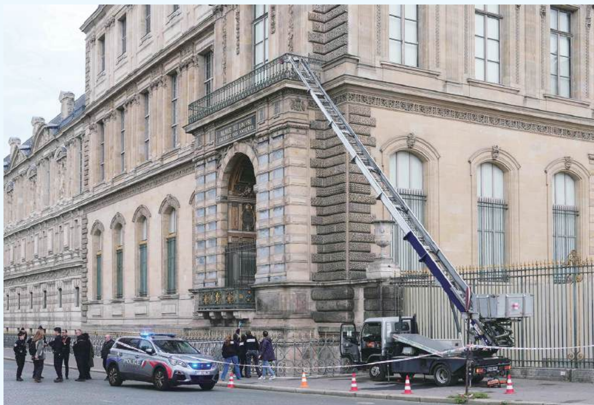
French police officers stand next to a furniture elevator used by thieves to enter the Louvre Museum, on Quai François Mitterrand, in Paris on October 19, 2025. Police have arrested five new people, including a main suspect, over this month's daring jewellery theft from the Louvre museum, the Paris prosecutor said yesterday.

The five detentions took place in and around Paris, particularly in Seine-Saint-Denis, a region just outside the French capital.