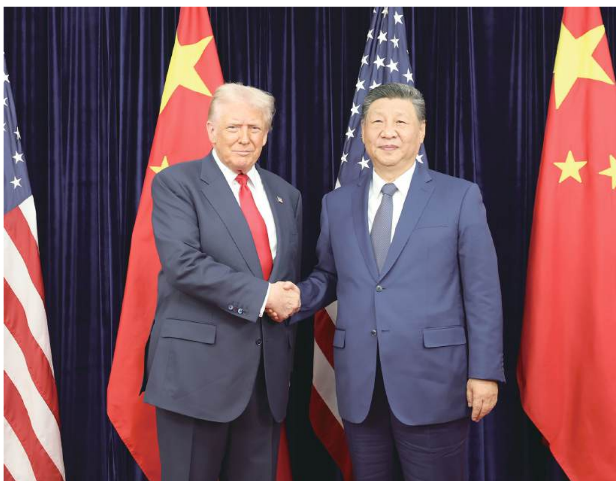
President Xi Jinping shakes hands with US President Donald Trump in Busan, South Korea, yesterday.

“We have the confidence and capability to navigate all kinds of