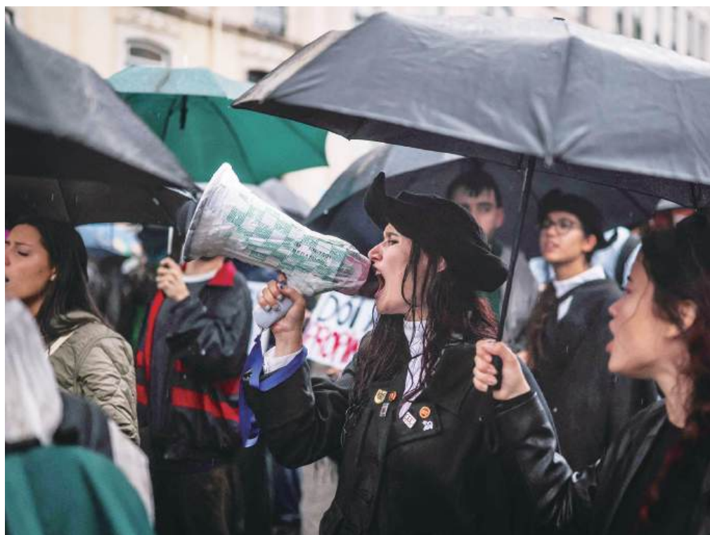
University students protest in front of the Portuguese parliament in Lisbon on Tuesday against an increase in tuition fees. – AFP

If a change is agreed, a “coordinated” plan would be proposed by the governments, said an infrastructure ministry statement. – AFP