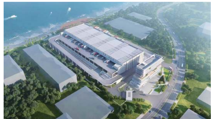
This artist's rendition downloaded from the website of COSCO SHIPPING Logistics & Supply Chain Management yesterday shows the future Macau International Airport Hengqin Upstream Cargo Terminal.

The upstream cargo terminal will be built on a 66,700-square-metre plot of land at the west end of Hengqin island. The complex, with a gross construction area of 97,600 square metres, will comprise