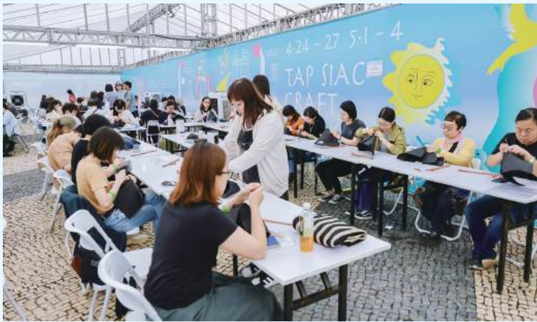
This undated handout photo recently provided by the Cultural Affairs Bureau (IC) shows participants in a previous Tap Siac Craft Market workshop.