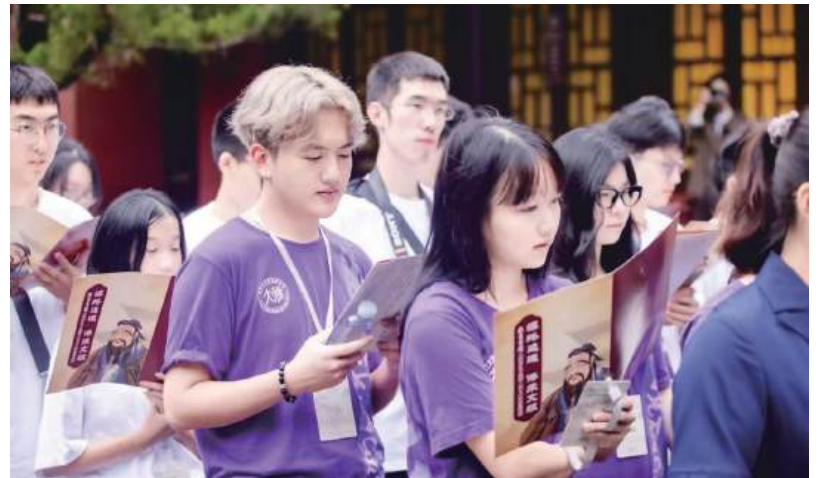
This undated handout photo provided by the University of Macau (UM) on Tuesday shows students from the public university's Cheng Yu Tung College (CYTC) attending the Confucius Memorial Ceremony at Hunan University (HNU) in Changsha, capital of Hunan Province.

The exchange programme aimed to strengthen ties between the two universities and foster mutual appreciation of Chinese heritage, the statement said, adding that Yuelu Academy is expected to send its students to visit CYTC in Macau in August next year, with the goal to continue the spirit of academic and cultural exchange. ■