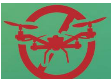
This image provided by the Civil Aviation Authority of Macau (AACM) yesterday shows the regulator's logo announcing its no-fly order for drones.

The no-fly notice was published in the Official Gazette (BO) yesterday. ■