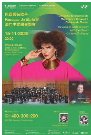
This poster recently provided by the Cultural Affairs Bureau (IC) promotes the "Vanessa da Mata Concert with the Macao Chinese Orchestra" event set to be held on November 15 at the Macao Cultural Centre's (CCM) Grand Auditorium.