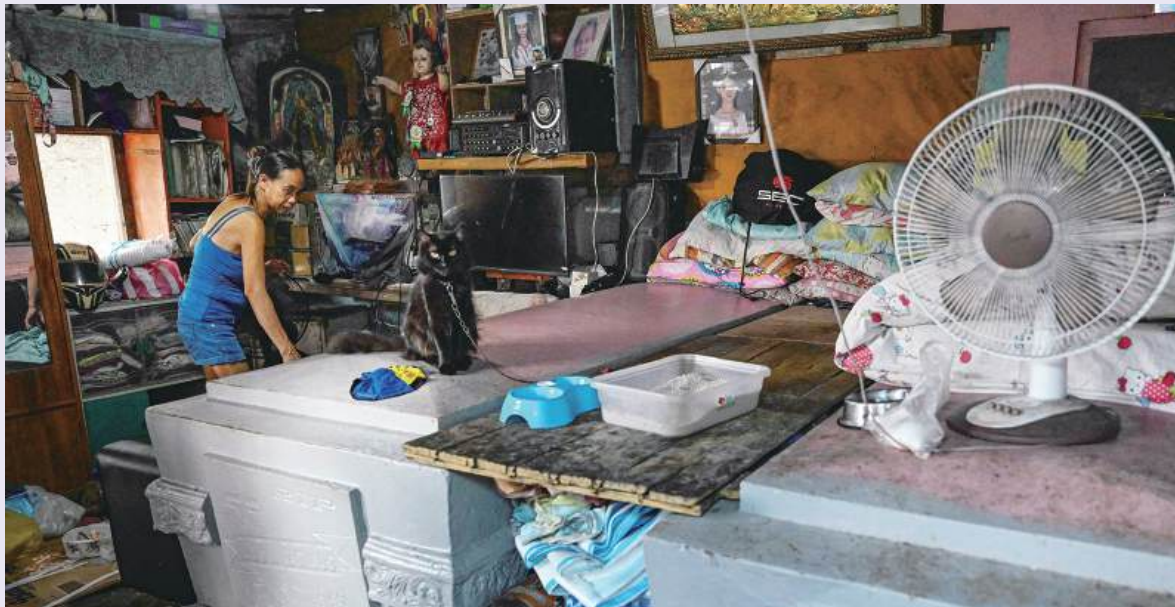
This photo taken on October 21 shows resident Priscilla Buan cleaning around the tombs inside her makeshift house at Manila North Cemetery in Manila.