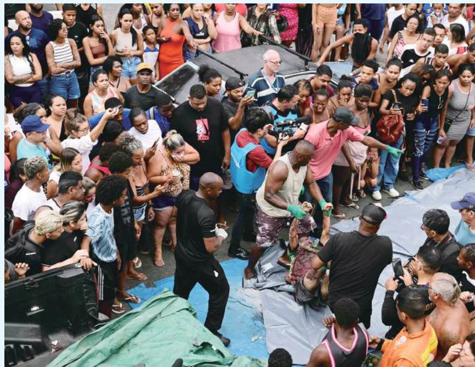
Residents carry a dead body on São Lucas Square of the Vila Cruzeiro favela (shantytown) at the Penha complex in Rio de Janeiro on Wednesday, in the aftermath of Operação Contenção (“Operation Containment”). Residents of the slum lined up more than 50 bodies at the square on Wednesday, a day after the bloodiest police operation in the city's history, according to local media reports.

RIO DE JANEIRO – The head, its hair dyed red, was severed from the body and found in dense vegetation near a Rio favela, some 24 hours after Brazil's deadliest-ever police operation.