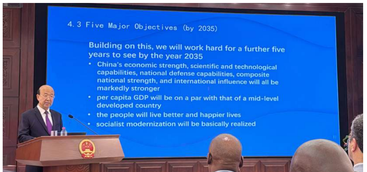
Foreign Affairs Ministry Commissioner Liu Xianfa speaks during Wednesday's power-point presentation at the Commission in Zape on Wednesday.

On the historical front, Liu noted that China's first Five-Year Plan was launched by the Party in 1953 (the year I was born) when Mao proposed the Four Modernisations, i.e., the development of modernised industry, modernised agriculture, modernised transportation, and modernised national defence.