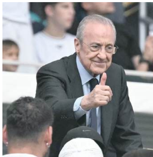
President of Real Madrid Florentino Perez gives a thumbs-up to the fans ahead of the FIFA Club World Cup 2025 round of 16 against Italy’s Juventus at the Hard Rock Stadium in Miami on July 1.