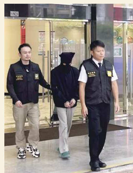
Judiciary Police (PJ) officers escort the hooded repairshop theft suspect to a PJ van outside the PJ headquarters in Zape yesterday.

many years kept several gold items in a safe in her bedroom in Patane, with the safe key kept in a bag nearby. The victim had hired the woman as a live-in domestic helper in September 2023, Cheong said.