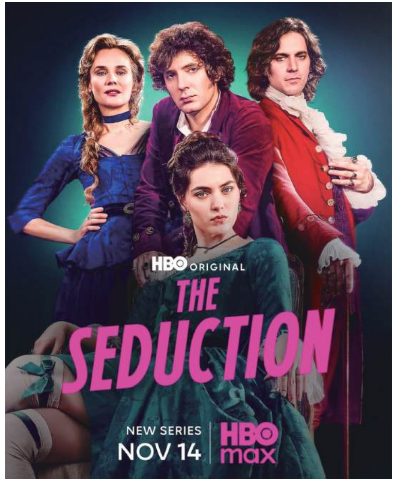
Poster for “The Seduction”

She educates herself and marries a powerful nobleman in order to wage a vengeful war against men