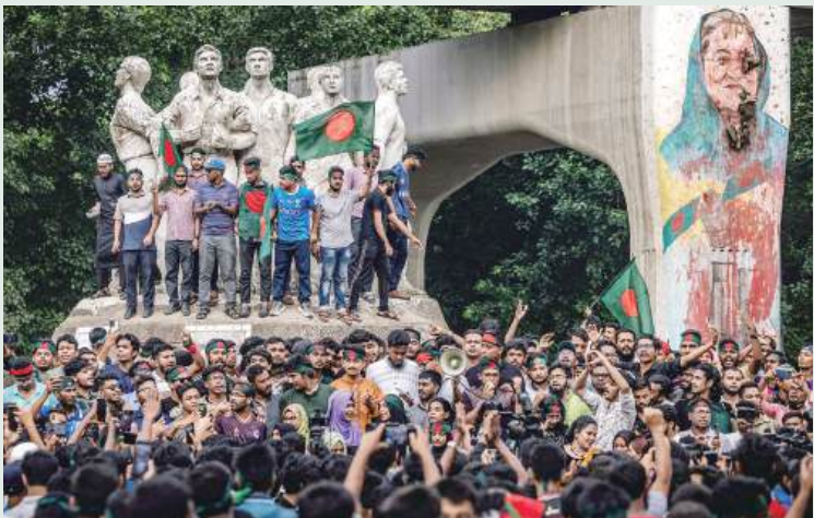
Students chant slogans as they protest to demand accountability and trial against Bangladesh's ousted Prime Minister Sheikh Hasina, near Dhaka University in the capital on August 12, 2024. Bangladesh's fugitive ex-leader Sheikh Hasina warned on Wednesday that holding elections without her party – the first since her overthrow – was "sowing the seeds" of further division in her country. Toppled in August 2024 by a student-led uprising that ended her 15-year autocratic rule, Hasina fled by helicopter as crowds stormed her palace. The 78-year-old former prime minister has been in hiding ever since, hosted by old ally India.

"The best-case scenario is that things don't deteriorate – that Takaichi doesn't fully embrace the far-right, Abe-style approach, or blindly take Washington's side in every trilateral issue despite the existing US-Japan-South Korea cooperation," he said.