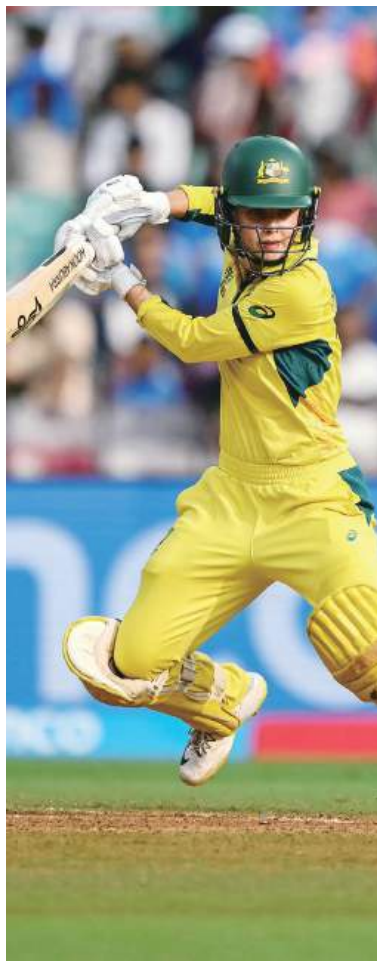
Australia's Phoebe Litchfield plays a shot during the ICC Women's Cricket World Cup 2025 one-day international (ODI) semi-final against India at the DY Patil Stadium in Navi Mumbai, India yesterday.

The winners will face South Africa, who beat England in the first knockout tie, in the final at the same venue on Sunday.