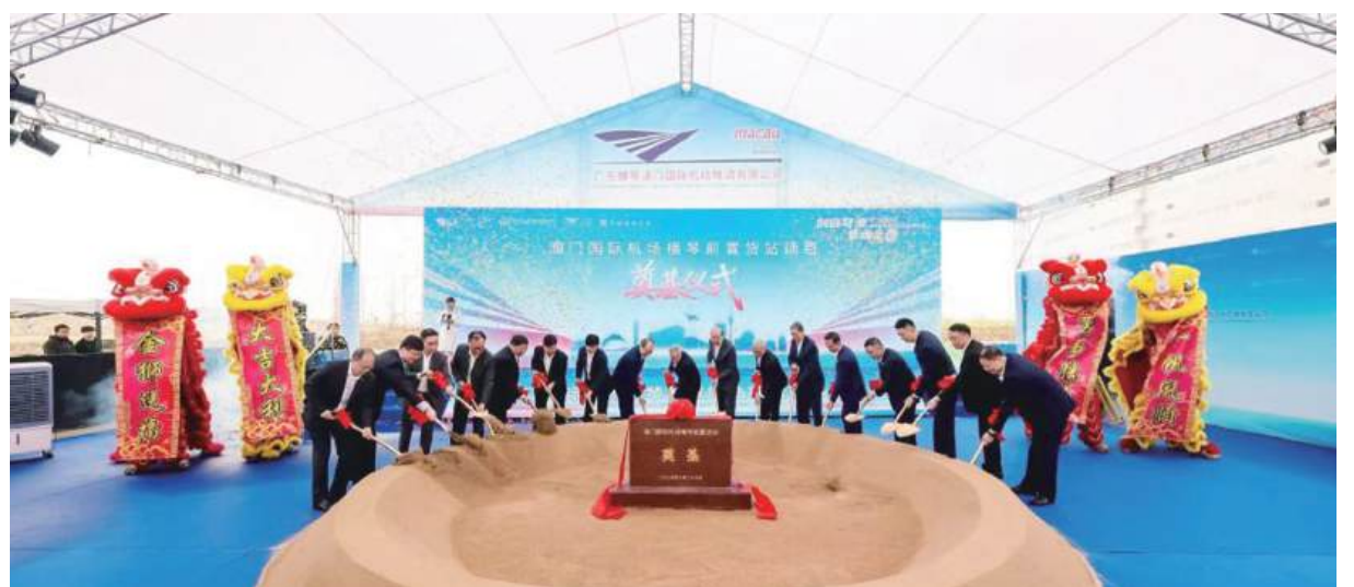
Dignitaries symbolically break ground on the upstream cargo terminal project in Hengqin on Tuesday.