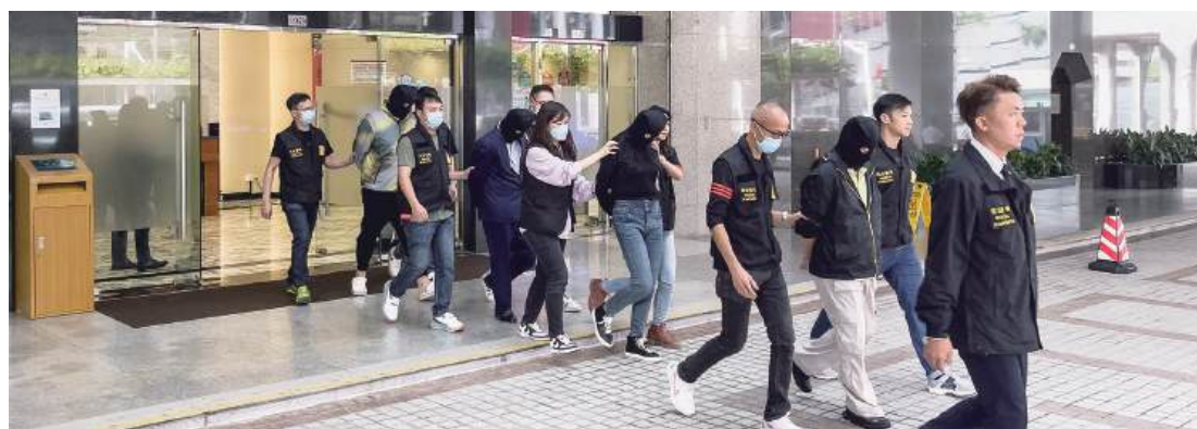
Judiciary Police (PJ) officers escort the four hooded casino fraud suspects to a PJ van outside the PJ headquarters in Zape yesterday.

The quartet were transferred to the Public Prosecutions Office (MP) yesterday facing charges of fraud, money laundering and document forgery. ■