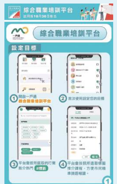
This undated poster provided by the Labour Affairs Bureau (DSAL) yesterday shows the enrolment process of the trial version of the "Integrated Vocational Training Platform".

The statement noted that the platform digitally integrates local