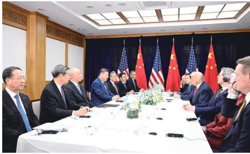
President Xi Jinping (left, center) meets with US President Donald Trump in Busan, South Korea, yesterday.