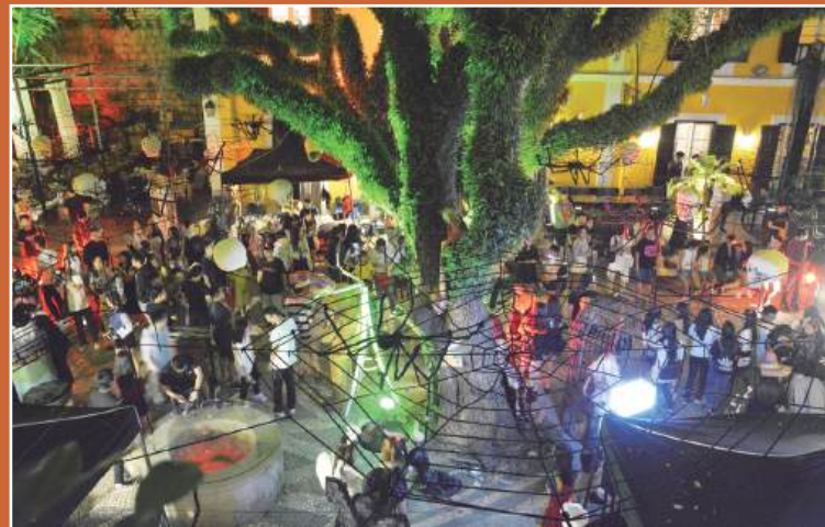
This file photo provided by CAC - Círculo dos Amigos da Cultura de Macau (“Circle of the Friends of Macau’s Culture”) on Monday shows a bird’s eye view of a previous Halloween Albergue SCM.

*Albergue is Portuguese for “hospice”. SCM stands for Santa Casa da Misericórdia (“Holy House of Mercy”), Macau’s oldest charitable organisation.