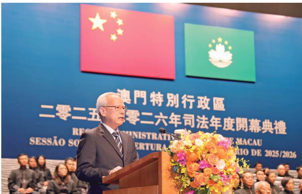
Chief Executive Sam Hou Fai addresses yesterday's ceremony marking the start of the 2025/26 Judicial Year at the Macau Cultural Centre (CCM) in Nape.

Since the establishment of the Macau Special Administrative