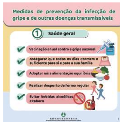
This poster provided by the Health Bureau (SSM) gives the public flu prevention advice.

Meanwhile, 10 cases of norovirus infection were reported in September, a decrease of 63.0 percent from the 27 cases reported in the same month last year, but an