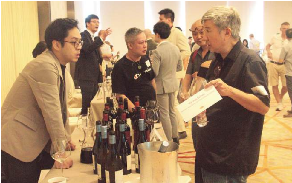
Sommeliers and aficionados engage with wine sales reps during Macau's first Australian Wine Tasting Showcase at Mandarin Oriental hotel in Nape yesterday.