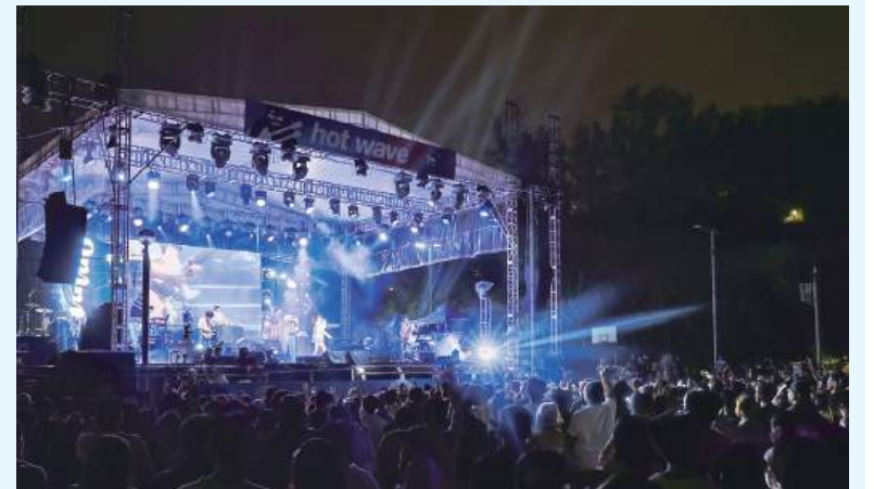
This photo provided by the Cultural Affairs Bureau (IC) on Monday shows a previous show being held at the "hush! Hot Wave Main Stage".

More details are available on www.icm.gov.mo/hush and www.mgm.mo . ■