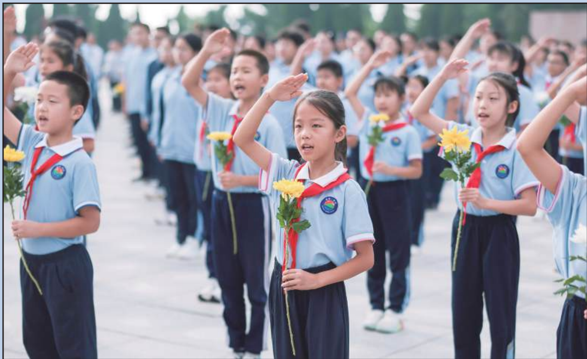
Students attend a commemorative event at a cemetery for martyrs in Rongcheng, Shandong Province, yesterday. China observed its 12 th Martyrs' Day yesterday with commemorations held across the country to honor fallen national heroes.