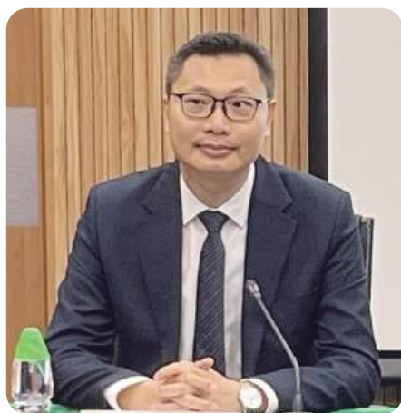
Macau Municipal Affairs Bureau (IAM) President Chao Wai Ieng looks on during yesterday's press conference at the current Government Service Centre in Areia Preta district.

Vehicles drive past the new Government Services Centre, scheduled to open next Monday, on Avenida de Venceslau de Morais (慕拉士大馬路) yesterday.