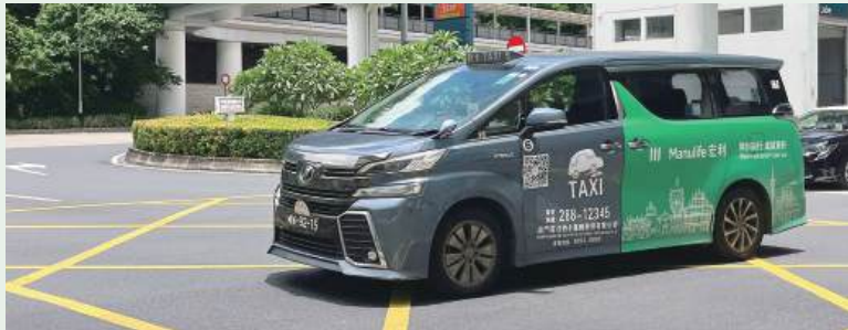
This file photo taken in June shows a "blue" radio taxi travelling along Avenida do Dr. Rodrigo Rodrigues in Zape.