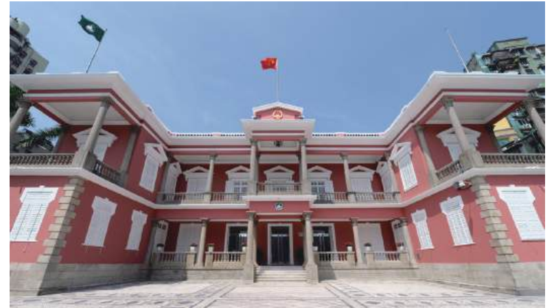
This undated handout photo provided by the Macau Government Information Bureau (GCS), shows the Macau Special Administrative Region (MSAR) Government Headquarters on Avenida da Praia Grande.

The statement noted that during the event, residents and tourists will have the opportunity to visit the headquarters' Multi-Purpose Room, Lotus Room, Grand Hall,