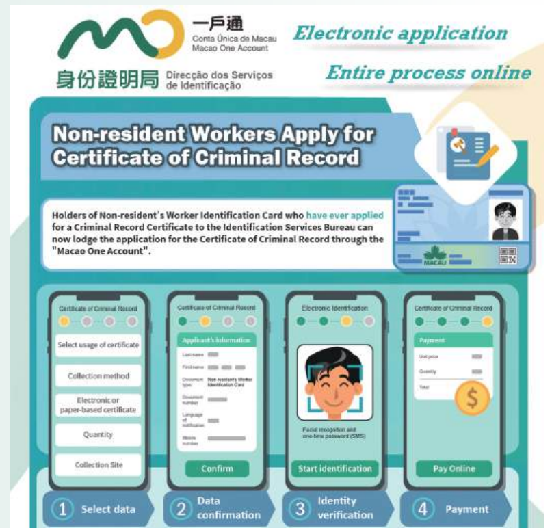
This infographic provided by the Identification Services Bureau (DSI) yesterday shows the new service launched on "Macao One Account" for non-resident workers (NRWs) to apply for their Certificate of Criminal Record.

Applicants are required to authorise the bureau to obtain their personal data from the Public Security Police, before completing identification procedures and