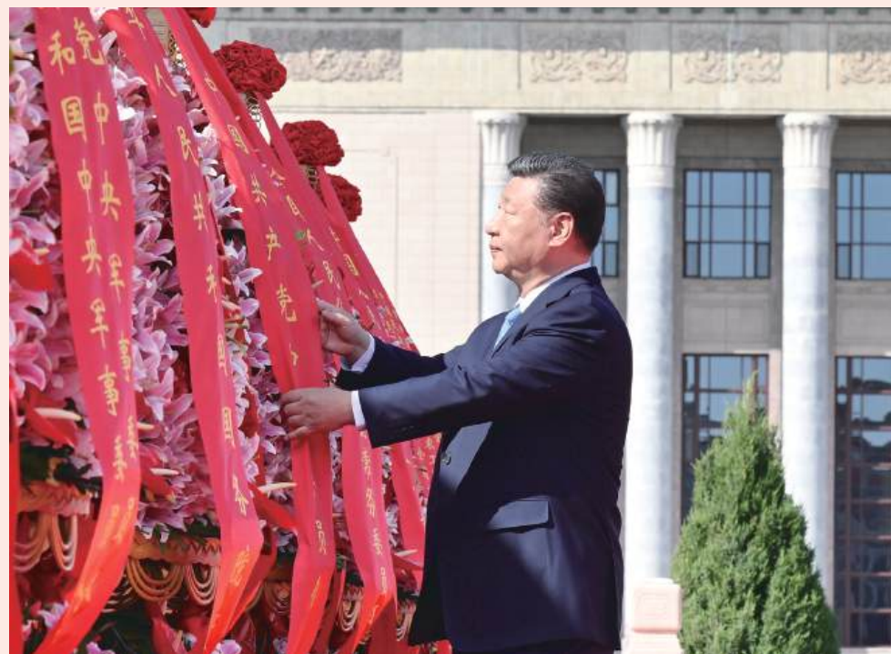
Xi Jinping straightens the ribbon on a flower basket during a ceremony to present flower baskets to fallen national heroes at Tian'anmen Square in Beijing yesterday. The event was held to mark Martyrs' Day, a day ahead of National Day. – Xinhua

The ceremony was presided over by Yin Li, a member of the Political Bureau of the CPC Central Committee and secretary of the CPC Beijing Municipal Committee. – Xinhua