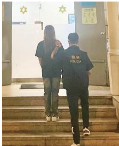
This undated handout photo provided by the Public Security Police (PSP) yesterday shows a PSP officer escorting the theft suspect into a police station.