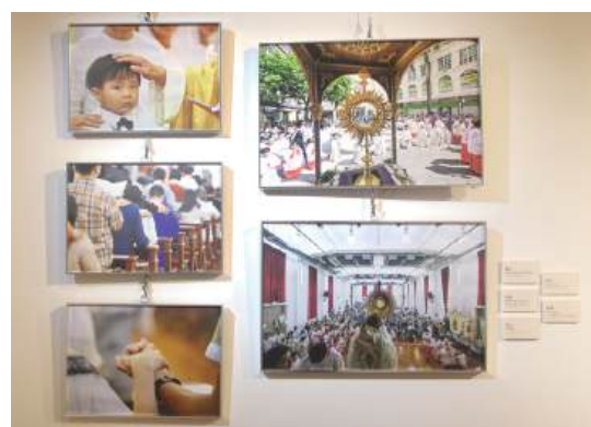
These photos taken yesterday show exhibits of the concurrent photography exhibitions – “Echoes of Heart” and “Call for Entry” – displayed at the Cardinal Newman Centre for Culture and Arts Performance of Macau (CCCN Macau) at 55 Calçada da Vitória.