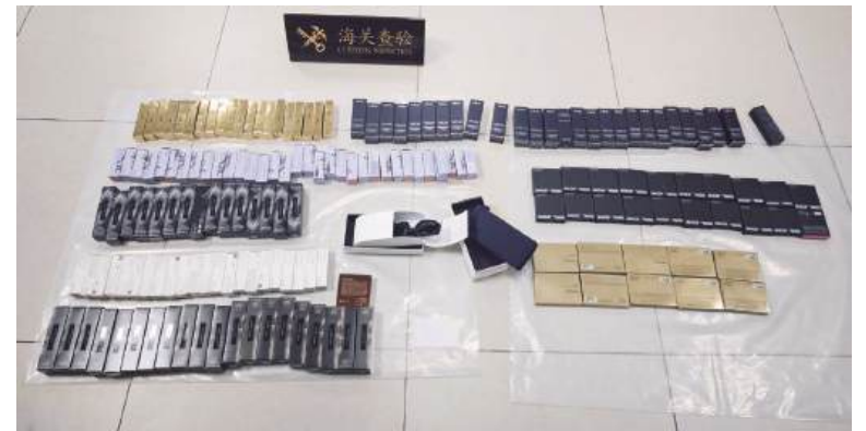
This undated handout photo provided by Zhuhai Gongbei Customs shows 169 boxes of cosmetics seized by its customs officers at the Hong Kong-Zhuhai-Macao Bridge (HKZMB) Zhuhai checkpoint.

In the statement, Gongbei Customs reminded the public that according to relevant regulations, evading customs supervision by hiding or bringing goods subject to taxes into the mainland constitutes smuggling. If the circumstances are severe enough to constitute a crime, criminal liability will be pursued. ■