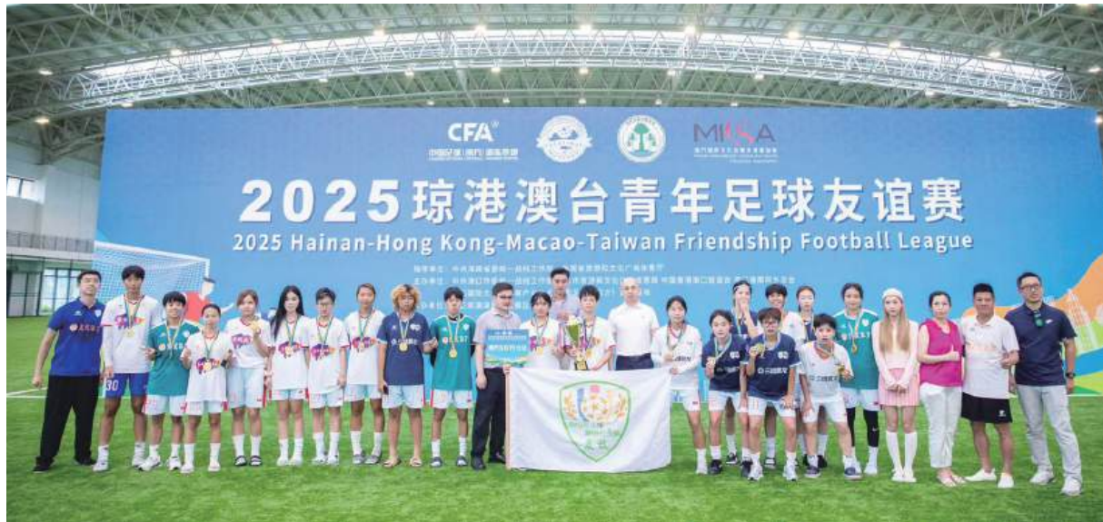
This photo provided by the organisers on Monday shows the women's football team F.C. Artilheiros Macau posing for a group photo with their medals and trophy during the third tournament day of “2025 Hainan-Hong Kong-Macao-Taiwan Friendship Football League” at the Chinese Football (Southern) Training Centre in the Mission Hills of Haikou, the capital city of Hainan Province.

schedules have consistently disrupted regular practice sessions. Therefore, he suggested that the Sports Bureau (ID) provide more policy support, such as establishing dedicated field rental time slots exclusively for women's teams. ■