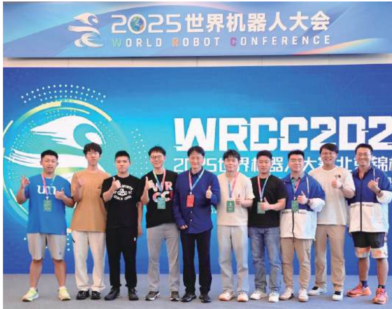
This undated and unlocated handout photo provided by the public University of Macau (UM) yesterday shows the UM team posing.