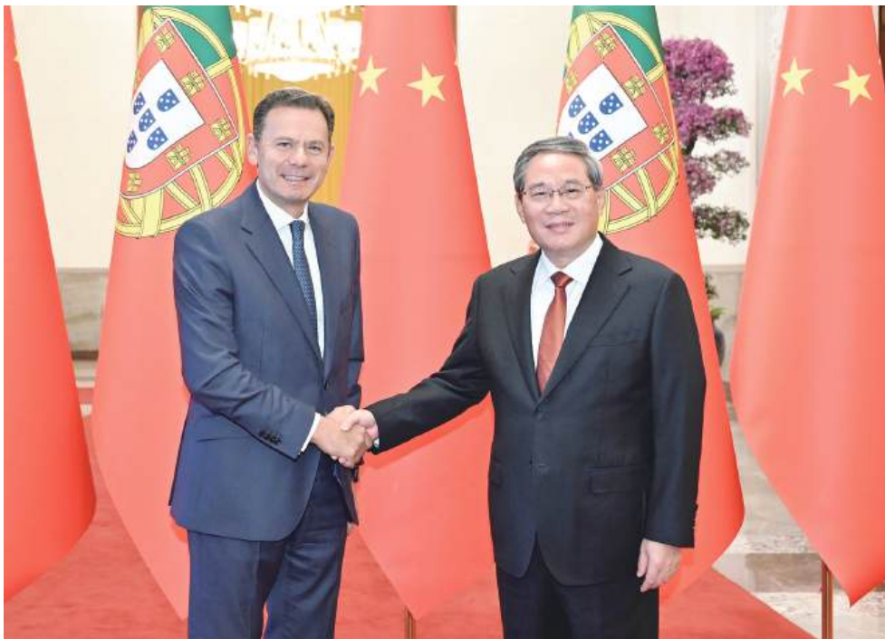
Premier Li Qiang (right) shakes hands with Portuguese Prime Minister Luis Montenegro, who is in China for an official visit, at the Great Hall of the People in Beijing yesterday. Montenegro arrived in Macao last night for a one-day visit, part of his official China trip.