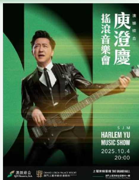
This poster released by SJM Resorts, S.A. (SJM) on Tuesday promotes the “SJM Harlem Yu Music Show” which will be held at Grand Lisboa Palace (GLP) in Cotai on October 4.

To complement the performance, the statement highlighted that SJM has introduced an exclusive hotel package priced from 5,388 patacas, the statement said, adding that the offer includes two premium concert tickets, a one-night stay