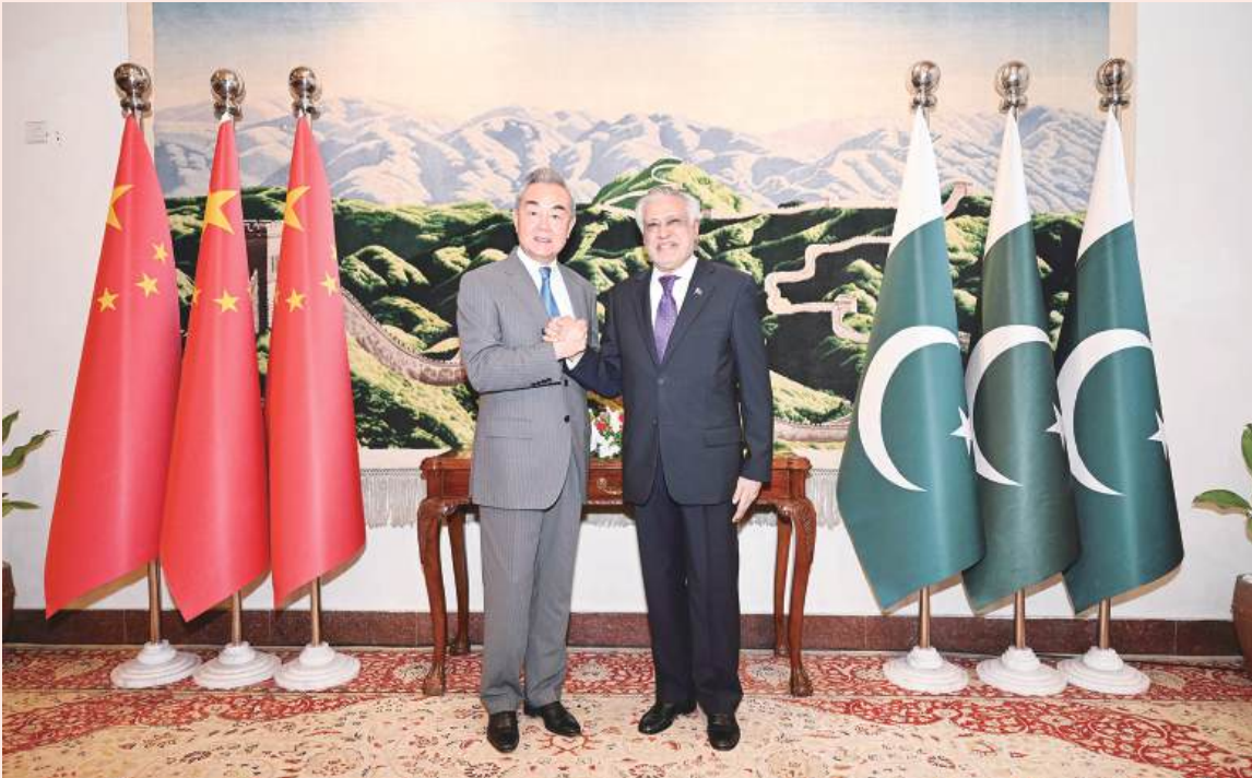
Foreign Minister Wang Yi (left), also a member of the Political Bureau of the Communist Party of China (CPC) Central Committee, co-chairs the Sixth Round of China-Pakistan Foreign Ministers' Strategic Dialogue with Pakistani Deputy Prime Minister and Foreign Minister Mohammad Ishaq Dar in Islamabad, Pakistan, yesterday.

ISLAMABAD — Foreign Minister Wang Yi yesterday said the 21 st century should be an era of accelerated development and revitalization for Asia, especially South Asia.