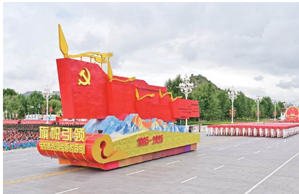
A parade float takes part in a grand gathering to celebrate Xizang Autonomous Region's 60 th founding anniversary in Lhasa, Xizang Autonomous Region, yesterday. Around 20,000 local officials and people from all ethnic groups and all walks of life joined in the celebration.