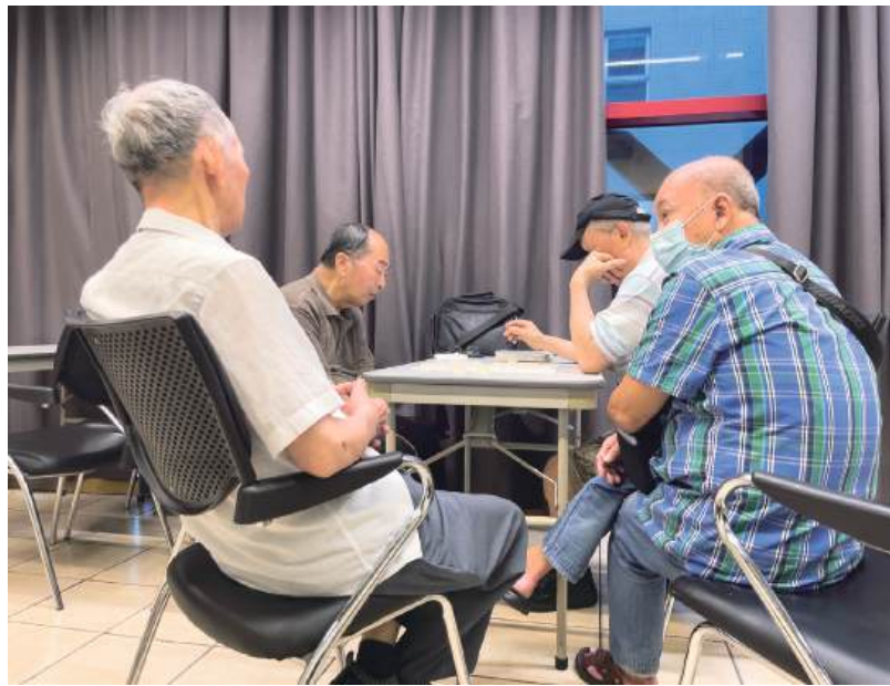
Senior citizens play chess yesterday in the activity centre of S. Domingos Market in the city centre.