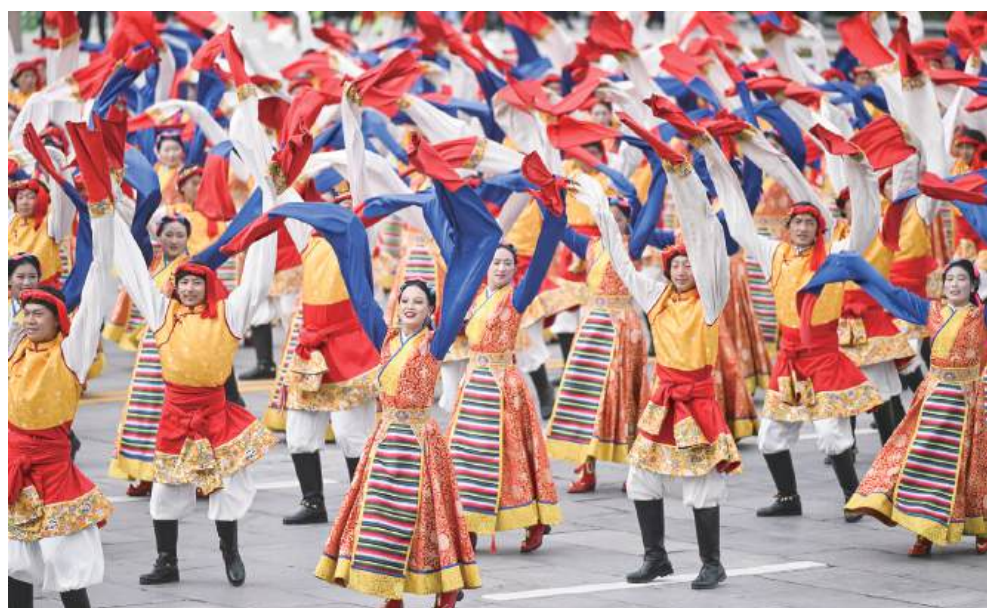
Residents take part in a mass parade during a grand gathering to celebrate Xizang Autonomous Region's 60 th founding anniversary in Lhasa, Xizang Autonomous Region, yesterday. (Story and more photos on p.7)

澳門特別行政區政府衛生局 Direcção da Saúde do Governo da Região Administrativa Especial de Macau