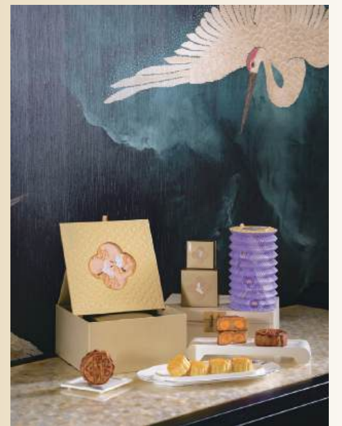
This photo downloaded from the Four Seasons Hotel Macao Facebook page last night shows its Golden Mooncake Box.

*INDIBA, based in Barcelona in Spain and Treviso in Italy, is “a global medtech leader across the Aesthetics, Rehabilitation, and Animal Health industries, with a 40-year legacy of scientific research, strengthened further by the recent addition of K-Laser”. – source: INDIBA website.