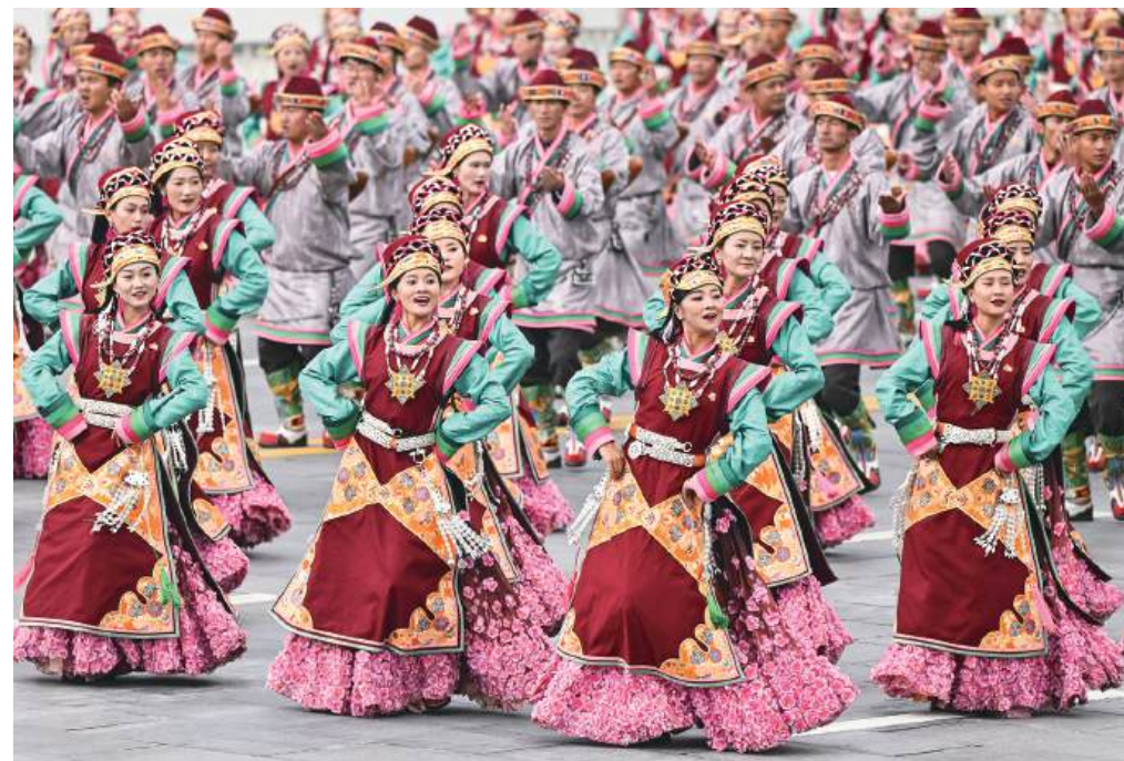
Revelers take part in a mass parade during a grand gathering to celebrate Xizang Autonomous Region's 60 th founding anniversary in Lhasa, Xizang Autonomous Region, yesterday.