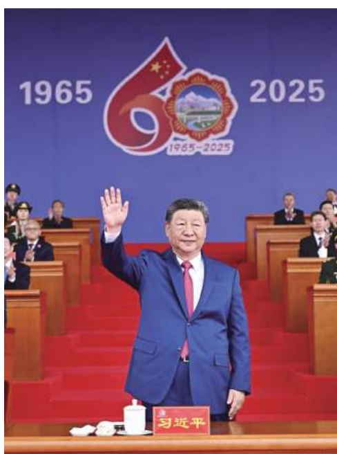
Yesterday morning, some 20,000 officials and members of various ethnic groups from all walks of life gather at the Potala Palace Square in Lhasa to warmly celebrate the 60 th anniversary of the establishment of the Tibet Autonomous Region. The celebration was attended by Xi Jinping, general secretary of the Communist Party of China (CPC), president of the country, and chairman of the Central Military Commission.