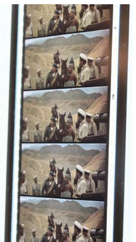
Photos taken yesterday at Cinematheque•Passion on Travessa da Paixão (戀愛巷).