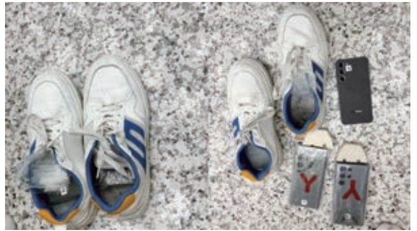
This undated handout provided by Zhuhai's Gongbei Customs shows four used smartphones wrapped in plastic film hidden inside the smuggler's shoes.

According to Macau's External Trade Law, the four persons who smuggled electronic products or foodstuff face a maximum fine of 50,000 patacas each, while the seized contraband has been