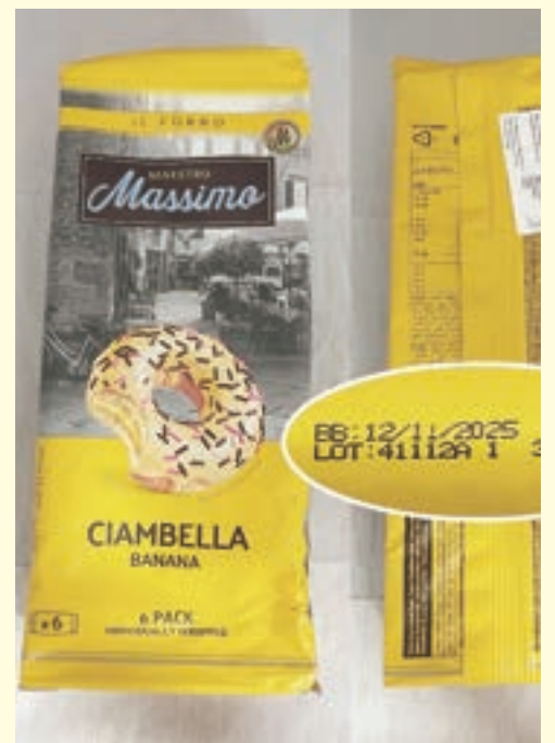
This undated handout photo provided by the Municipal Affairs Bureau (IAM) on Saturday shows the problematic packaged cakes from Italy found to contain excessive sorbic acid preservatives.

*“Sorbic acid” is a naturally occurring organic compound used as a preservative in food, cosmetics, and pharmaceuticals due to its ability to inhibit the growth of mould, yeast, and some bacteria. – DeepSeek