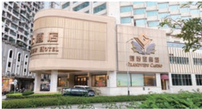
A car drives past Grandview Hotel yesterday where Grandview Casino is located on its ground floor.

Yesterday's DICJ statement said that after business negotiations, Grandview Casino's third-party