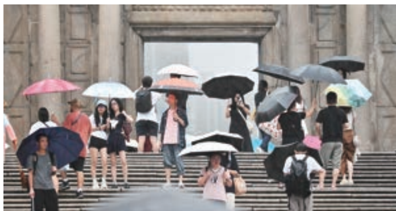
Tourists armed with umbrellas during heavy rain gather in front of the UNESCO World Heritage-listed Ruins of St. Paul's last week.

The combination of heat and storm patterns raises the risk of heatstroke, slippery conditions, and possible local flooding, the bureau warned, adding that both residents and tourists are advised to stay hydrated, minimising outdoor exposure during peak heat or storm periods, and staying updated on alerts via the official SMG website. ■