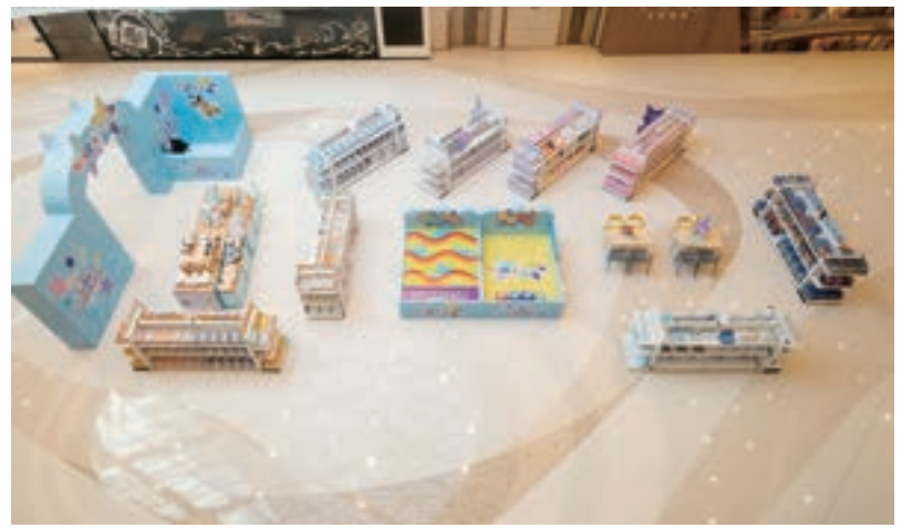
This undated handout photo provided by NOVA Mall on Friday shows a top-down view of the pop-up set up at the mall's Atrium for the “Star IPs Extravaganza” campaign.

*A gashapon is a type of capsule toy or collectible that is dispensed from a gashapon machine. – Source: Poe