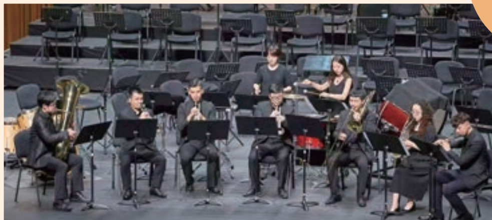
Magalo Arts Ensemble performs at the Macau Cultural Centre on July 19.