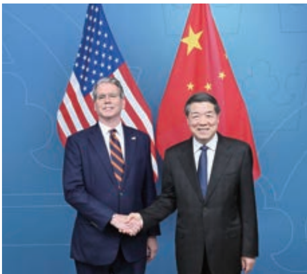
Vice Premier He Lifeng (right), also a member of the Political Bureau of the Communist Party of China Central Committee, shakes hands with US Treasury Secretary Scott Bessent prior to a new round of China-US economic and trade talks in Stockholm, Sweden, yesterday.

The tournament starts today at 10 a.m. and ends on Sunday. A total of 53 matches are scheduled for today. ■