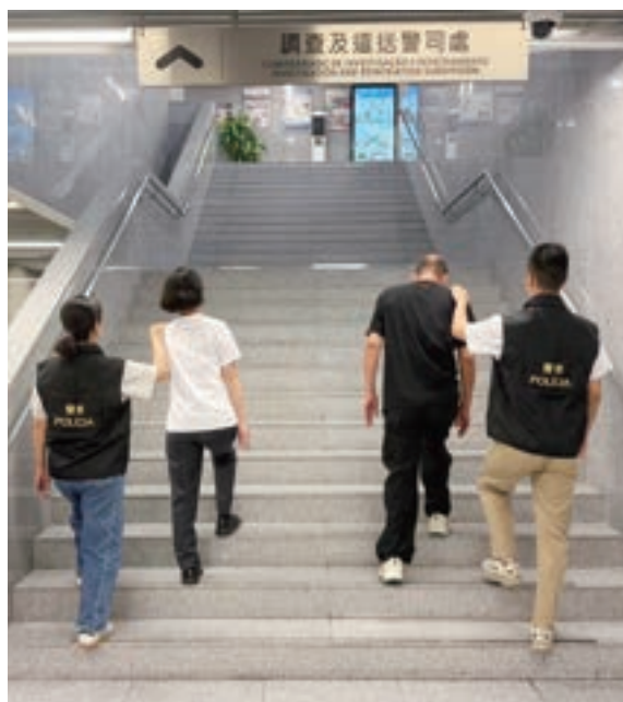
This undated handout photo provided by the Public Security Police (PSP) yesterday shows PSP officers escorting the fake marriage suspects into a police station.

The duo have been transferred to the Public Prosecutions Office (MP), each facing a document forgery charge. ■