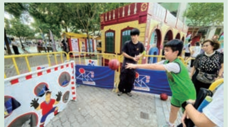
This handout photo taken at the Lok Yeong Fa Yuen residential building's sitting-out area shows players participating in one of the various games during Saturday's "Macau Sport For All" event hosted by the Sports Bureau (ID).