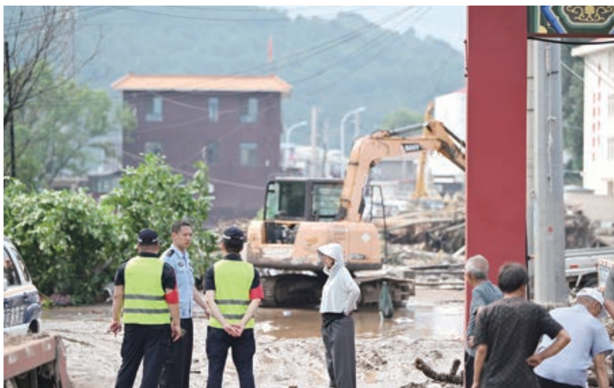
Emergency workers are on duty at Xiaying Village of Xiaying Town, Jizhou District of Tianjin Municipality, yesterday. Houses, bridges and power lines at part of villages in Jizhou were damaged by floods inflicted by recent heavy rainfall and upstream runoff. Local emergency operations including search and rescue, evacuee transfer, and disaster relief are orderly going on. – Xinhua

Li, who is also a member of the Standing Committee of the Political Bureau of the CPC Central Committee, called for reinforcing extreme weather monitoring, strengthening the inspection and assessment of embankments for rivers and reservoirs, and enhancing the identification of urban waterlogging risks. – Xinhua