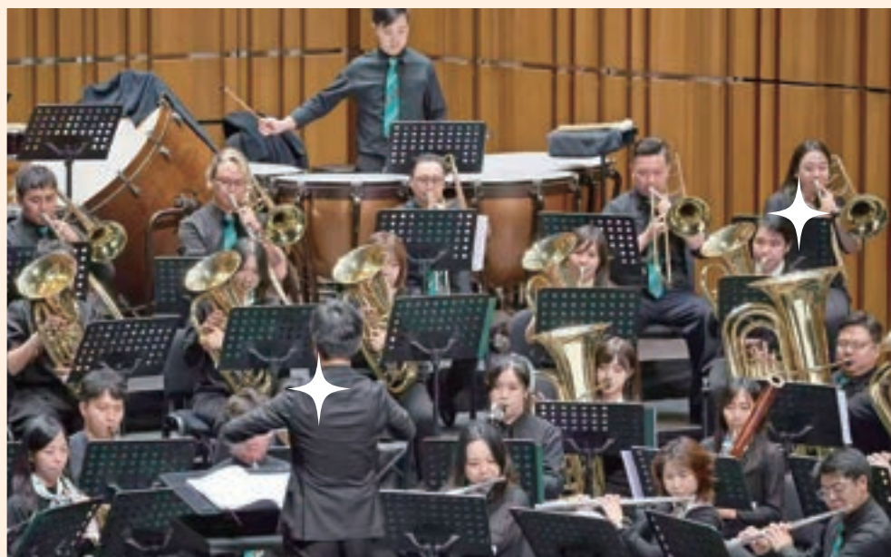
Macau Continuo Winds performs at the Macau Cultural Centre on July 19.