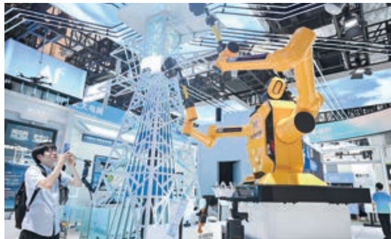
A fairgoer looks at a robot for live-line maintenance at the 2025 World AI Conference (WAIC) in Shanghai yesterday.

At iFLYTEK's exhibition area, the Spark X1 large model unveiled on July 25 has drawn significant attention from international visitors, who asked