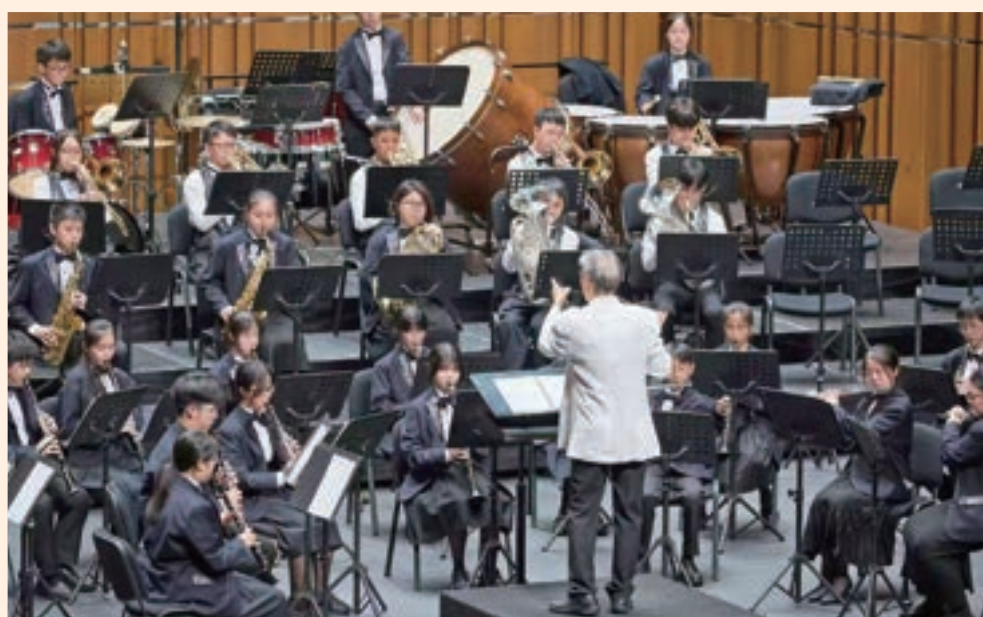
Hong Kong Cognitio College Symphonic Band performs.