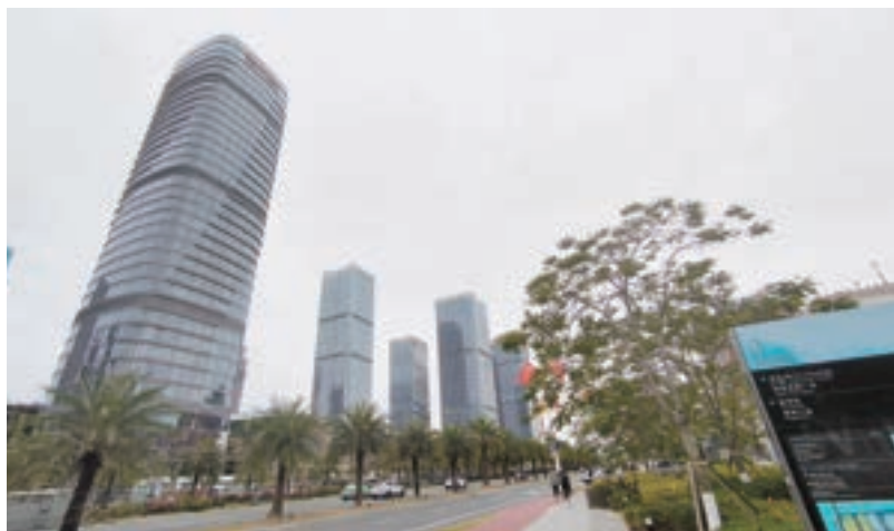
This photo taken earlier this year shows the property (first building from left) that will have some of its office units converted into a three-star hotel.