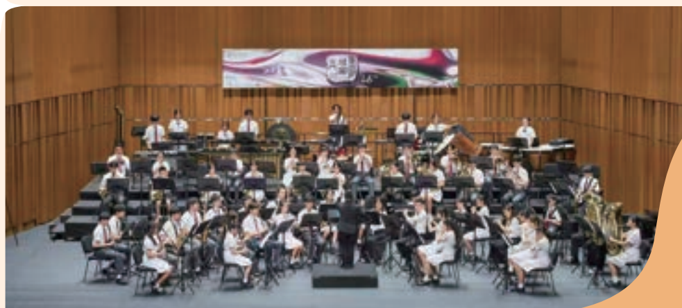
Macau Pui Ching Symphony Band performs.