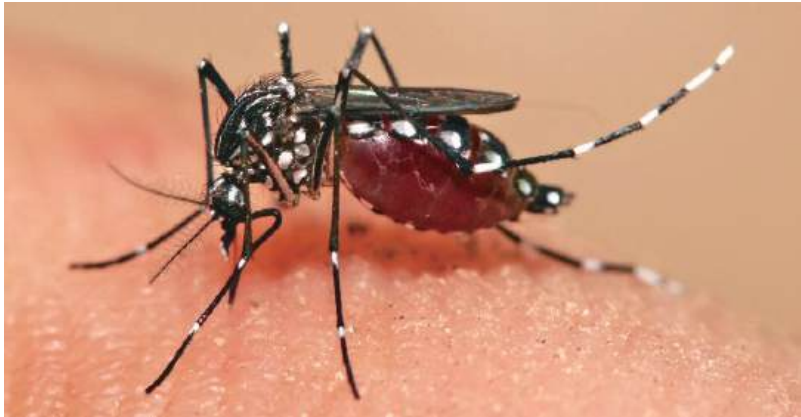
This 2009 file photo shows an Aedes aegypti mosquito feeding in Dar es Salaam, Tanzania.