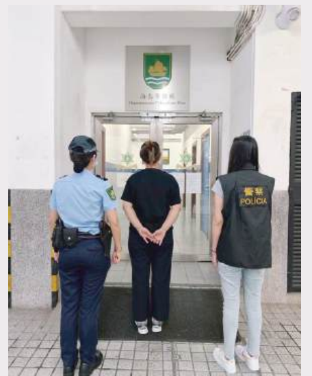
This undated handout photo provided by the Public Security Police (PSP) yesterday shows PSP officers escorting the theft suspect into a police station.