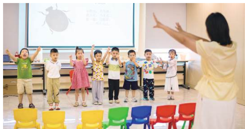
Children sing songs with their teacher at a community service center in Shangcheng District of Hangzhou City, capital of Zhejiang Province, yesterday. Community service centers in Hangzhou provide childcare assistance and various activities to enrich children's summer vacation.

Sam noted that his 2025 Policy Address, which he delivered in April, outlines the government's commitment to strengthening its support and investment in diversifying the city's industries, where the government will cultivate new industries with international competitiveness, make better use of non-gaming investments to support the city's appropriate economic diversification, create a mechanism for identifying investment projects aligned with Macau's long-term development, and accelerate the completion of its ongoing study on the feasibility of setting up new public funds aiming to promote the development of nascent industries and to transform scientific research achievements into the industries' development. ■