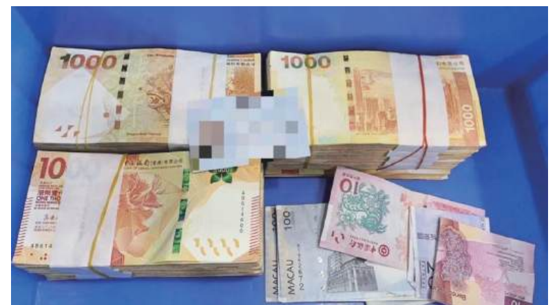
This undated handout provided by Zhuhai Gongbei Customs yesterday shows HK$ 1,445,000 in undeclared cash seized by the adjacent city's customs officers.

traveller is only permitted to carry non-mainland currency equivalent to 20,000 yuan when entering the mainland each time. Travellers must inform customs officers if they need to carry foreign currency in cash exceeding the maximum allowed amount.