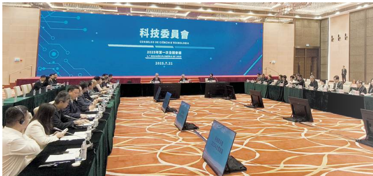
Members of the government-appointed Science and Technology Council, comprising government officials as well as experts, scholars and community leaders from the city's science and technology sectors, attend yesterday's meeting chaired by Chief Executive Sam Hou Fai at the Forum Macao Complex.