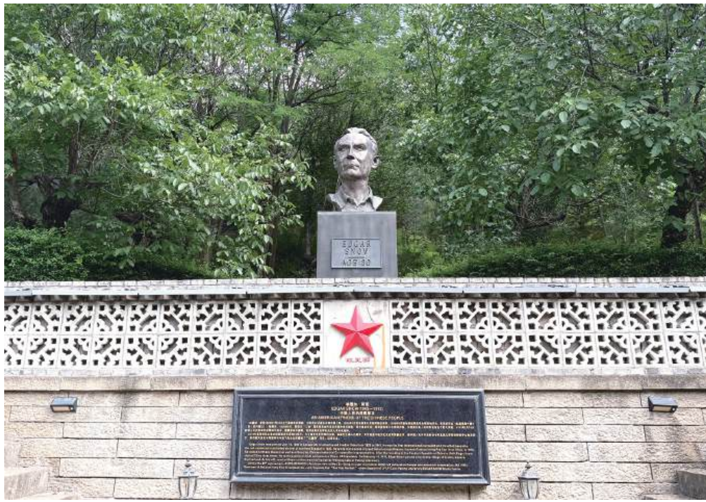
This photo taken on July 13, 2025 shows a bust of American journalist Edgar Snow at the Red Star Garden in Yan'an, northwestern Shaanxi Province.

The spirit of Snow's extraordinary bond with China still lingers in Yan'an's sun-baked hills. Today, a new generation of global visitors retraces his path – seeing China not