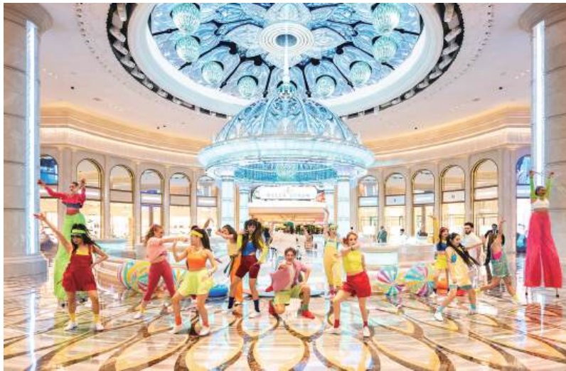
This undated handout photo provided by Galaxy Macau yesterday shows performers in the “Summer Colourful Parade” posing at the integrated resort in Cotai.

There will also be exclusive shopping privileges and a lucky