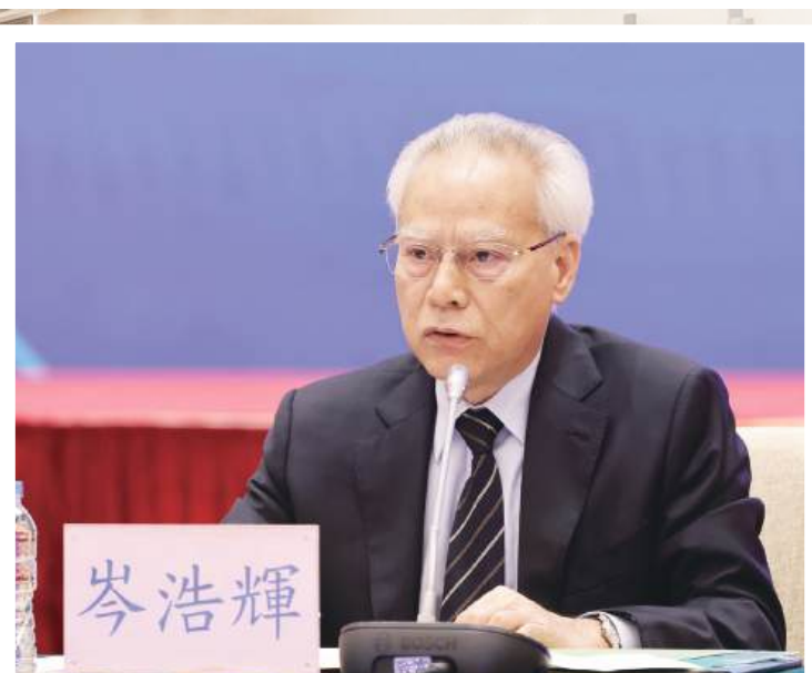
Chief Executive Sam Hou Fai addresses the Science and Technology Council's first 2025 plenary meeting at the Forum Macao Complex yesterday.