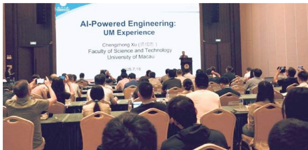
UM hosts the Annual Meeting of the Guangdong-Hong Kong-Macao University Engineering Alliance and the High-Level Forum on Digital Intelligence Empowerment for New Engineering Talent on Friday.