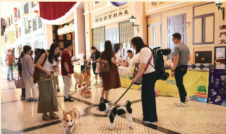
This photo taken and provided by Lisboeta Macau on Saturday shows participants and their "furry friends" gathering at the Cotai resort's "Pet Pet Loving Festival" event venue, Old Macau Street.

Saturday's pet-fest lasted from 11 a.m. to 6 p.m. ■