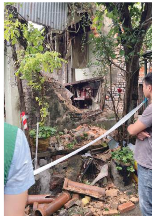
A villager and DSSCU official look at the cordoned-off old house damaged by Typhoon "Wipha" in Chi Lam Village yesterday afternoon.