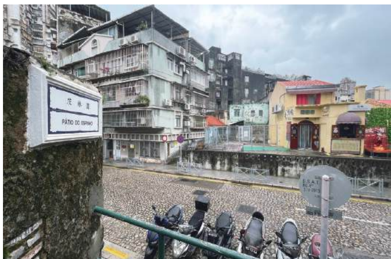
This photo taken yesterday afternoon shows the fenced-in plot of land next to a café dedicated to Na Tcha, one of China's most popular protection divinities, at 5 Pátio do Espinho in Chi Lam Village behind the UNESCO World Heritage-listed Ruins of St Paul's.

Chi Lam Vai ("Potato Field Courtyard") is known in Portuguese as Pátio do Espinho ("Thorn Courtyard"). ■